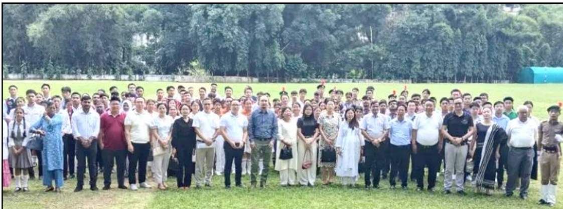
Mopung temürek atema tezüngzüktep agitsü asoshi Honibarnü Livingstone Foundation International School, Dimapur nung kaketshir, tesayur aser Dimapur nungi ketdangsürtem adenshia aliba noksa nung angur.

Dimapur, Rongjui/Sept. 08 (TYO): Mopung temürek atema tenangzükbä agitsü asoshi Dimapur nungi kaketshir, tesayur aser ketdangsür tem Honibarnü Livingstone Foundation International School, Dimapur nung adenshia liasü.