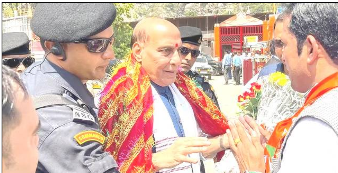
Ramban, September 08, 2024: Union Defence Minister aser BJP lenir, Rajnath Singh J&K Assembly elections atema nüboyim sentong ka nung adentsü atema arudang tangokba noksa nung angur.

Srinagar, September 08 (Agencies): Jammu & Kashmir assembly elections atema Amongnü Bharatiya Janata Party (BJP)-i 'list' trokbuba nung candidate 10 tenüng sangdongogo.