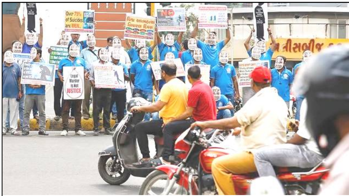
September 08, 2024 nü Ahmedabad nung World Suicide Prevention Day anogomong nung telok ka nung züngsemtemi soseta asüba dak sendakba awareness campaign agidang tangokba noksa nung angur.

Iba ki ya küm pezü tejaklen ang asüba liasü aser Honibarnü iba ki chirepba mapang nungji ki tsünglanglen kisüba mapa teinyakdak liasü.