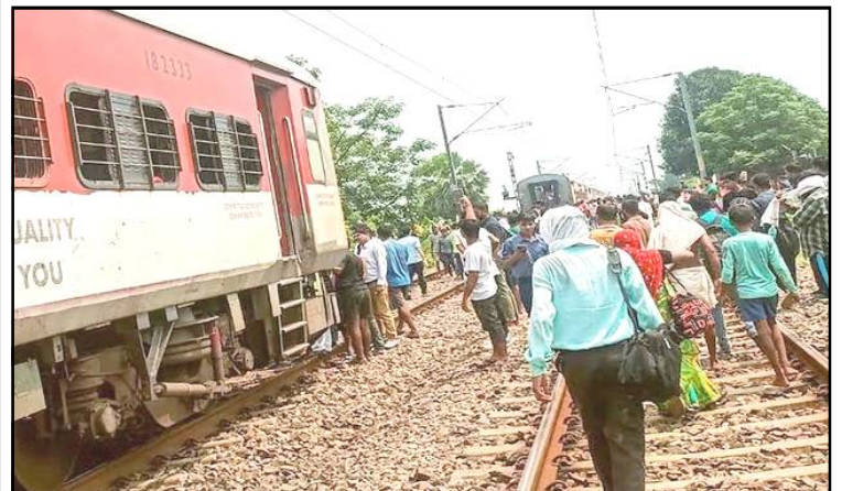
September 08, 2024 nü Buxar nung Tudiganj station anasa Magadh Express train lendong ajuruba sülen tangokba noksa nung angur.

Tang atema state ana nem sen crore 3,448 agütsütsü, ta minister-i sangdongogo.