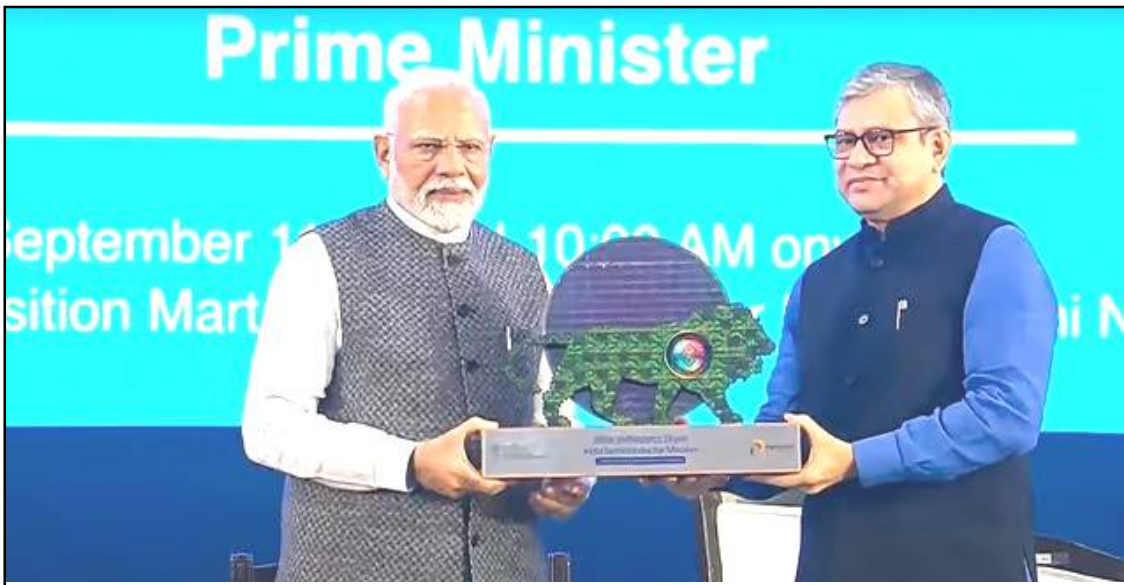
September 11, 2024 nü Uttar Pradesh kübok Greater Noida nung SEMICON India 2024 tetenzük sentong nung Union Minister of Electronics & Information Technology, Ashwini Vaishnaw-i Ato kilonser, Narendra Modi nem nungo ka agütsüdüng tangokba noksa nung angur.