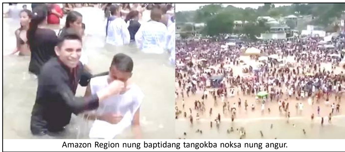
Amazon Region nung baptidang tangokba noksa nung angur.