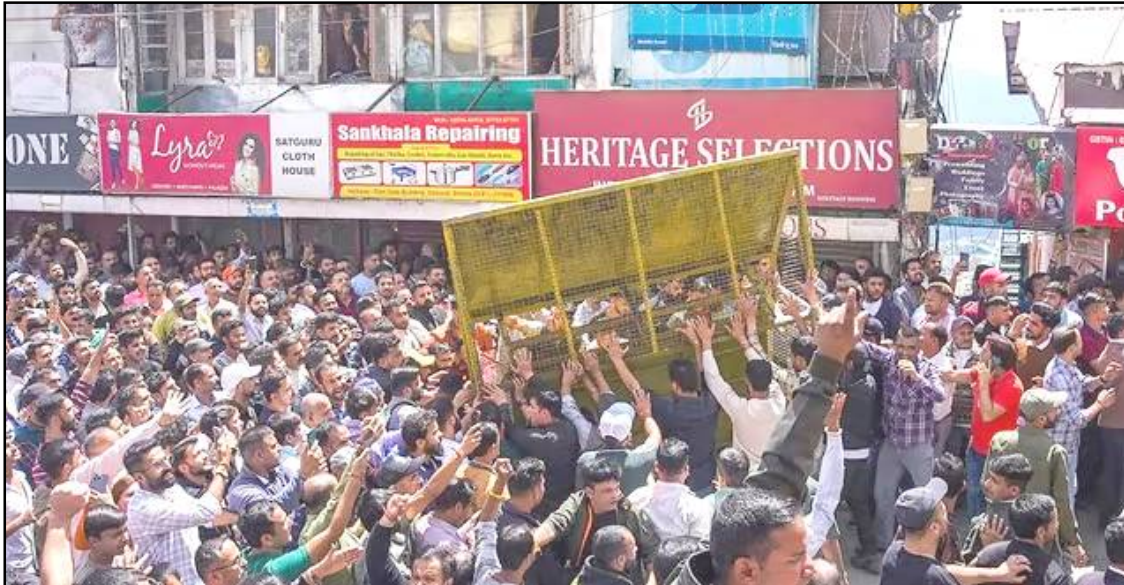
September 11, 2024 nü Shimla nung Sanjauli kiyong ka nung Muslim nungertemi ozüng alema mosque ka asü, ta tai tonglokja Hindu nungertemi longkak aita mosque ji bendokjang ta takhangba agütsüdüng tangokba noksa nung angur.

Health department-isa iba wara ya menatepba wara masü, ta metetdaksüogo.