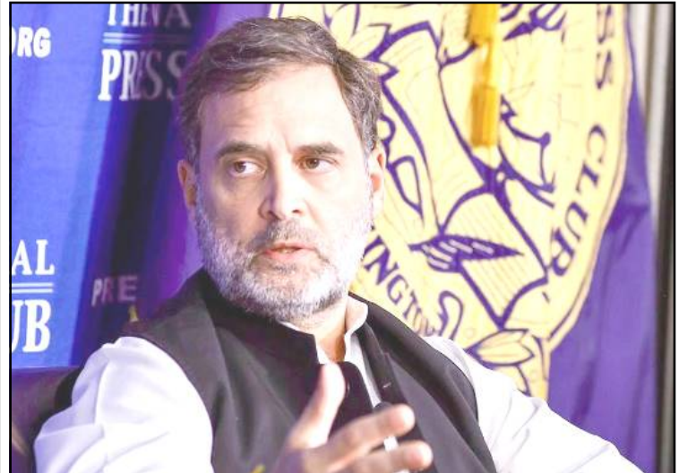
September 11, 2024 nü Washington D.C nung Lok Sabha nung opposition lenir, Rahul Gandhi-i National Press Club nung osangbenertem den jembidang tangokba noksa nung angur.

“Himachal Pradesh ya yimjung aliba state ka lir. Yangi tamangba lokti tsünga merarar, ajisüaka tangbo tensa ka adokogo. Sorkari menoa teinyaksü tim meinyakba agi nüburttem kanga jashir,” ta paisa metetdaksü.