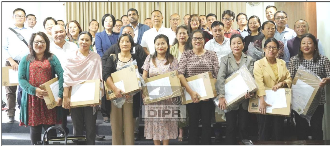
NECTAR Project ajanga school & department nem laptop agütsüba sentong nung tangokba noksa angur. (Kohima, Sept. 11, 2024)