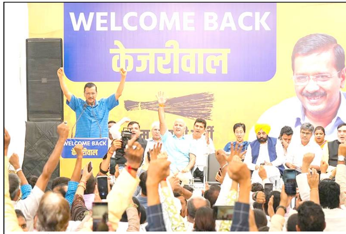
Delhi Chief Minister Arvind Kejriwal-i New Delhi nung party workers' tem senden nung o jembiba mapang tangokba noksa nung angur.

New Delhi, Rongjui/ September 15 (Agencies): AAP tekolakba Arvind Kejriwal-i Deobarnü sangdong ka ajanga pai taruba anogo ana tsüingda Delhi chief minister mapa toktsütsü ta metetdaksüogo.