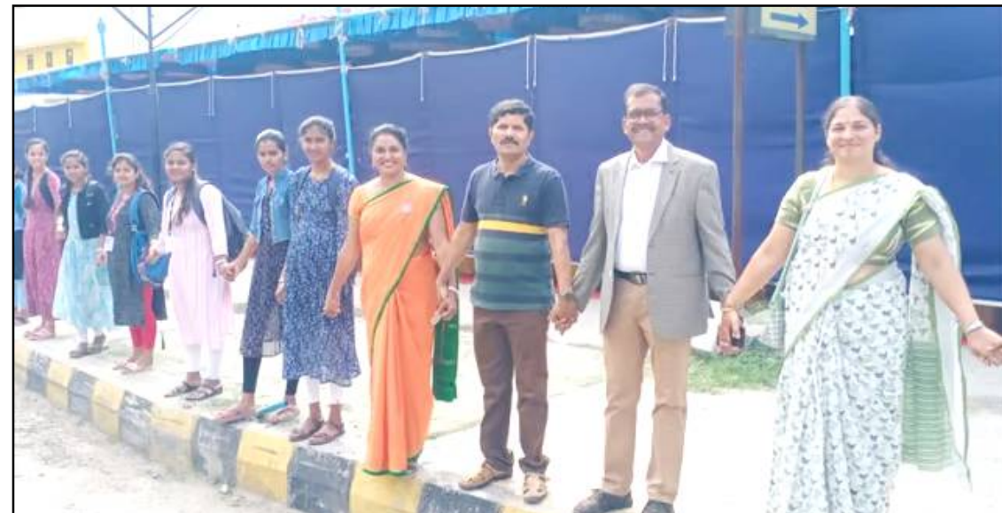
Karnataka nung Deobarnü equality, unity, fraternity, aser participative governance temaitsü otsüsütsüsa 2,500-km talang human chain ka yanglua 'International Day of Democracy' mungogo. Iba human chain ya alima nung talangtiba asütsü ta Karnataka sorkari ashi, koba Bidar nungi Chamarajanagar tashi district 31 prongla ayimjema yanglua liasü.