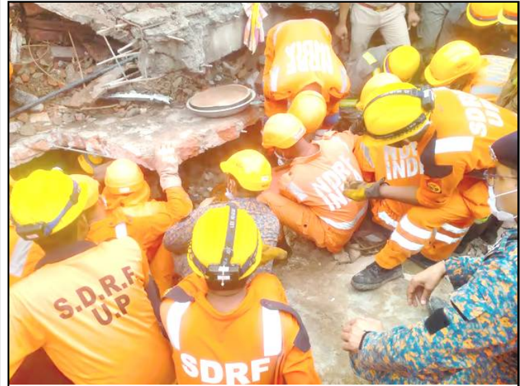
Meerut nung ki ka chirepba sülen anogo anabuba teküzmükba maparen benoka inyakogo. Uttar Pradesh kübok Meerut nung Honibarnü asemen tashi atongtepa tua sür aliba ki ka chirepba sülen tang tashi nung nisung 10 asüba jangjaogo aser teküzmükertemi ki telung ano nisung ka sabanga aliba küzmüktsü maneni merangdar.

June ita home minister Amit Shah-i, CM Nayab Singh Saini lenisüba nung BJP taruba Haryana election nung tokteptsü temsüa lir, ta ashi.