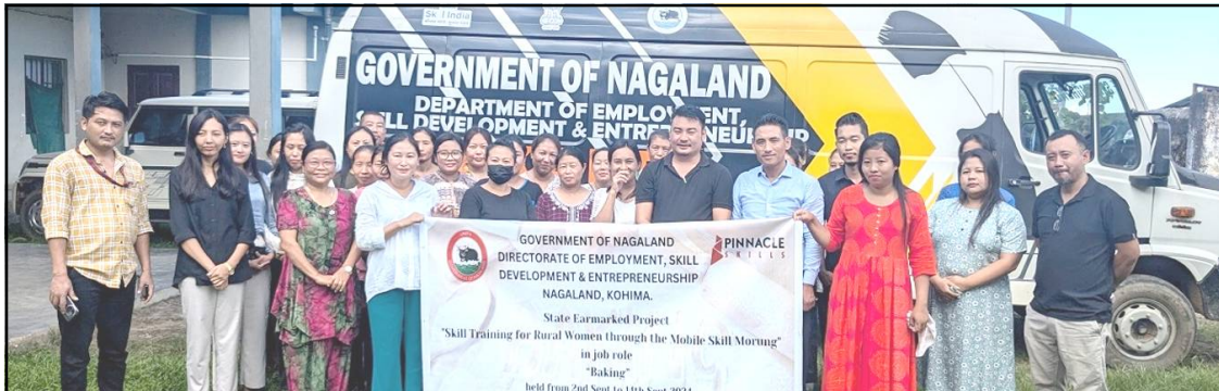
Department of Employment, Skill Development & Entrepreneurship ajanga Mangkolemba nung amtsük yanglutsü atema "Skill Development for Rural Women through Mobile Skill Morung" training hopta ana agütsüba sentong September 14, 2024 nü tembangdang tangokba noksa ka yangi angur.

Dimapur, Rongjui/Sept. 17 (TYO): Department of Employment, Skill Development & Entrepreneurship ajanga Mangkolemba nung amtsük yanglutsü atema "Skill Development for Rural Women through Mobile Skill Morung" training agütsüba sentong September 14, 2024 nü tembanga liasü.