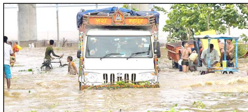
Patna nung tzünglu kanga sashia aruba ajang Ganga ayong moshia ayimba sülen garitem tzü agi metsünger aliba lenmang ka ajang aoba noksa nung angur.

West Bengal sorkari ashiba agi, Hombarnü doctor tem sensaksemstü atema jaokba ya pongubenbuba aser tatembangbuba liasü.