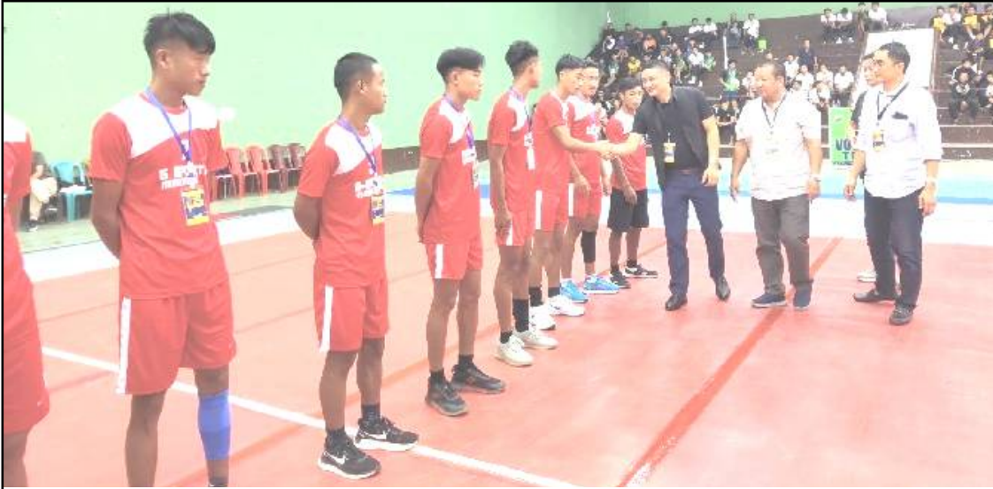
Mkg. nung 17th Imchaba Master Memorial Open Volleyball Trophy 2024 tenzükba sentong nung Inaugural Patron SDO(C) Mokokchung Wb.Temsuchuba Jamir-i mezüngbuba Match asayartem den metetpela-a salem süa aoba mapang nung tangokba noksa.

Mokokchung, September/ Rongjui 17 (TYO): Mokokchung District Volleyball Association-i (MDVA) ayongzuka 17th Imchaba Master Memorial Open Volleyball Trophy 2024 tanü Multi-Purpose Sports Complex, Mokokchung nung tenzükogo.