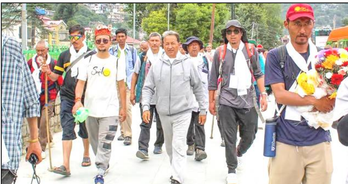
Kullu district (Himachal Pradesh), September 18, 2024: Climate activist, Sonam Wangchuk-i linük temzüng Sixth Schedule nung Ladakh züngokang, ta takhangba agüja Ladakh nungi Delhi tashi aodang tangokba noksa nung angur.