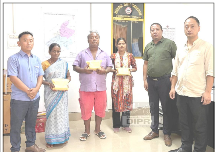
Pherima village nung September 3, 2024 nü alinen aluba lendong nung asüba kinunger nem September 18, 2024 nü ADC Chümoukedima, Dr. Kuzonyi Wideo aser DDMA ketdangsür temi teyari sen (Ex-gratia) amoktsüdang tangokba noksa nung angur.

Tetoktepba nung takok angur nem sentong akhumdong ajanga sempet agüja liasü, kong Tseminyu Town mezüngbuba jenjang, Chunlikh tanabuba jenjang aser tasembuba jenjang Tsokhinsin & Phenda Village ajanga ngua liasü.