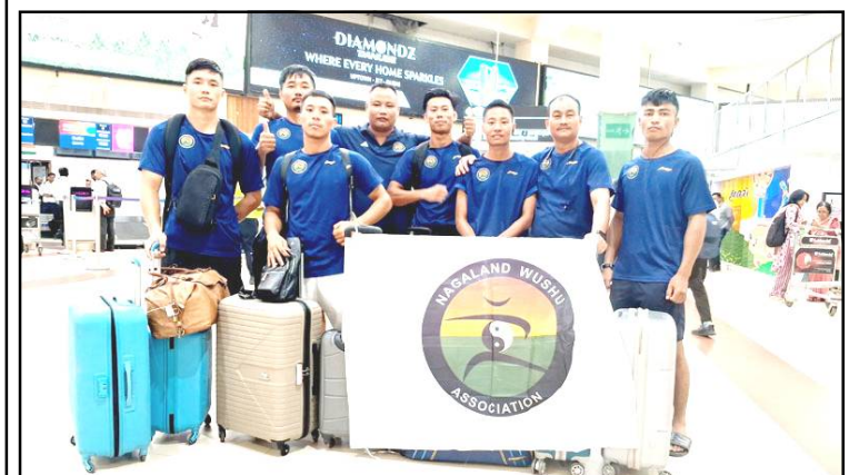
Nagaland nungi 33rd Senior National Wushu Championship nung tokteptsü asoshi Dehradun-i maodang Guwahati nung tangokba noksa nung angur.

Dimapur, Rongjui/Sept. 20 (TYO): Nagaland nungi Wushu fighter pongu den team ketdangsür asem tashi Dehradun, Uttarakhad nung 33rd Senior National Wushu Championship nung toktetsü asoshi Hokulbarnü Dimapur nungi ogo.