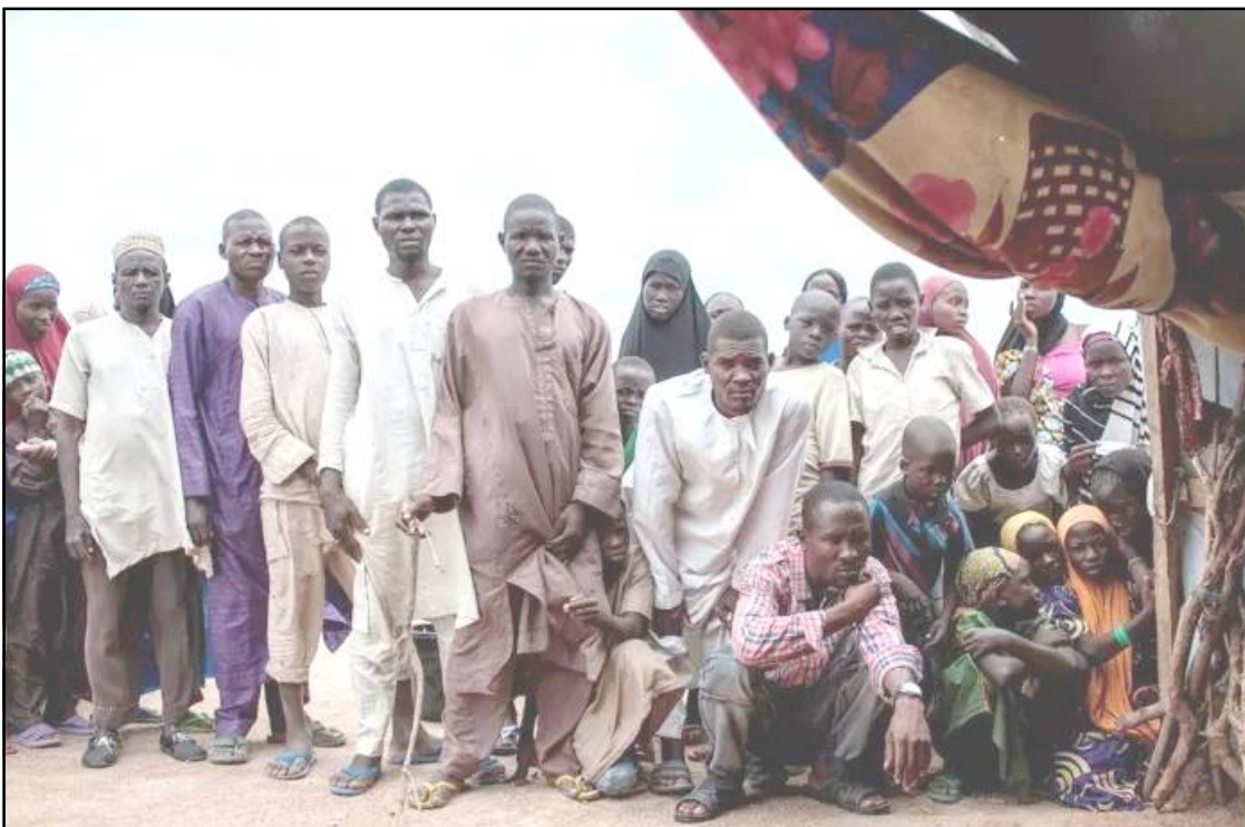
Nigeria kübok Pulka nung aliba IDP (Internally Displaced People) camp nung alirtem telok ka tangokba noksa nung angur.

Tesüiba kum pongu tashi Barnabas aser par kibonga süki tilaka nung lidar. Camp nung alirtem anogo shia chiyungtsü agi kanga anünger.