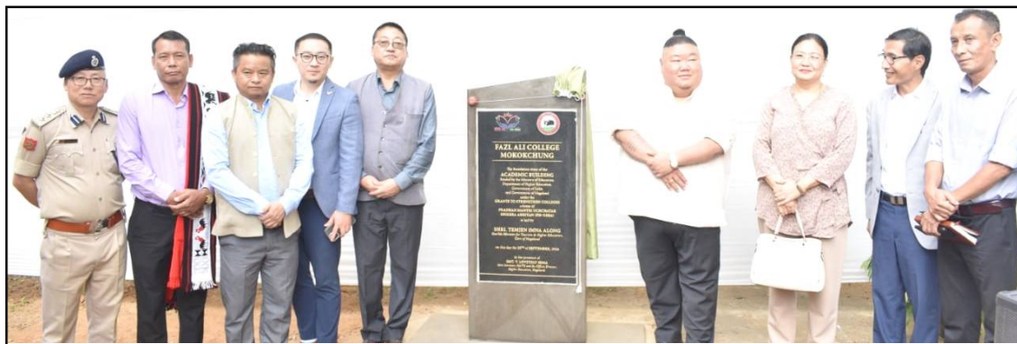
Fazl Ali College Mokokchung nung Minister, Higher Education & Tourism, Temjen Imna Along-i September 20, 2024 nü Commerce Building lapoktsür külen tangokba noksa.

Mokokchung, September/ Rongjui 20 (TYO): Fazl Ali College Mokokchung nung September 20 nü Minister, Higher Education & Tourism, Temjen Imna Along-i Commerce Building renemer aliba lapoktsüogo, iba den külemi ano Minister-isa PM-USHA sentong kübok New Academic Building ka asütsü asoshi lungzüng azüngtsüogo. PM-USHA sentong kübok