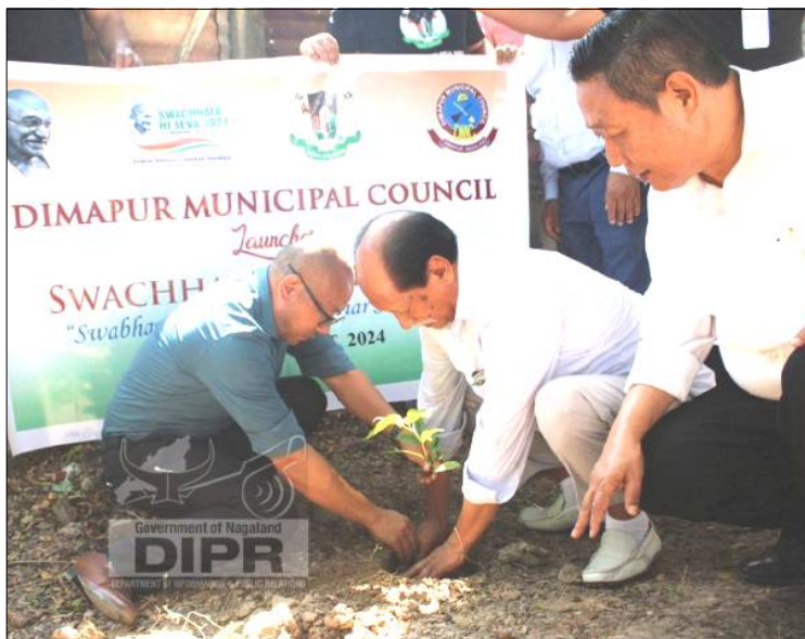
September 20, 2024 nü Chief Minister Neiphiu Rio-i Dimapur Municipal Office kima nung süngdong ka atemba angur.

Dimapur, September 20, 2024 (TYO): Nagaland Chief Minister Neiphiu Rio-i September 20, 2024 nü Dimapur Municipal Office tasenba lapoktsügo.