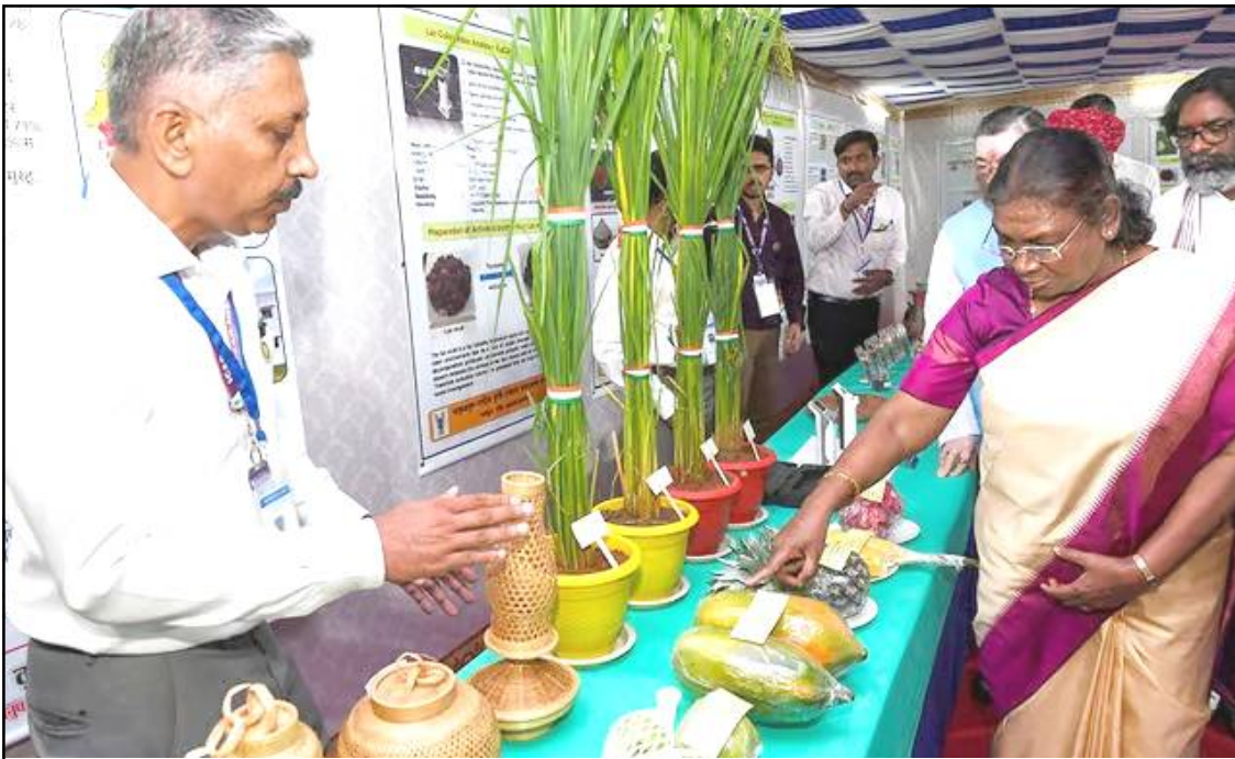
September 20, 2024 nü Ranchi nung ICAR-National Institute of Secondary Agriculture (NISA) küm 100 ajungba mong sentong nung linük Tir, Droupadi Murmu-i exhibition stall ka semdangba mapang tangokba noksa nung angur.