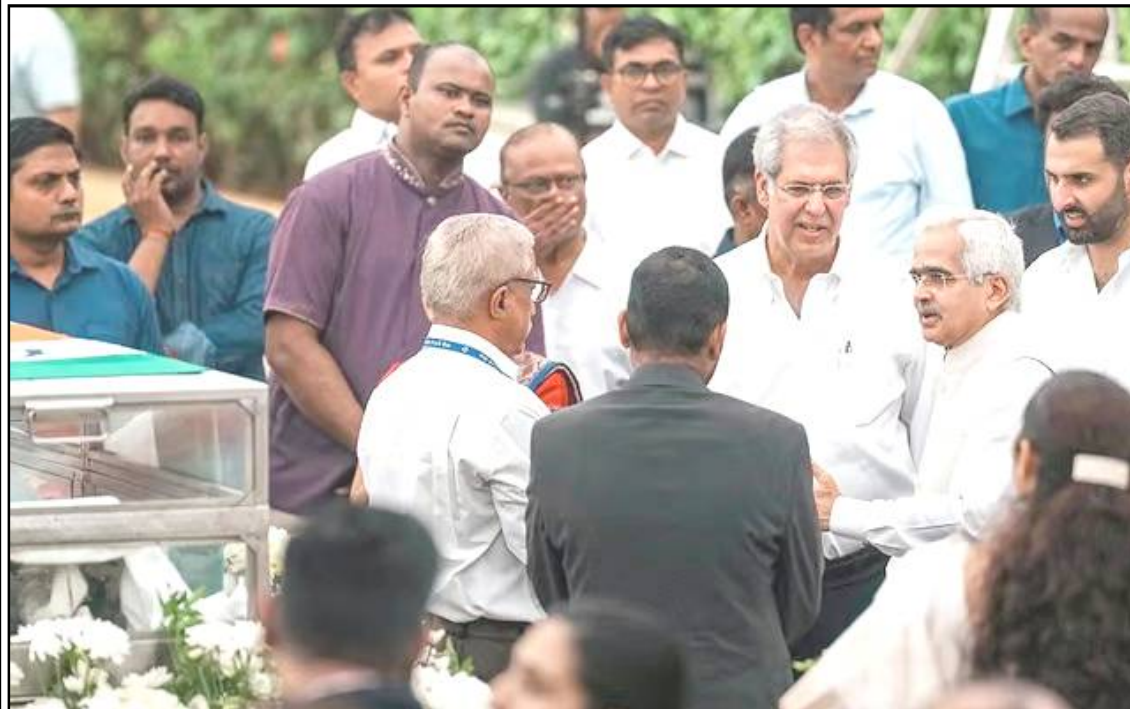
October 10, 2024 nü Mumbai nung RBI Governor, Shaktikanta Das den tangartem business lenir, Ratan Tata nem akhüm agütsüdang tangokba noksa nung angur. Taoba mapang Tata Group Chairman Ratan Tata Bodhbar aonung Mumbai nung aliba hospital ka nung süogo. Pa arrshi küm 86 liasü.

Committee-i Lok Sabha elections aser state assemblies elections külemi mapang ka nung dang agitsü, iba sülen anogo 100 tsüngda municipalities aser panchayat election agitsü benoka lir.