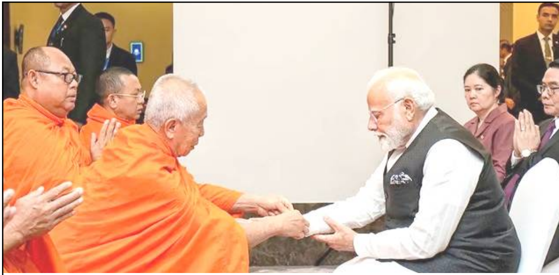
October 10, 2024 nü Vientiane, Laos nung Buddhist putirtemi Ato kilonser, Narendra Modi moatsüdang tangokba noksa nung angur. 21buba ASEAN-India senden nung adentsü atema Ato kilonser Modi Laos-i oa lir.

New Delhi, Mongputeni/October 10 (Agencies): Brihostibarnü Ato kilonser, Narendra Modi ASEAN-India senden aser East Asia senden nung shialem agia adentsü atema New Delhi nungi apusoa Laos-i ogo.