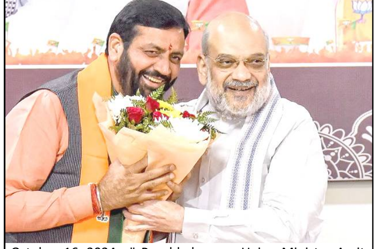
October 16, 2024 nü Panchkula nung Union Minister Amit Shah-i Nayab Singh Saini nem tenüngsang agütsüdang tangokba noksa nung angur. Bodhbarnü Nayab Singh Haryana nung BJP legislature party lenir shimogo.

aviation ministry-i ozüng benokba agencies den jembidar. Intelligence agencies nungi osangtem anguba sülen tayimtsütem nung air marshals tali lemzüktsütsü atema-a jembishinüdar. Tesüiba anogo asem tsüngda linük telung nung senzüba aser bendanglen tashi senzüba India nung tayimtsü 10 dak tema bomb amshia amaktsü ta osang metetdakja liasü. Bodhbarnü kija nunga tayimtsü ana- Akasa Air aser IndiGo indang tayimtsü kaka bomb amshia amaktsü amokmerena liasü, ajisüaka tesülen itemji taila call liasü ta jangja. Taila amokmerenertem maitsü jangjaba sülen aputsü atema Bureau of Civil Aviation Security-i cybersecurity agencies aser police den senteper inyakdar.