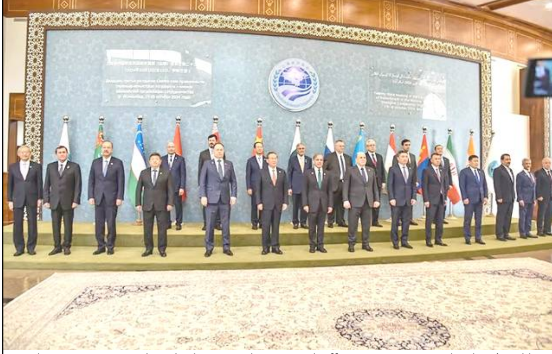
October 16, 2024 nü Islamabad nung India External Affairs Minister, S Jaishankar (tejaklen ajichilen nungi tanabuba) den SCO linüktem nungi tekolakpurtem 23buba SCO senden nung tangokba noksa nung angur.

ngudaktsütsüsa kanga meranga inyakogo. Ni Dharmendra Pradhan aser tangartem dang pelar," ta metetdaksü. Brihostibar anepdang 10:00 ako nung Panchkula nung aliba Dusshera grounds nung tenangzükba sentong agütsü aser iba sentong nungji Ato kilonser Narendra Modi densema party nung tongti lenir aika adentsü.