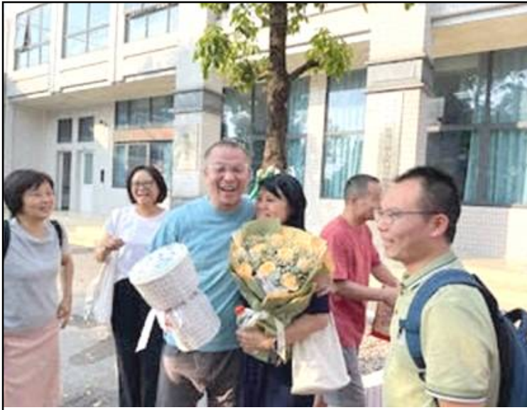
Arogo lenir, Zhu Longfei jail nungi aludang kinüngtsüi pa agizükba noksa nung angur.

October 16, 2024: China nung Laishiba menüngba atema 2023 küm August ita nung sorkar ketdangsertemi Arogo lenir ka pua jail nung puoka liasü, ajisüika tawa pa bail nung chiokogo.