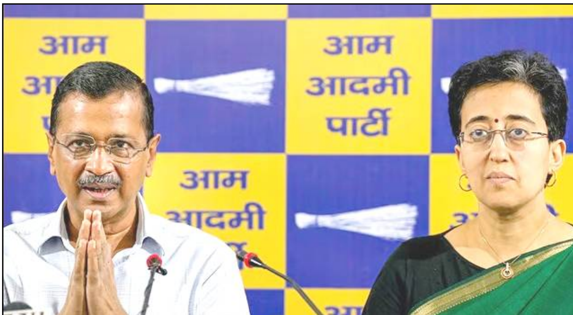
October 18, 2024 nü New Delhi nung Delhi Chief Minister, Atishi aser taoba mapang Chief Minister, Arvind Kejriwal nati osangbenertem den jembidang tangokba noksa nung angur.

Tanüingba departments ji nüngdak apir tangar minister tem nem lezmüktsütsü.