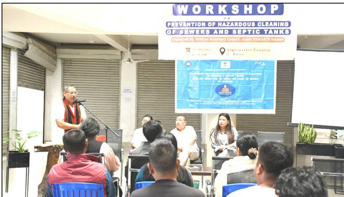
NAMASTE Scheme kübok Super Market Complex, Kohima nung October 18, 2024 nü Prevention of Hazardous Cleaning of Sewers and Septic Tanks indang workshop ka ayongzükba noksa nung angur.

Dimapur, Mongputeni/Oct. 18 (TYO): Kohima Municipal Council (KMC) ajanga NAMASTE Scheme kübok Prevention of Hazardous Cleaning of Sewers and Septic Tanks indang workshop ka October 18, 2024 nü Super Market Complex, Kohima nung ayongzükba liasü.