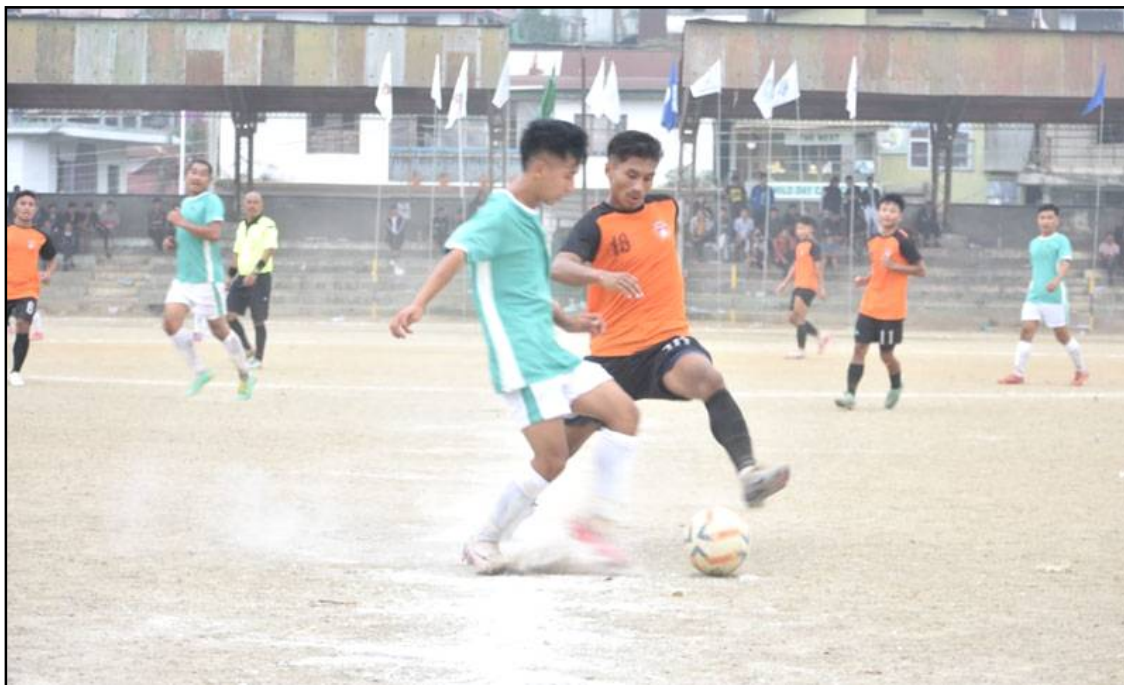
MDFA Trophy 2024 tasemnübuba tanabuba asaya Eastern Wings aser Legendary Yeomanly Misfits tsüingda asayaba mapang tangokba noksa.

Mokokchung, October/Mongputeni 18(TYO): Tasemnübuba MDFA Trophy mezüingbuba asaya Super Seniors FC aser Zonipang SC tsüingda asayaba nung asaya tenzüker minute 45 buba tashi nung telok katia goal magütsüteti anisüingzükbapang agi.