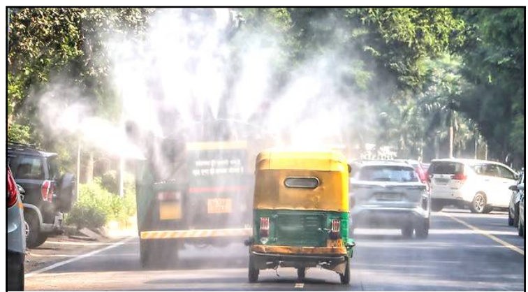
October 18, 2024 nü New Delhi nung mopung menenba nokdangtsü atema gari nungi tzü akahdang tangokba noksa nung angur.

November 13 nü election agitsü aser nüngdak dang süra assembly constituency tenetprongla nungji anepdang 7:00 ako nung nikongdang 6:00 ako tashi vote agütsütsü aser November 23 nü votes zünga election agiba osang sangdongtsü.