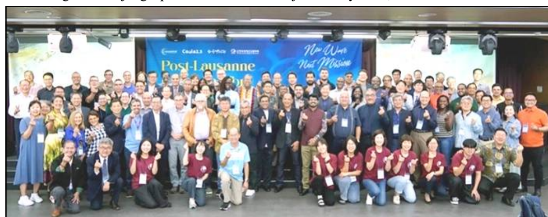
Tawa South Korea kübok Busan nung COALA 2.5 senden nung adener Global South mission lenirtem tangokba noksa nung angur.

"Laishiba nung pei teinyaktsü shilem ka ama nüburtem dang vote agütsütsü ajungshiba agi dangbo kecha masütsü, ajisüaka vote agütsütsü tongmelang agi ajungshiba ajanga Tenla kidangi teti aoer nisung million 5 shi ibo vote agütsütsü," ta pai ashi.