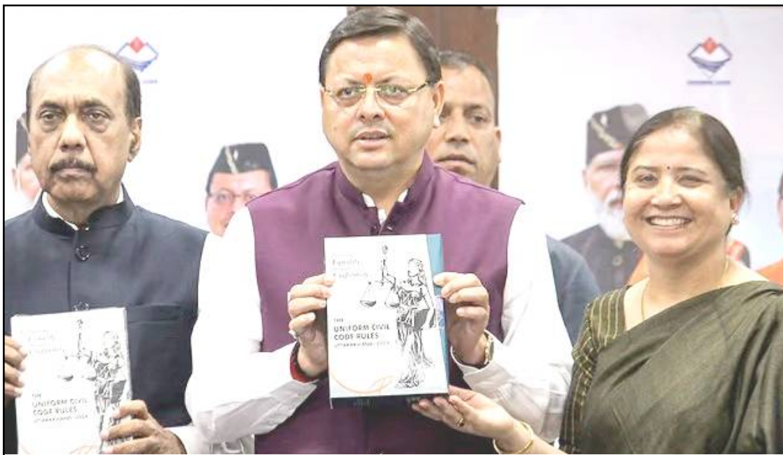
October 18, 2024 nü Dehradun nung Uttarakhand Chief Minister, Pushkar Singh Dhami-i Uniform Civil Code (UCC) renemtsü asoshi shimba committee ket nungi report agizükdang tangokba noksa nung angur.