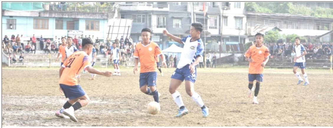
MDFA Trophy 2024 pezünübuba Sports Society Soyim aser Zonipang SC tsungda asayaba mapang tangokba noksa.

Mokokchung, October/Mongputeni 19(TYO): MDFA Trophy pezünübuba asaya 3 tashi asaya-a liasü.