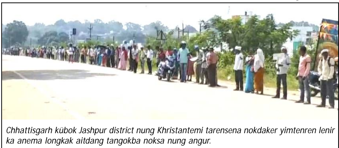
Chhattisgarh kübok Jashpur district nung Khristantemi tarensena nokdaker yimtenren lenir ka anema longkak aitdang tangokba noksa nung angur.