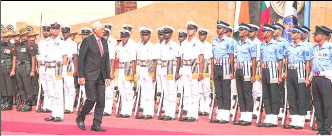
Singapore Defense Minister Ng Eng Hen-i New Delhi nung 6buba India-Singapore Defence Ministers Dialogue metenzük tsüingda Guard of Honour asadangba noksa nung angur.