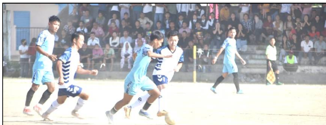
MDFA Trophy 2024 mezüngbuba quarter finals Team Gilgal aser Zonipang S.A tsüngda asayadang tangokba noksa.