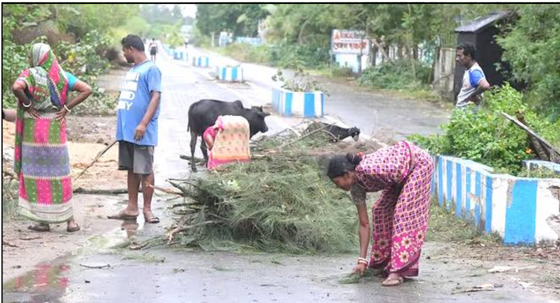
October 25, 2024 anepdang Cyclone ‘Dana’ süiba sülen West Bengal kübok Purba Medinipur district nung nisung kari lenmang merüktetba noksa nung angur.

“October 25 nü Odisha tzüyimkümlen aser south Gangetic West Bengal (east & west Medinipur) nung tzünglu sashia arutsü,” ta IMD-isa metetdakja liasü.