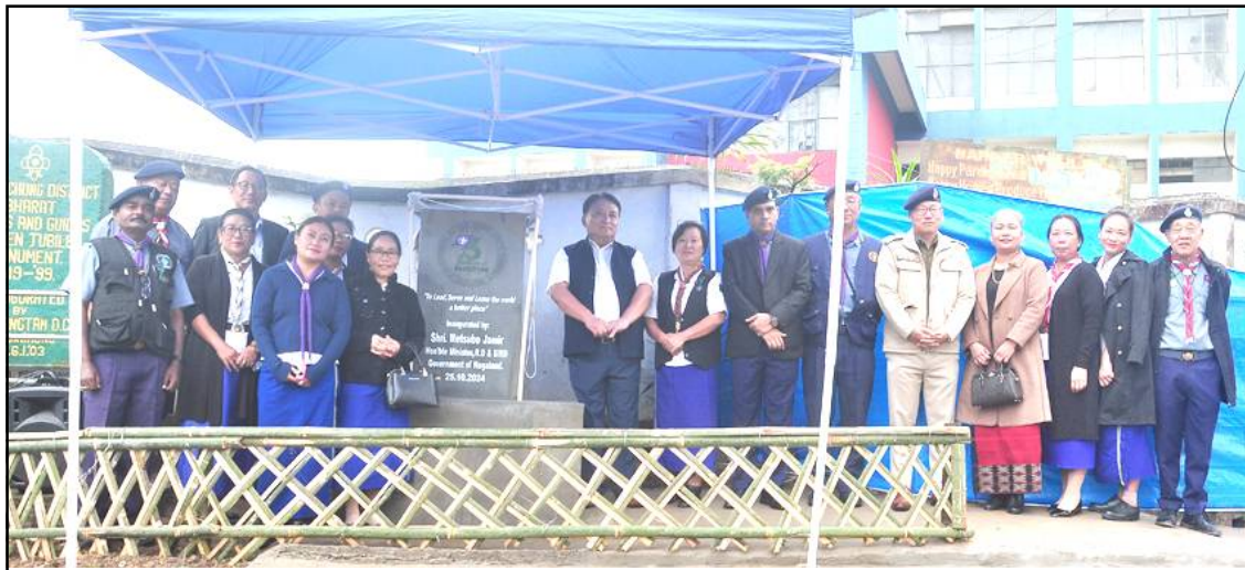
Minister, R.D & SIRD, Metsubo Jamir-i Mokokchung District Bharat Scouts & Guides pur jubilee nüngtem yangluba nüngshilung lapoktsüdang tangokba noksa nung angur. Mokokchung, 25th Oct. 2024.

Mokokchung, Mongputeni/ Oct. 25 (TYO): Mokokchung District Bharat Scouts & Guides (MDBSG) tenzüker küm 75 ajungba jubilee sentong ka October 25, 2024 nü yangi P. Shilu Ao Memorial Park, Mokokchung nung meraketa mungogo.