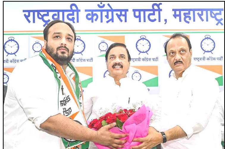
October 25, 2024 nü Mumbai nung Maharashtra Deputy Chief Minister aser NCP (Ajit) tongti, Ajit Pawar-i Zeeshan Siddique party nung agizükdang tangokba noksa nung angur. Maharashtra assembly election nung Siddique-i Bandra East constituency nungi tokteptsü.

LG-isa security sepaitem dang parnok tsungda amalitepa inyaksü aser kiralongrartem infrastructure raksatsütsü nükjidong nung inyaksü metetdakja liasü.