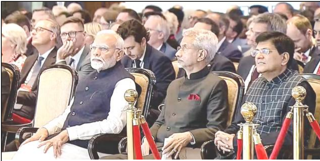
October 25, 2024 nü New Delhi nung Asia-Pacific Conference of German Business 2024 tetenzük sentong nung Ato kilonser, Narendra Modi, External Affairs Minister S Jaishankar aser Union Minister Piyush Goyal nung adenba noksa nung angur.