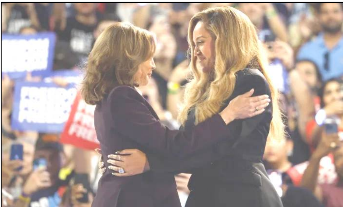
Houston nung tir election atema nüboyimba sentong ayongzüka agiba mapang nungtugu kentener Beyonce (tachichi) aser Democratic nominee Vice President Kamala Harris na tangokba noksa nung angur. Iba rally nung Beyonce-i Harris pusema jembia liasü.