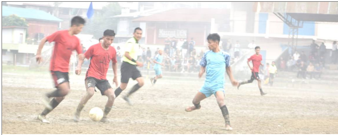
MDFA Trophy 1st Semi Finals Team Gilgal aser K.S.U.M tsungda asayadang tangokba noksa.