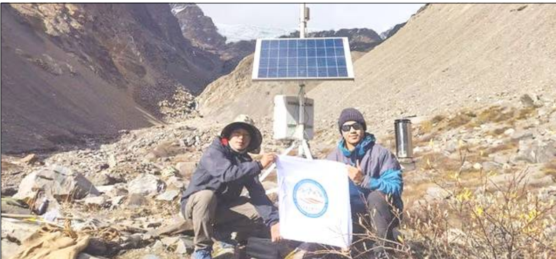
October 26, 2024 nü Centre for Earth Sciences & Himalayan Studies aser National Centre for Polar & Ocean Research nati Khangri Glacier nung Automatic Weather Station ka aser Automatic Water Recorder ka amenokba noksa nung angur.

Ano külen tanga osang ka nung, Honibarnü Siliguri kübok Baikunthapur nung aliba BSF Assistant Training Center nung BSF nung tetsür constable 385-i linük tenzüksü atema tenangzükbä agiogo. BSF North Bengal Frontier IG, Suryakant Sharma-i ketdangtsüa parnok nem tenangzükbä agidaksü. Iba sentong nungji BSF ketdangsertem aser parnok kibong züngsemtem aden.