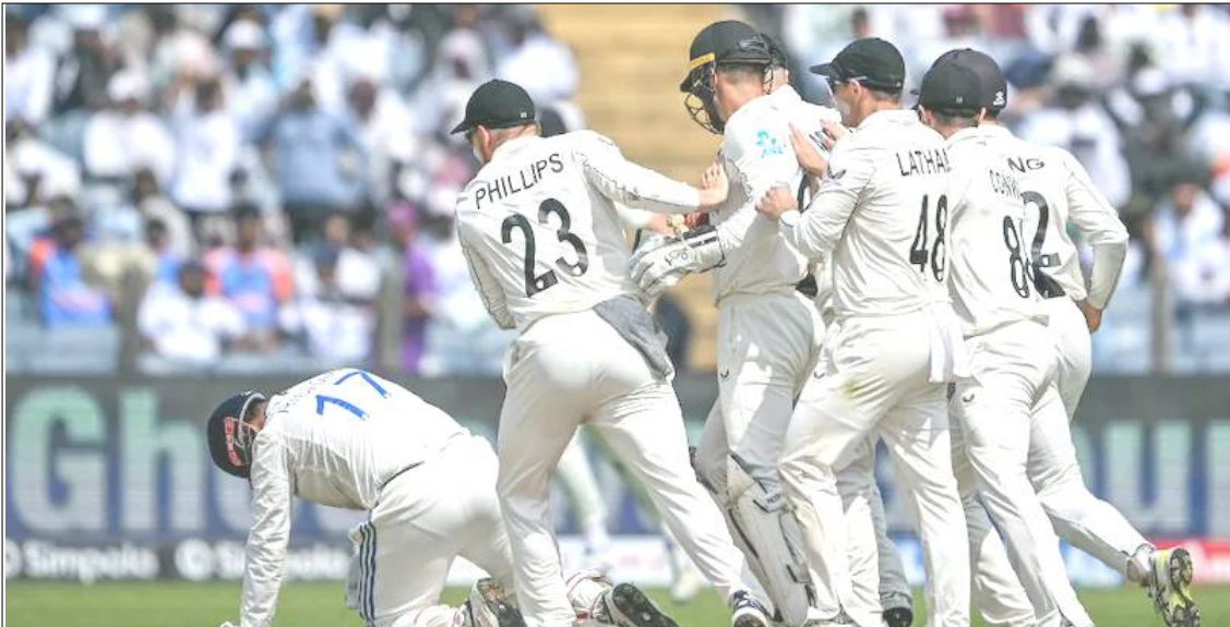
New Zealand aser India na tanabuba test asayaba noksa angur. New Zealand-i run 113 agi India akok.

Mongputeni/October 26, 2024 (Agencies): New Zealand aser India na tanabuba test asaya New Zealand-i run 113 agi koka India team Kidang küm 12 tashi Test asayamung ka nung danga tamakok mongui asaya arua aliba tembangtsüogo.