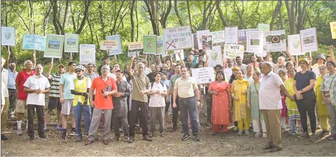
October 26, 2024 nü Pune nung alima tzü-mopung wazüka ayutsü pusemertemi 'Vetal Tekadi' tenem wazüka ayutsü atema takhangba agüja longkak aitdang tangokba noksa nung angur.