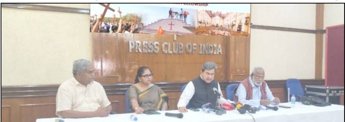
October 24, 2024 nü New Delhi nung Delhi NCR Christian Fellowship nungi lenirtemi osangbenertem den jembidang tangokba noksa nung angur.

October 26, 2024: India tesem ajaklen Khristantem anema inyakba kanga bulua atalokba anema Honibarnü (October 26, 2024) Jantar Mantar, New Delhi nung Khristantemi longkak aitogo.