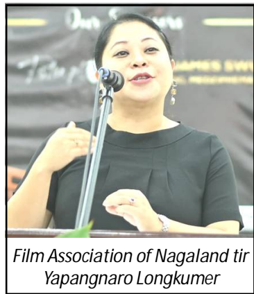
Film Association of Nagaland tir Yapangnaro Longkumer

Dimapur, Mongputeni/Oct. 28 (TYO): Department of Mass Communication, Patkai Christian College ajanga 4 buba 3-Day Campus Film Festival 4.0, 2024 tenzükba sentong October 28, 2024 nü Bundrock Auditorium, PCC nung ayongzüka liasü. 3-Day Campus Film festival ya Mahindra Apex Motors Nagaland aser Hunky Dory teyaritep nung Film Association of Nagaland ya Associate partner aser Nationale Institute for Civil Services Examination aser The Morung Express ya media partner ama ayongzük. Iba sentong nung tesayurtem, kaketshirtem, alakteta jaoker aser tetushi tesemdanger tem dena liasü.