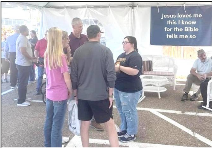
Jackson, Mississippi nung Mississippi State Fair nung Mississippi Baptist Convention Board züngsemtem aser volunteers tangokba noksa nung angur.

October 28, 2024: Tan ita Jackson, Mississippi nung Mississippi State Fair nung Mississippi Baptist Convention Board-i Fair nung adener meyrjang aika den Khrista osangtajung lemsatep, aser parnok 373-i Khrista nem taküm bendanga agütsüogo.