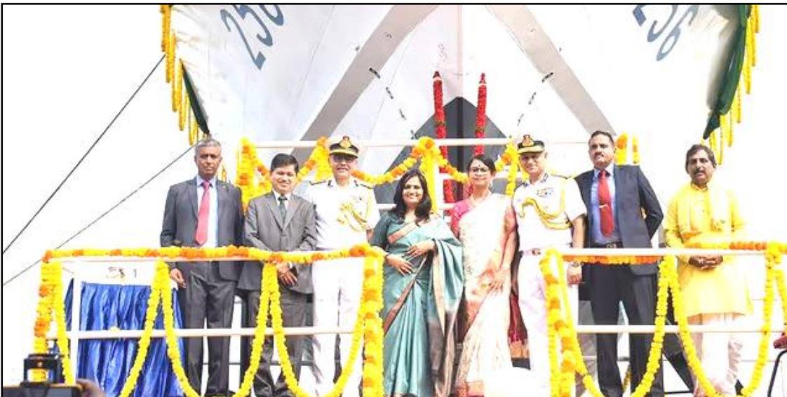
Panaji, October 28, 2024: Linük nung yangluba Fast Patrol Vessels ana (rong)- Adamyas aser Akshar semzükba sentong nung Indian Coast Guard nung DG, Sivamani Paramesh aser pa kinüngtsü Priya Paramesh na den tangartem tangokba noksa nung angur.

AQI 0 nungi 50 ji 'tajung', 51 nungi 100-a 'tajung', 101 s a d e m s a d e m a nungi 200 ji 'tera tajung', 201 nungi 300 ji 'majung', 301 nungi 400 ji 'kanga majung' aser 401 nungi 500 ji 'kanga majung' ta züingshir.