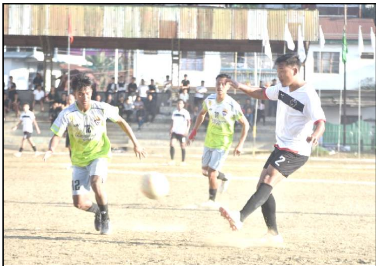
MDFA Trophy 2024 tanabuba Semi Finals Telongjem F.C aser Super Seniors F.C na asayaba mapang tangokba noksa nung angur.

Mokokchung, October/Mongputeni 28 (TYO): MDFA Trophy 2024 tanabuba Semi Finals Imkongmeren Sports Complex nung tanü nikonngang 1:00 Pm nungi tenzüka Super Seniors F.C aser