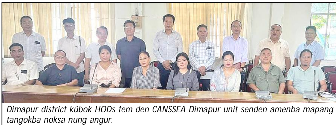
Dimapur district kübok HODs tem den CANSSEA Dimapur unit senden amenba mapang tangokba noksa nung angur.