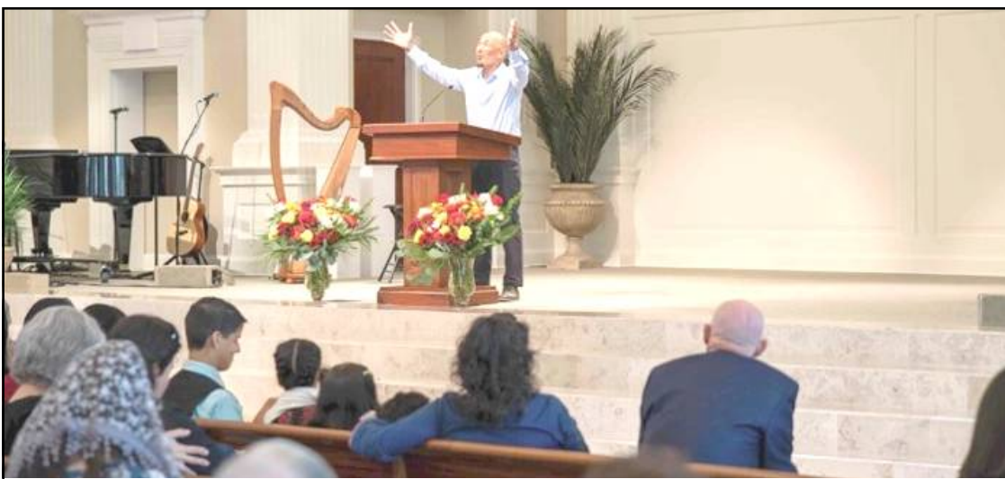
Gospel for Asia tentetsang, KP Yohannan bilemtetba sentong nung kaketzülur aser taoba mapang pastor, Francis Chan-i sarasademang tangokba noksa nung angur.