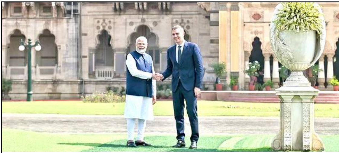
October 28, 2024 nü Gujarat kübok Vadodara yimti nung Ato kilonser Narendra Modi aser Spain Ato kilonser, Pedro Sanchez na senden amentsü lia tangokba noksa nung angur.

Vadodara, Mongputeni/ October 28 (Agencies): Hombarnü Ato kilonser Narendra Modi-i, tang Spain Ato kilonser Pedro Sanchez-i India linük semdangba ajanga linük ana tsüingda tesendakatep tashi itshidaktsür, ta metetdaktsü.