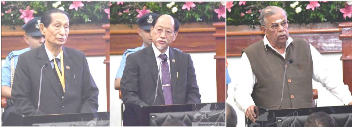
Taoba Chief Minister & Governor Dr. SC Jamir, Chief Minister Neiphiu Rio aser Governor, L Ganesan nungeri Nagaland Legislative Assembly 60 buba benjungmong nung o jembiba angur.

"Naga nunger tamangba yimsü dak sendakba inyaksangshi, sobaliba aser ali kümzüka ayutsü atema Centre-i Constitution nung Arrla 371A enoksem. Iba ya tangari ashiba ajanga masü saka Naga People's Convention-i shimtetba trustee committee ka ajanga Constitution