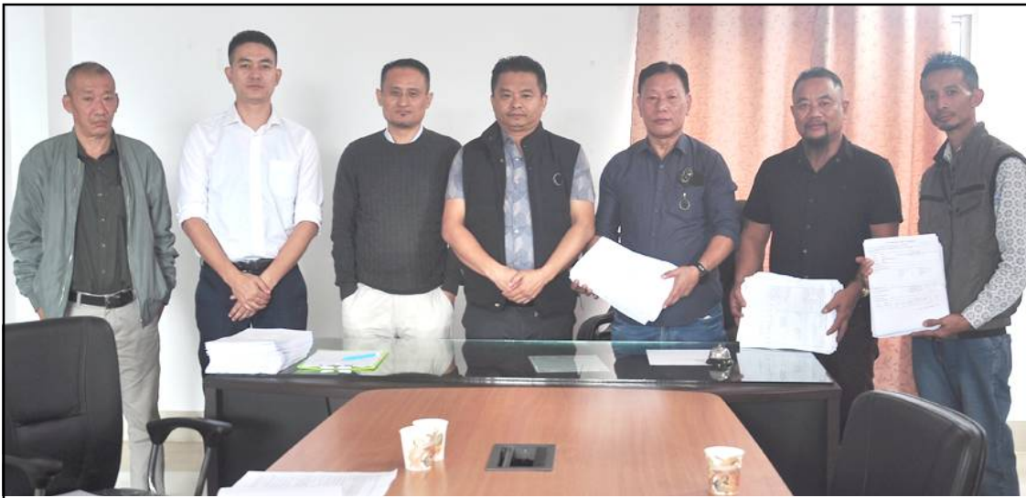
Deputy Commissioner, Mokokchung indang Conference Room nung October 29, 2024 nü senden amendang tangokba noksa ka nung DC & DEO Mokokchung, Thsuvisie Phojo den sorkar ketdangsür aser political party tem nungi teshimtet nisungtem angur.

Dimapur, Mongputeni/Oct. 29 (TYO): Mokokchung district atema Draft Electoral Rolls nung temelenshitsu lira October 29, 2024 nungi November 28, 2024 tashinung inyaktetsü, ta Deputy Commissioner & District Election Officer (DC & DEO), Mokokchung ajanga October 29, 2024 nü senden ka nung metetdaksü.