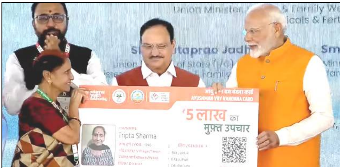
Ato kilonser Narendra Modi aser Health Minister JP Nadda nati New Delhi nung All India Institute of Ayurveda nung beneficiary ka felicitate asüba noksa nung angur.

“Acetone, Sodium Hydroxide, Methylene Chloride, Premium grade Ethanol, Toluene, Red phosphorous, Ethyl Acetate amala chemical tem aser temesepba mozü yanglutsü atema bendanglen nungi bener aruba machinery tem ngutetogo. Delhi Police special cell-ia iba meita aoba sentong nung shilem agia liasü,” ta paisa shisem.