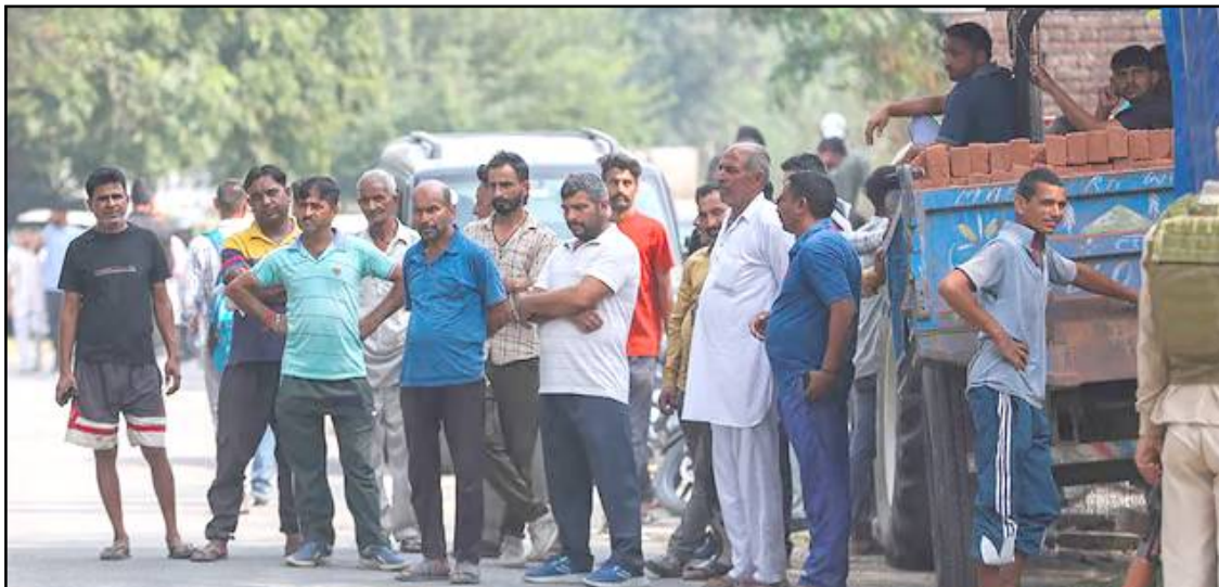
Jammu and Kashmir kübok Akhnoor sector nung security force aser kiralongrar na tananübuba khatepba tesem anasa alirtem adenshia aliba noksa nung angur.

New Delhi, Mongputeni/October 29 (Agencies): Jammu and Kashmir kübok Akhnoor tesem nung kiralongrartem maneni meita aoba mapang Mongolbarnü anepdang security force temi kiralongrar ana tepsetogo.