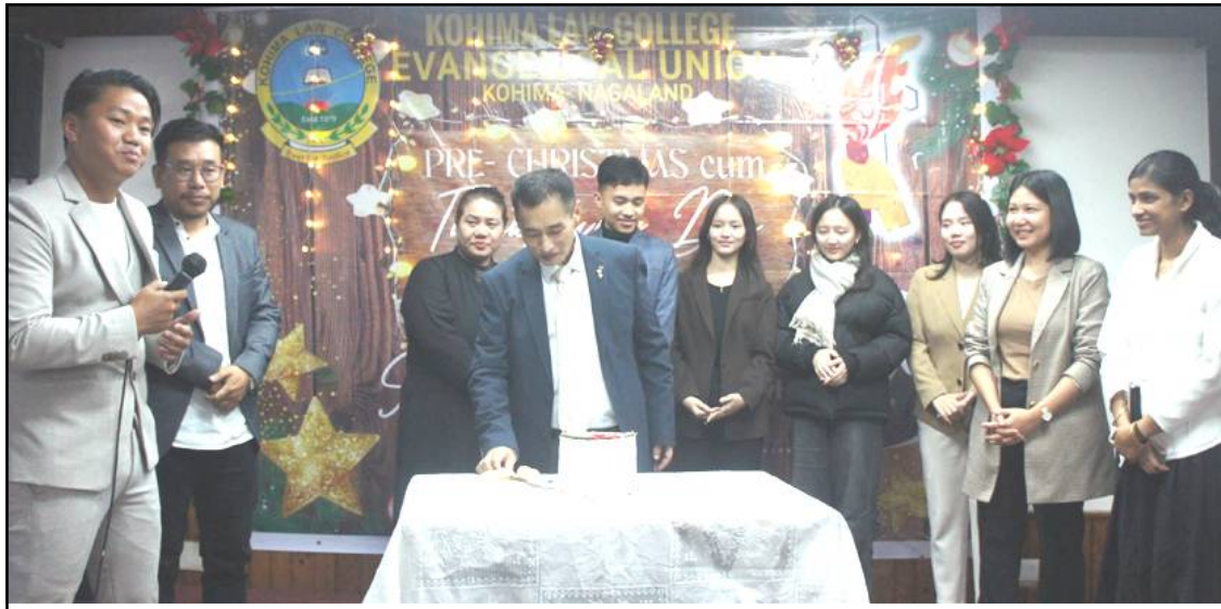
Kohima Law College pur November 1, 2024 nü Red Cross Conference Hall, Kohima nung Pre-Christmas sentong agidang Kezhokhoto Savi den kinungtsü, chirnur, professors aser ketdangsür temi cake alemba noksa nung angur.

Dimapur, Yimpoksüi/Nov. 03 (TYO): Kohima Law College pur Pre-Christmas sentong Red Cross Conference Hall, Kohima nung November 1, 2024 nü agia liasü, kong Kezhokhoto Savi o jembir liasü.