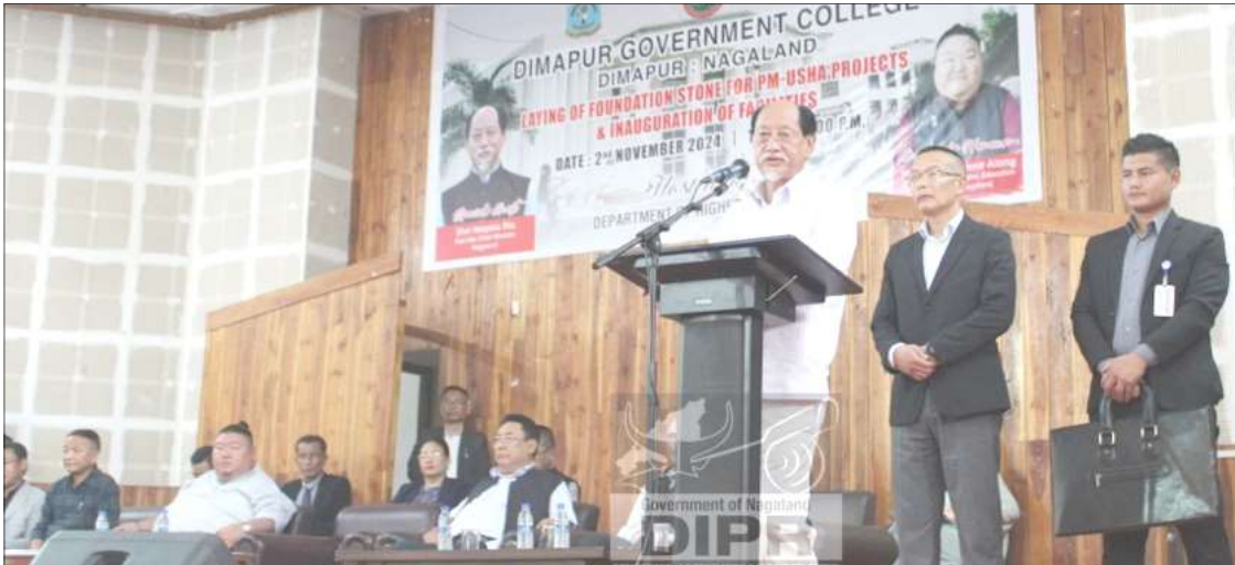
November 3, 2024 nü Dimapur Government College (DGC) nung PM-USHA tenzükba sentong nung CM Neiphu Rio-i o jembiba angur.

"Yimyatsüya melii kaketshir shisatsü dang anguba nung lendong keta lir anungji tesayurtemi kaketshirtem dang yimyatsüya sayutsüla. Yamaji asü nung dang parnok züngtemba sülen tagitsü aketba nisung kaka akümtsü. Kümshia DGC nung kaketshirtemi admission asütsü raktepba ajanga principal aser