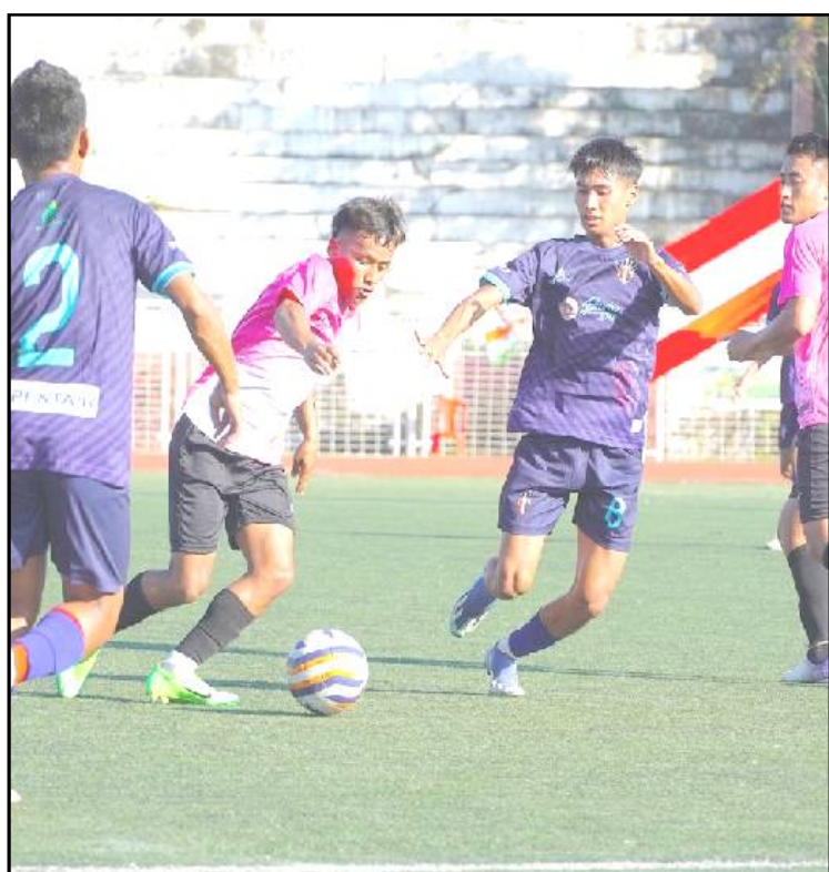
Tang Kohima nung asaya aliba 8buba Capt N Kenguruse, MVC Memorial Football Tournament nung nung Hombarnü asayatem asayaba mapang tangokba noksa nung angur.

Kohima, Yimpoksüi/November 4 (TYO): Tang asaya aliba 8buba Capt N Kenguruse, MVC Memorial Football Tournament nung Hombarnü Western Sumi Sports Association Niuland aser Dynamo FC Dimapur nati pei