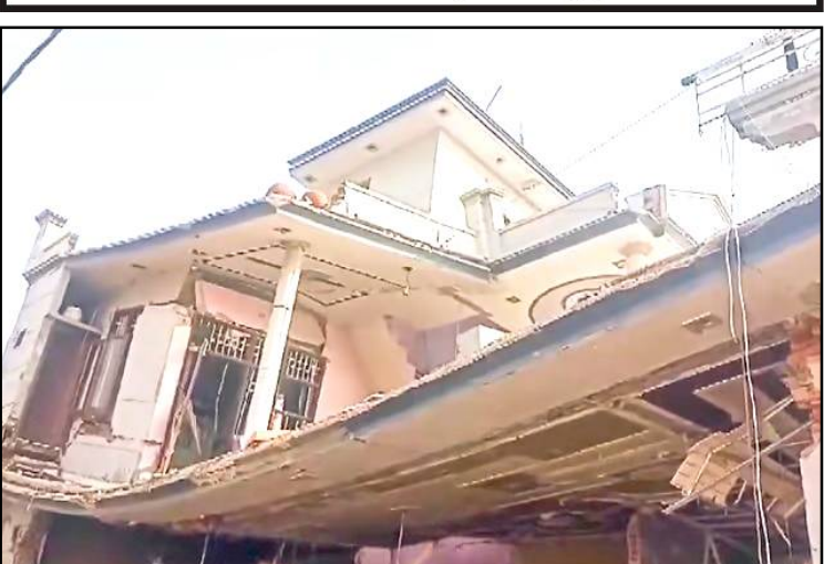
November 04, 2024 nū Haryana state kübok Kaithal nung gas cylinder ana apokba ajanga ki ka kanga mejungi raksar aliba noksa nung angur. Iba lendong nung tetsür ana asü aser nisung ana yiru.

Salary for the above posts is negotiable. Send resumes to - careernagaland@gmail.com