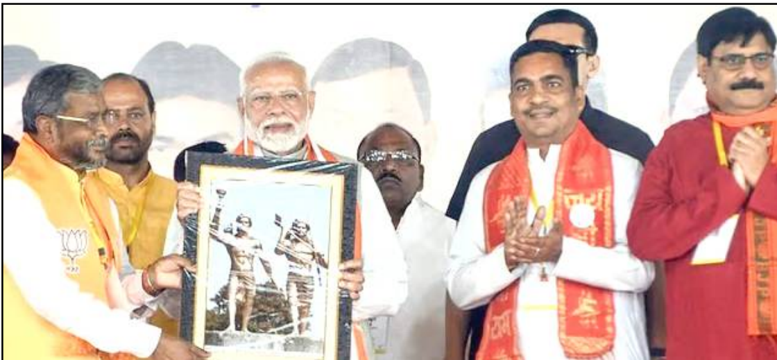
November 04, 2024 nū Garhwa district nung Jharkhand Assembly election atema nüboyim sentong ka nung Ato kilonser, Narendra Modi adenba noksa nung angur.

Party balalai mepishiba nung ajemdaker Kerala nung assembly menden ka, Punjab nung pezü aser Uttar Pradesh nung menden 9 atema election ji joko November 20 nū ang agitsü. Ajisüaka vote azüngtsü anogobo (November 23) memelenshir.