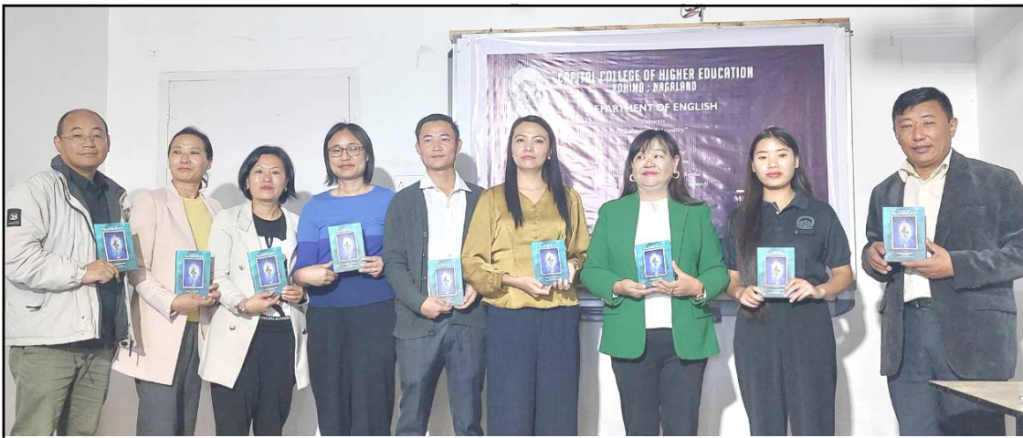
Capital College of Higher Education, Kohima nung Kurhungolu Ritse ajanga sangro bendena züluba "Tempest of Tranquility" kaket Hombarnü sayadang tangokba noksa nung angur.

Kohima, Yimpoksüi/Nov. 04 (TYO): Capitol College of Higher Education (CCHE), Kohima nung Department of English nung 3rd semester azünger Kurhungolu Ritse ajanga sangro bendena "Tempest of Tranquility" kaket Hombarnü Suohienuo Keyho, Principal of the Extension Training Centre (ETC), Phek, SIRD Nagaland ajanga college nung sentong ka agidang sayatsüogo.