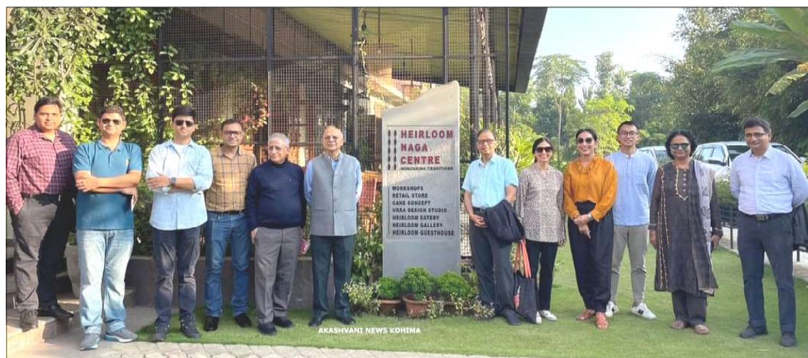
November 4, 2024 nü 16th Finance Commission nung Chairman Arivind Panagariya-i anir teshimtet telok ka Dimapur tonga aruba sülen Sovima nung Heirloom Naga Centre semdangdang agiba noksa ka angur.

Kohima, November 4, 2024 (TYO): 16th Finance Commission nungi züngsem pezü agi akümba telok ka tanü Nagaland semdangi arua lir aser parnok anogo asemnü mongzüktsü.