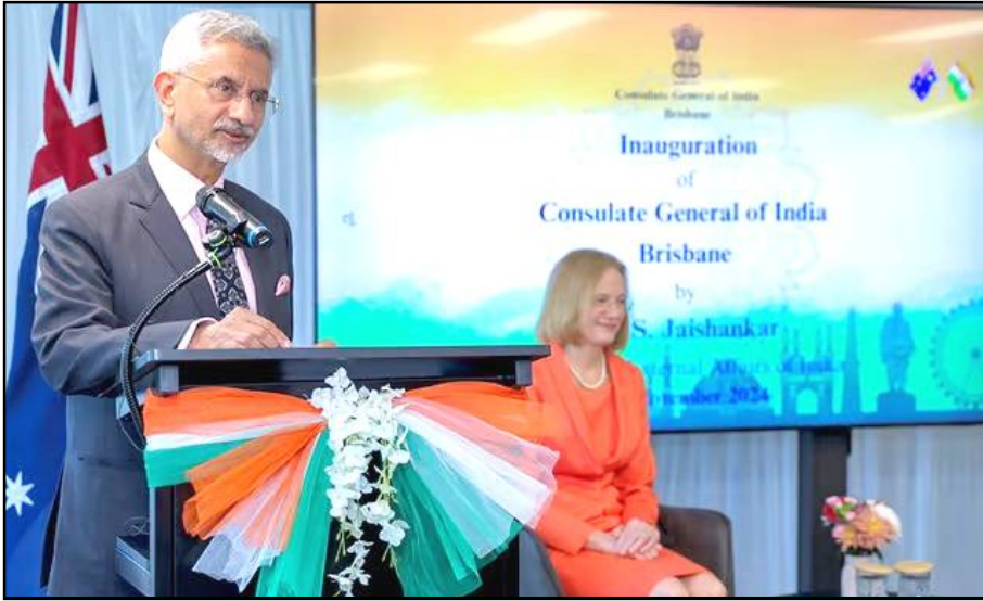
November 04, 2024 nū Australia kübok Brisbane yimti nung India External Affairs Minister, S Jaishankar-i Consulate General of India semzüksü dang tangokba noksa nung angur.