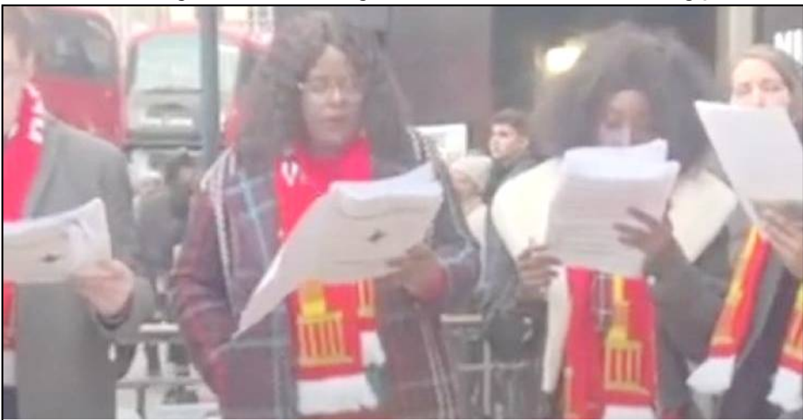
Yaküm December ita nung UK nung 'Shine Your Light' campaign kübok bus station ka nung carol agidang tangokba noksa nung angur.

November 23, 2024: UK nung Arogo 1000 dak temai lintük tesem ajaklen Tenla kitem ajanga moapu balala nung Khristams tepela osang proktsü atema campaign ka tenzükogo. Khristan denomination balala, prayer networks & streams aika 'Shine Your Light' campaign kübok longjemogo. Parnoki Khristan 100,000 shi ayongsemer nisung million 1 den Khrista osangtajung lemsateptsü. Carols densema Khristmas dak sendakba sentong balala