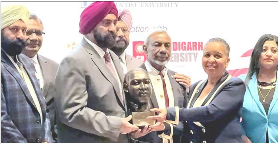
November 23, 2024 nü Washington D.C nung Indian-American lenirtem Global Equity Alliance Summit nung adendang tangokba noksa nung angur.