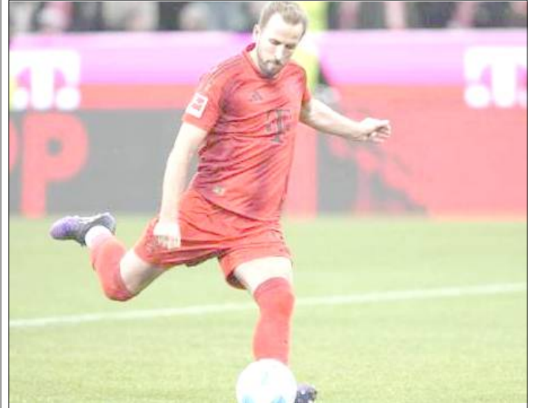
Bayern Munich aser Augsburg na Allianz Arena Munich, Germany nung asayaba mapang Bayern nungi asayar Harry Kane-i penalty ka metsüa par team atema goal ka idaktsüba noksa nung angur.

Yimpoksuü/November 23, 2024 (Agencies): Harry Kane-i otsüsütsüsa Bundesliga nung asayatem ajak rongnung goal 50 takaratiba idaktsüogo. Pai asaya 43 nung dang iba alizung tongteta liasü.