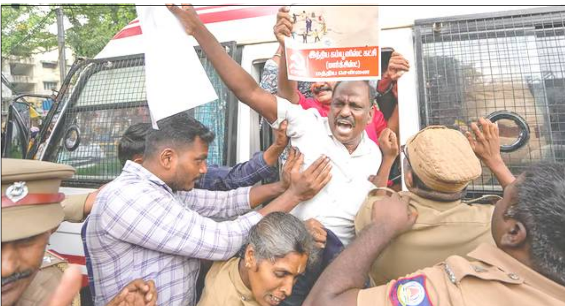
November 23, 2024 nü Chennai nung Communist Party of India (Marxist) züngsemtemi Ato kilonser Narendra Modi aser businessman Gautam Adani na anema longkak aيتدang police-i parnok apuba noksa nung angur.

Priyanka-i nüboyimba mapang nung nüburtem den kanga junga sendaktepteta liasü ta aikati bilemer. La ya Congress nung kanga tongtibang lenir ka ta ajaki agizüktetba ajanga aikati la nem vote agütsü ta bilemer.