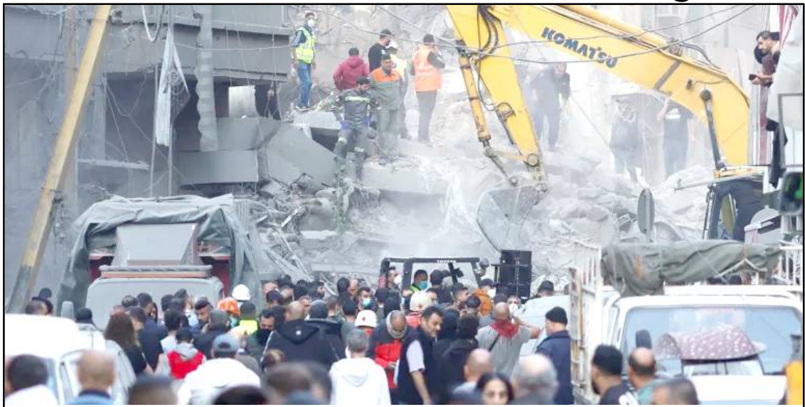
Volunteers aser tekümkertemi Beirut kübok Basta tesem nung Israel-i missile agi raksatsüba ki ka nung taküm alirtem kümzüksü merangba noksa nung angur.

Beirut, Yimpoksüi/ November 23 (Agencies): Israel-i yokba missile pongu agi Beirut teyong nung nisung aika aliba tesem ka nung nisung aliba ki ka raksatsüogo.