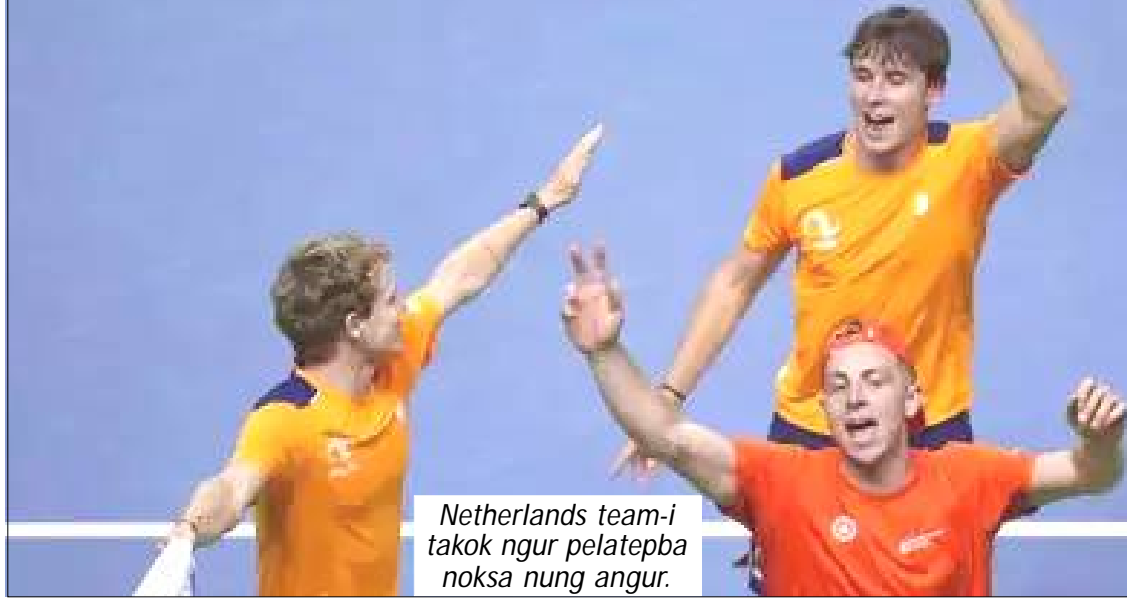
Netherlands team-i takok ngur pelatepba noksa nung angur.

Yimpoksuü/November 23, 2024 (Agencies): Tang asaya aliba Davis Cup nung Hokolbarnü Germany team 2-0 agi akokba sülen Netherlands team tang mezungbuba Davis Cup final-i iogo.