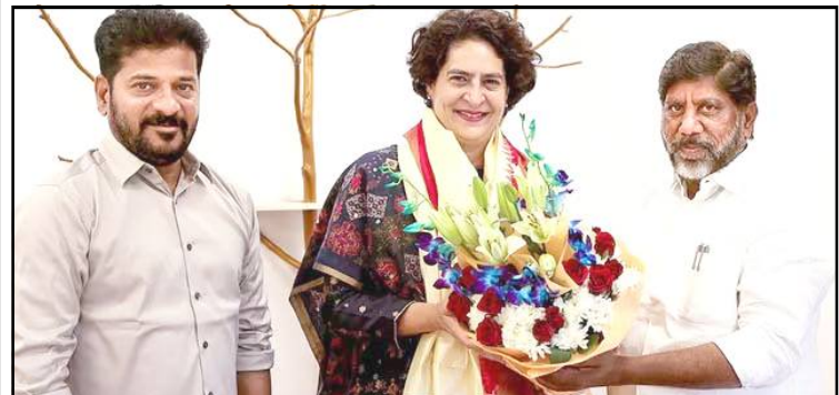
Wayanad Lok Sabha menden bypoll akokba sülen Telangana Chief Minister A Revanth Reddy aser Deputy Chief Minister Mallu Bhatti Vikramarka na Congress lenir Priyanka Gandhi Vadra den senden amemba mapang tangokba noksa nung angur.

November 27 nungi 29 tashi Chennai nung tzünglu kanga arutsü ta ‘yellow alert’ metedaktsüogo. Külen, Kancheepuram, Tiruvallur, aser Chengalpattu district tem nung yellow aser orange alerts sangoktsüogo.