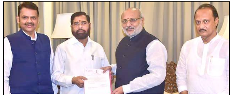
Maharashtra Angh C.P. Radhakrishnan-i, chief minister ama Shiv Sena lenir Eknath Shinde indang resignation agizükba noksa nung angur. BJP lenir Devendra Fadnavis aser NCP lenir Ajit Pawar nata noksa nung angur. Angh-i, CM tasenba meshim tashi caretaker chief minister ama inyaktsü Shinde dang asüngdangogo.