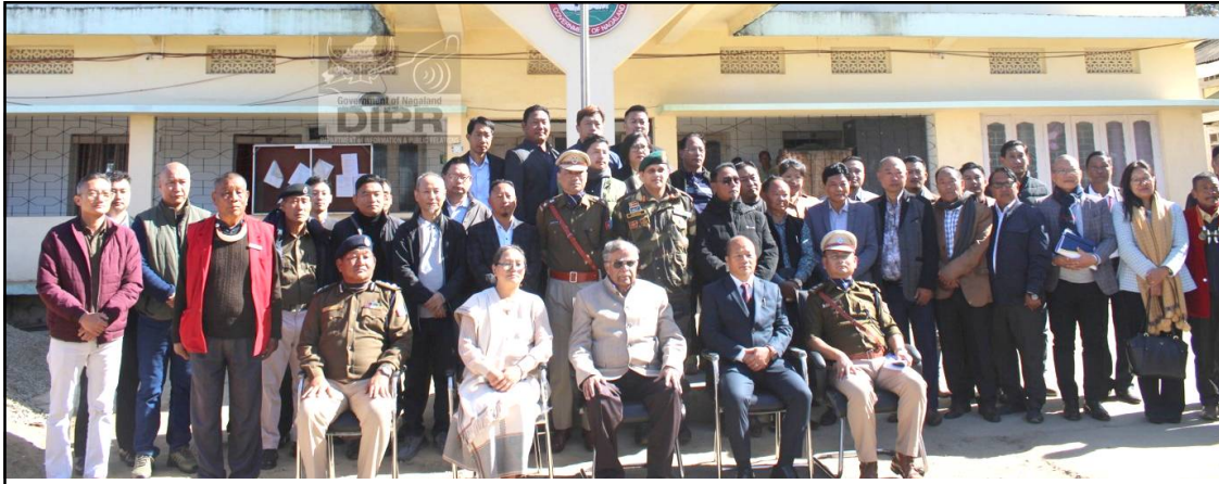
Nagaland Angh La Ganesan-i, November 26 nü Tuensang District semdangba mapang tangokba noksa nung angur.

Dimapur, Yimpoksüi/ November 26 (TYO): Nagaland Angh La Ganesan-i, November 26 nü Tuensang District semdang Department tekolaktem aser lokti tentet balala den DC Conference Hall, Tuensang nung senden ka menogo.