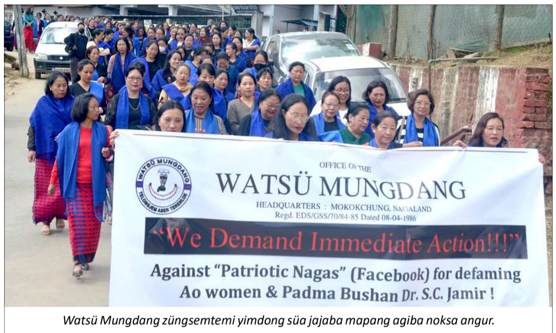
Watsü Mungdang züngsemtemi yimdong süa jajaba mapang agiba noksa angur.