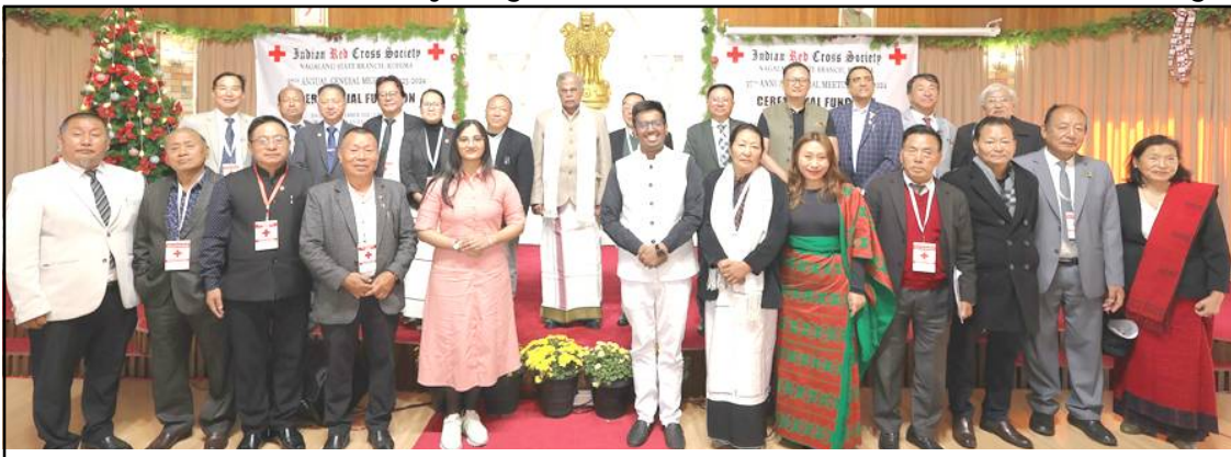
Indian Red Cross Society Nagaland State Branch inti senden nung tangokba noksa angur.

Dimapur, Yimpoksüi/ November 27 (TYO): 37buba Indian Red Cross Society Nagaland State Branch Annual General Meeting, ceremonial function Dr. Imkongliba Ao Hall, Raj Bhavan nung November 27 nü agiogo.