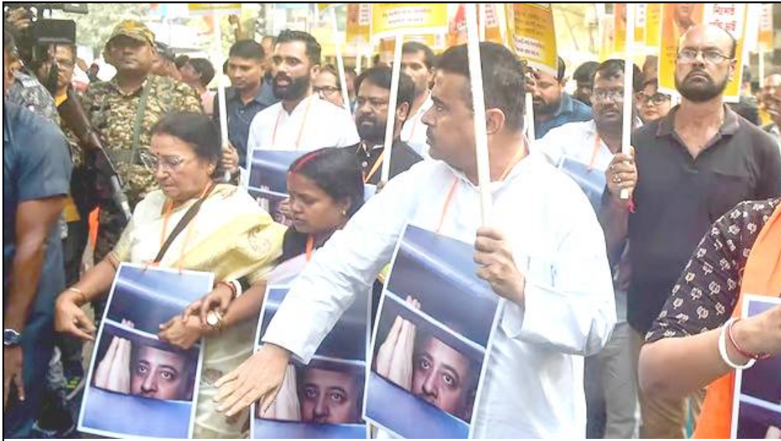
Bangladesh nung Hindu nung lenir, Chinmoy Krishna Das Brahmachari apuba anema November 27, 2024 nü Kolkata nung BJP lenir Suvendu Adhikari den tanga party balala nungi lenirtemi Kolkata nung aliba Bangladesh Deputy High Commission kima longkak aitba noksa nung angur.