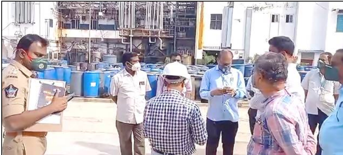
November 27, 2024 nü Visakhapatnam nung aliba Tagore Pharma Laboratories nung miim mozü tamajung ajanga nisung ka asüba aser aika temang nung timtem adoka hospital-i anir aoba sülen police-i iba tesem nung bushisüngdangba noksa nung angur.