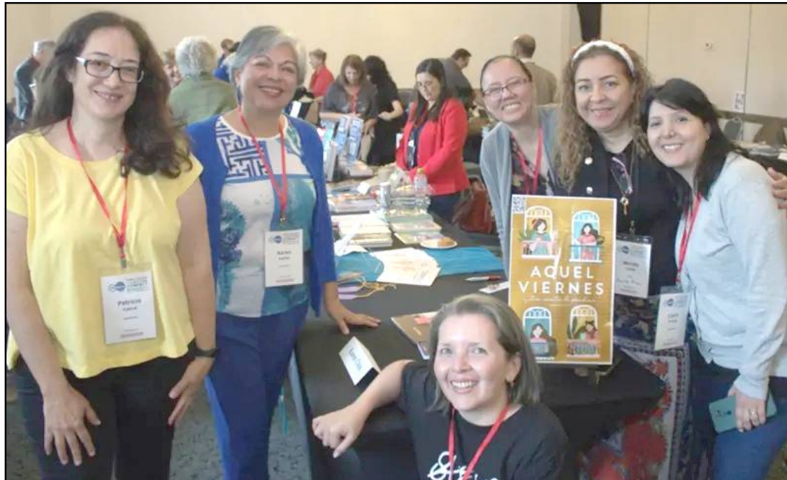
LittWorld 2024 Conference nung tangokba noksa nung angur.

November 29, 2024: LittWorld 2024 ya küm asem shia khen ayongzükba agir aser taküm-a Media Associates International (MAI)-i iba sentong ayongzükba November ita tetenzüklen Puebla, Mexico nung agiogo.