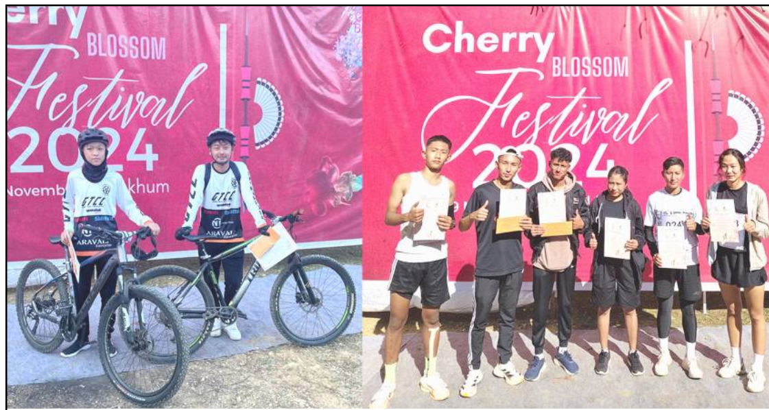
Longkhum yimtak Yimpir Küjajen tesem nung kümnabuba Cherry Blossom Festival anogo asemnuba amongdang 1st Cherry Blossom Marathon Race aser 1st Mongponaro Mini Endurance Cycling tetoktepbatem nung takok angurtem tangokba noksa.

Longkhum, November/Yimpoksüi 29 (TYO): Longkhum yimtak Yimpir Küjajen tesem nung kümnabuba Cherry Blossom Festival anogo asemnü November 27 nü nungi tenzüka tanü tembangogo.