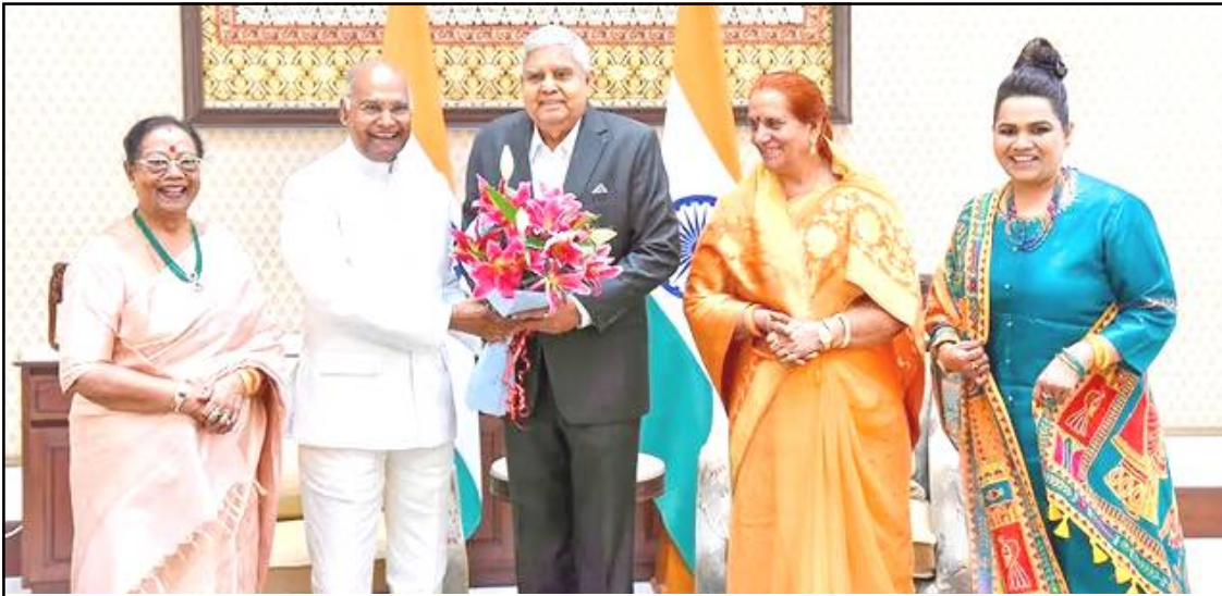
October 30, 2024 nü New Delhi nung linük tatong Tir, Jagdeep Dhankhar-i taoba mapang Tir, Ram Nath Kovind den par kibong ajurua Diwali benjung salem lemsatepba mapang tangokba noksa nung angur.