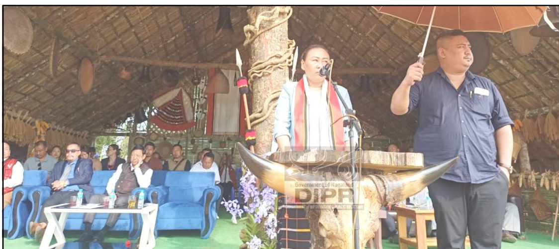
Peren District nung Tening sub-division kübok Nzau yimtsüung nung October 30, 2024 nü Chega-Gadi cum Mini Hornbill benjongmung amungdang MP Rajya Sabha, S. Phangnon Konyak-i o jembidang tangokba noksa nung angur.