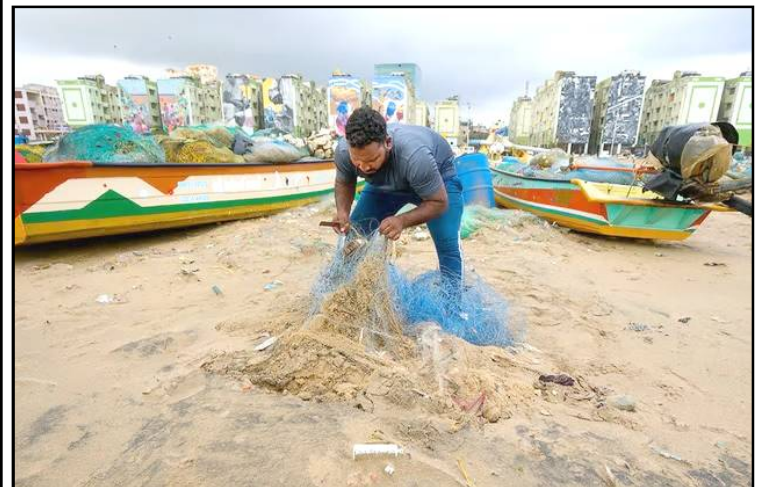
Chennai, December 01, 2024: Cyclone Fengal süiba sülen Marina Beach nung angopur kati lisem agi nembanga aliba zütsük ka agitetdang tangokba noksa nung angur.

metetdaksü. November 30 nüa Malviya Nagar nung sentong ka nung pa anema inyak, ta pai ashi. Kejriwal-i, “Kü dak shiloktsüba tzi nung yirutsüsa masü, saka lendong keta alitsüa akok. Tesüba anogo 35 tsüngda tang agi tasembenbuba ni amaker,” ta pai ashi. Taoba mapang Delhi chief minister Kejriwal-isa, Union Home Minister Amit Shah-i aibelenertem masü saka