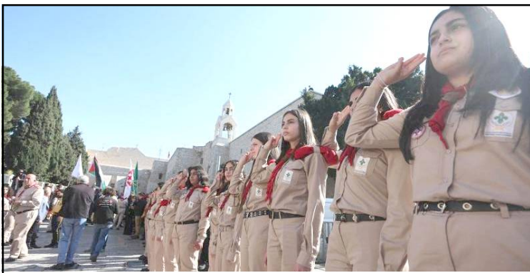
November 30, 2024 nü Bethlehem nung Church of the Nativity kima Advent Khristmas tenzükba sentong nung tsür scout temi shilem agidang tangokba noksa nung angur.

Bethlehem, December 02, 2024 (Agencies): Taküm agi küm anabuba Bethlehem nung Khristmas benjung junga memongtettsü; bendanger raliwalirtemi Bethlehem mesendangba dang masü saka Bethlehem nung alirtema aikati yimti toktsür aoer.