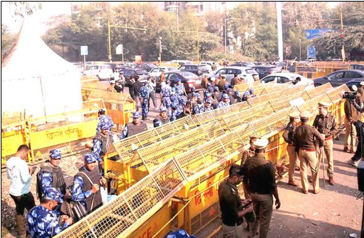
December 02, 2024 nü aluyimertemi longkak aita Delhi-i apusoba sülen Chilla arrtsülen police-i aluyimertem nokdangtsü atema atsü atsüdang anükba noksa nung angur.

"Reshikangshi tia nung aliba India nungertem küzmüksüla aser teyari agütsüla. Nüngdak dang süra asenoki Bangladesh nung takoksa angur India nungertem yaritettsü. Nüngdak dang süra asenoki parnok den chiyungtsü lemsateptetsü," ta laisa metetdaksü.