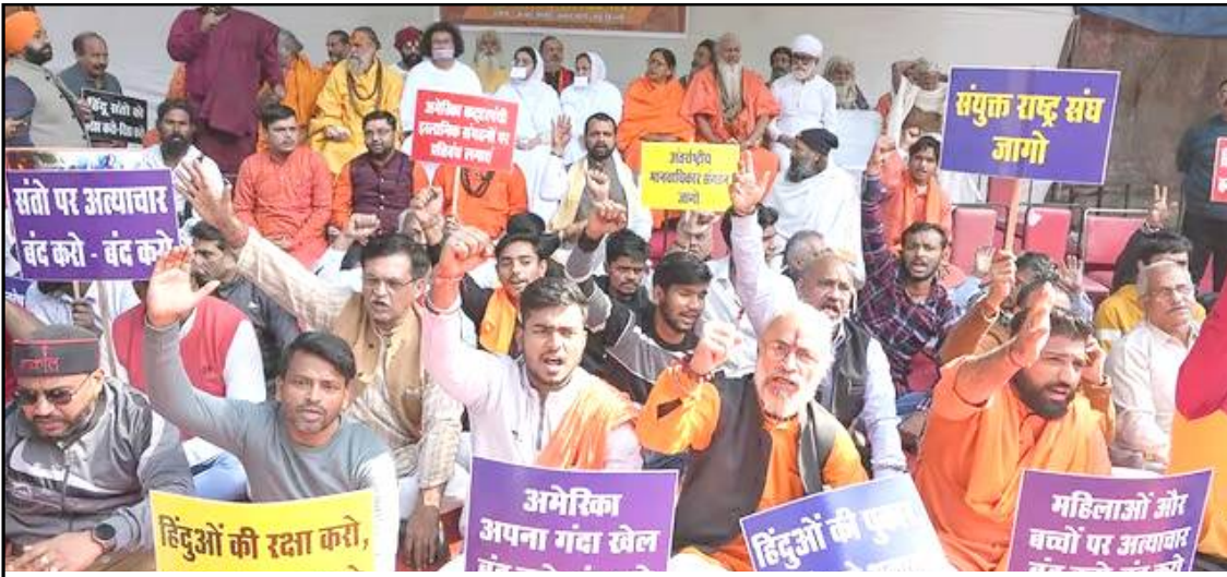
New Delhi, December 02, 2024: Bangladesh nung Hindu nungertem anema inyakba aija New Delhi nung Vishva Hindu Parishad (VHP) züngsemtemi longkak aitdang tangokba noksa nung angur.