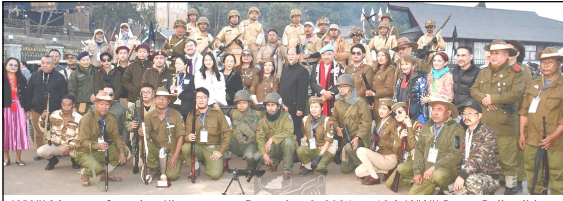
WWII Museum Complex, Kisama nung December 2, 2024 nü 13th WWII Peace Rally alidang tangokba noksa ka nung Chief Minister Neiphiu Rio den tongtipang nisungtem aser rally nung shilem agirtem angur.

Dimapur, Luchii/December 02 (TYO): Battle of Kohima bilemteta December 2, 2024 nü Naga Heritage Village, Kisama nung aliba WWII Museum Complex nung World War II Peace Rally ayongzükua liasü.