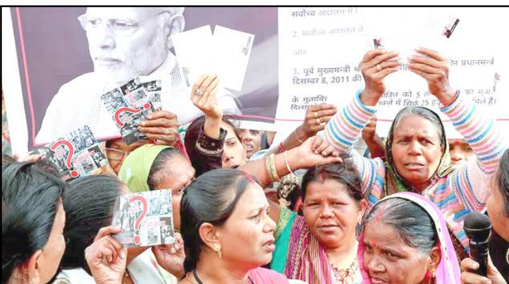
1984 küm Bhopal gas lendong nungi jenbortemi iba lendong ataloker küm 40 ajungba anogo parnok nem temenok tapet agütsütsü khanga PM dangi zülü a shiti bener Bhopal kübok Union Carbide factory anasa longkak aitba noksa nung angur.

Osang ajang ashiba agi, longkak aitertemi Bangladesh indang Assistant High Commission office telungi ai aser osettsütem raksaja liasü. Iba tatalokba ya kanga tia maka tatalokba ka aser kanga sasa bilemer ta Ministry of External Affairs (MEA)-i shiogo.