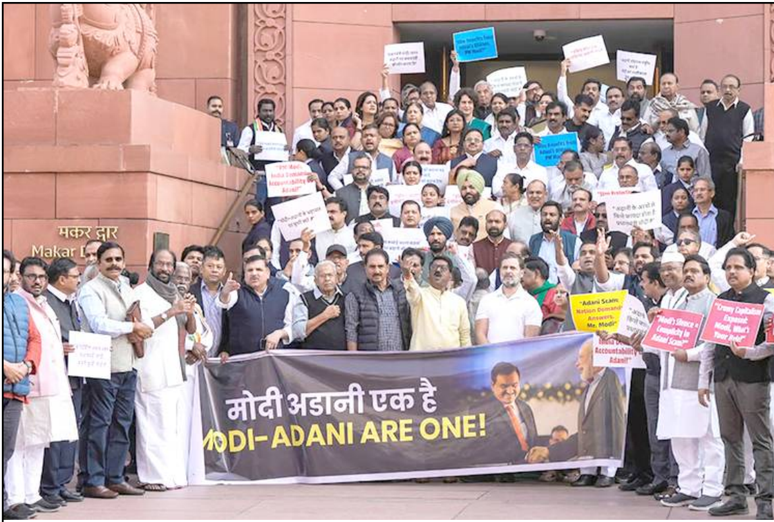
Lok Sabha nung Opposition lenir Rahul Gandhi aser tanga Opposition MP temi Parliament nung longkak aitba noksa nung angur. Opposition-i Adani ken o, Sambhal nung tawa tatalokba aser tang ken o tem anema longkak aita arudar.