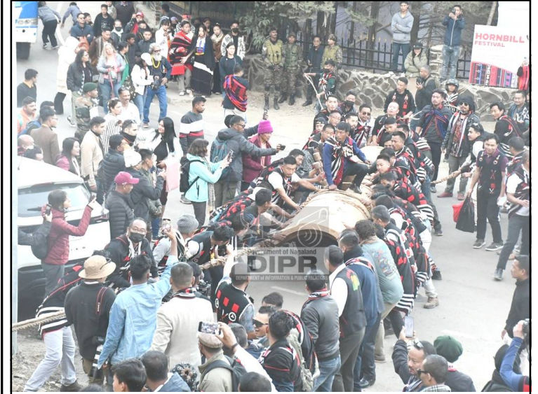
Naga Heritage Village, Kisama nung December 3, 2024 nü Tikhir kin-i süngkong atsüba mapang tangokba noksa ka yangi angur.

Dimapur, Luchii/December 03 (TYO): Akhi mapang Tikhir kin asoshi süngkong (log drum) yagi tongtipang shilem agia aru. Parnoki süngkong ya takok anguba, yimchijung aser ochi temaitsü ka ama amanger aser tongpang nung shilem tongtipang ka ama züngshir.