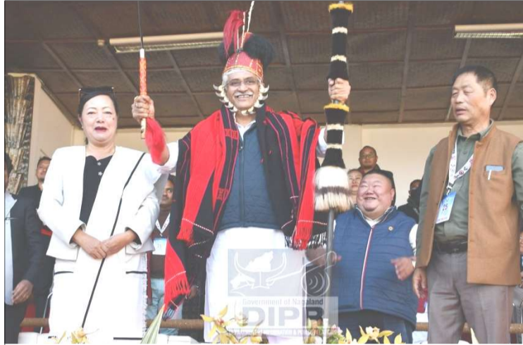
Naga Heritage Village, Kisama nung December 3, 2024 nü Union Tourism Minister Gajendra Singh Shekhawat pelashishia agizükdang agiba noksa ka angur.

Kohima, December 3, 2024 (TYO): Nagaland nung amongba Hornbill Festival ya alima nung lisopur benjung tulutiba lir aser iba ajanga tarutsü nung Nagaland aser North East region atema tourism maparen ajungketsü ta Union Tourism Minister Gajendra Singh Shekhawat-i ashi.