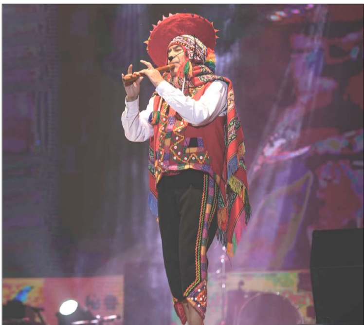
December 3, 2024 nikongdang Estampas Del (Peru)-i Toyota Hornbill Music Festival 2024 nung shilem agiba angur.

Kohima, December 3, 2024 (TYO): 25 buba Hornbill Festival 2024 nung shilem ka ama Naga Heritage Village, Kisama nung Toyota Hornbill Music Festival 2024 anogo asemnübuba mongogo.