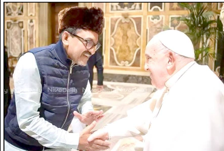
World Interfaith Conference mapang Kerala nungi lenir aser tamangba yimsü shisashir Panakkad Syed Sadiqali Shihab Thangal-i Vatican City nung Pope Francis ajuruba noksa nung angur.

Vatican City, Luchii/December 03 (Agencies): Kerala nungi lenir aser tamangba yimsü shisashir Panakkad Syed Sadiqali Shihab Thangal-i tawa World Interfaith Conference nung adentsü atema Rome-i ao aser yangji Pope Francis ajurua liasü. Sivagiri Mutt ajanga ayongzükba mungdang nung shilem agitsü asoshi Thangal-i Vatican City semdang, kong Pope Francis-i moatsüba o jembia liasü. Iba mungdang nung India tenüing nung shilem agitsü atema Thangal ya jaoka liasü. Pai Pope ajurudang, Thangal-i pa nem 'Islamic Art and Architecture: An Introduction' kaket agütsü. Mungdang mapang Pope Francis-i Indian philosopher Sree Narayana Guru-i sangdongba osang athishia jembia aser nisung meimchir ajunga kibong ka nungi lir ta