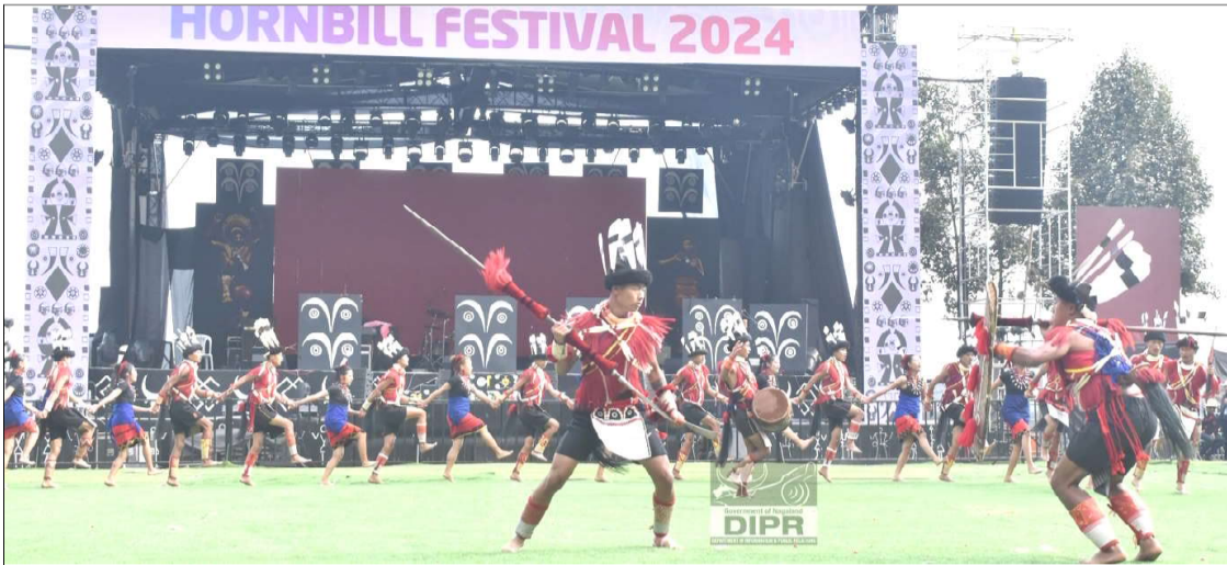
December 10, 2024 nü Naga Heritage Village, Kisama nung Ao Cultural Troupe-i Watemdong Cultural Dance ia sayuba angur.

Hornbill Festival ajanga Nagaland nung telongjem adokdaksür, tanüla akasodaksür