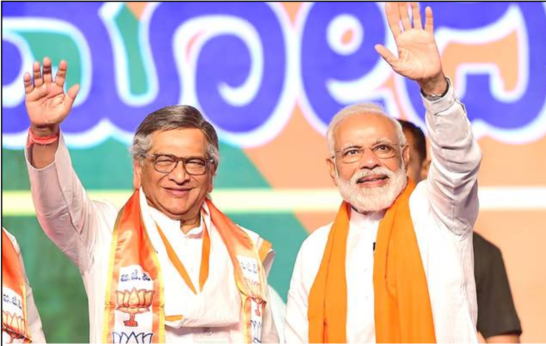
Bengaluru nung Lok Sabha election atema Vijaya Sankalap indang election rally nung Ato Kilonser Narendra Modi aser BJP lenir S M Krishna na tangokba noksa nung angur. Krishna shiba taoba union minister aser Karnataka chief minister liasü pa December 10 nü par kidang süogo ta par kinungertemi metetdaksü. Pa arishi küm 92 liasü.