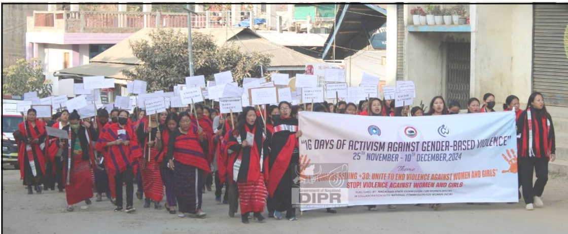
Anogo 16 ayongzüka agiba Activism against Gender Based Violence tembangba sentong Longleng nung December 10, 2024 nü agidang tetsürtem walkathon nung shilem agiba noksa nung angur.

Dimapur, Luchii/December 10 (TYO): District Administration, District Hub for Empowerment of Women (DHEW) & Sakhi-One stop centre tawabangba kübok Phom nunger tetsür tentet tulutiba, Phomla Hoichem den lungjemer "Toward Beijing+30: Unite to end Violence against Women and Girls" omen dak ajemdaker anogo 16 tashi Activism Against Gender Based Violence nung shilem ka ama sentong balala agia arua liasü.