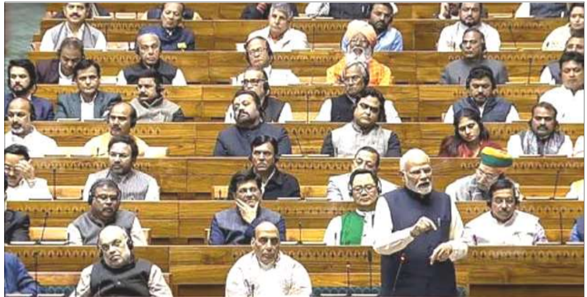
December 14, 2024 nü Prime Minister Narendra Modi-i Lok Sabha nung Constitution küm 75 abensaba indang onük jembidang agiba noksa angur.

New Delhi, December 14, 2024 (Agencies): 1975 nung Emergency benokba atema Prime Minister Narendra Modi-i Congress aitsü.