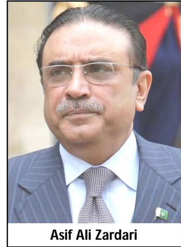
Asif Ali Zardari

Sindh sorkar aser China nunger investor tem kanga takok ngua sensaksemba sülen iba senden amenba mapang Sindh Chief Minister, Syed Murad Ali