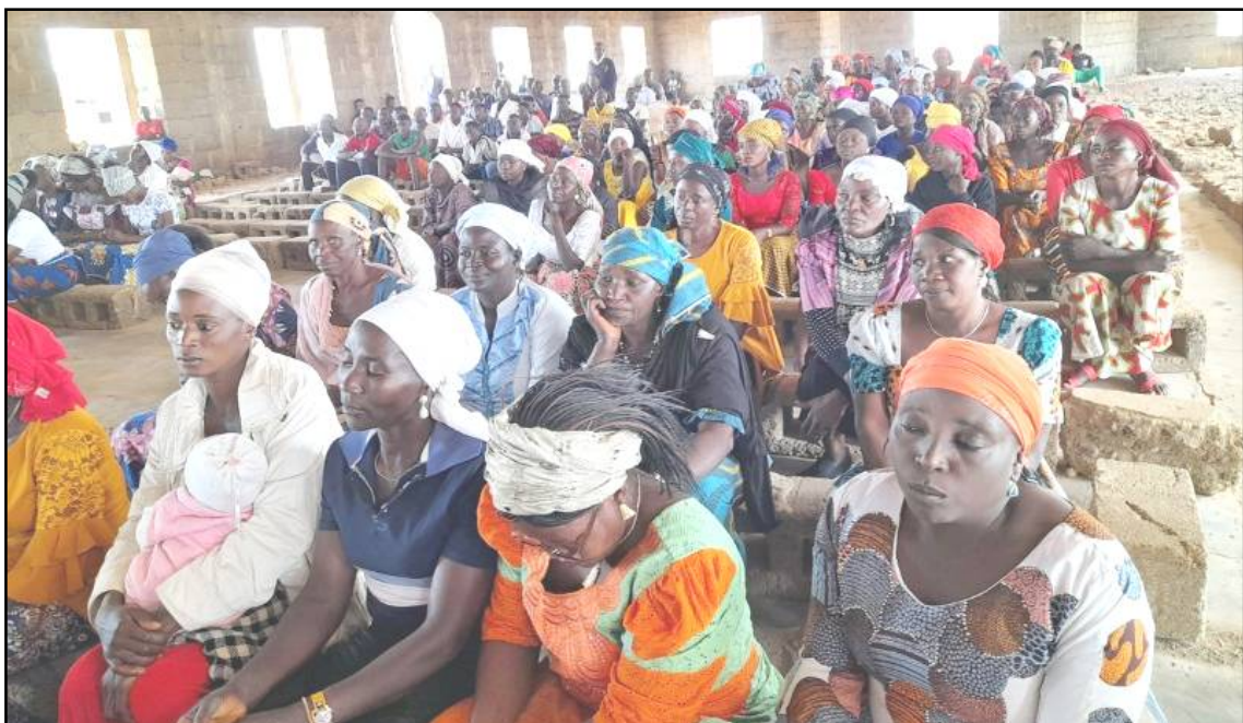
Nigeria nung tamangertem tekülem sentong nung adendang tangokba noksa nung angur.

December 14, 2024: Tesüiba küm 10 tsüngda alima nung Khrista dak amangba atema nisung teimtiba tepsetba linükji Nigeria lir; 2009 küm nungi 2023 küm tashi nung Nigeria nung Khristan 50,000 dak tali tepsetogo aser million aika jenshiogo.