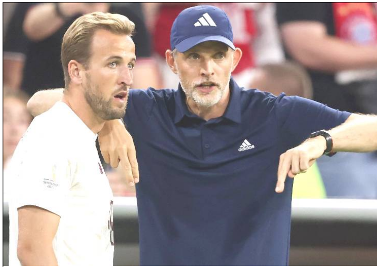
Harry Kane (abelen) aser England manager Thomas Tuchel (Achiji) noksa nung angur