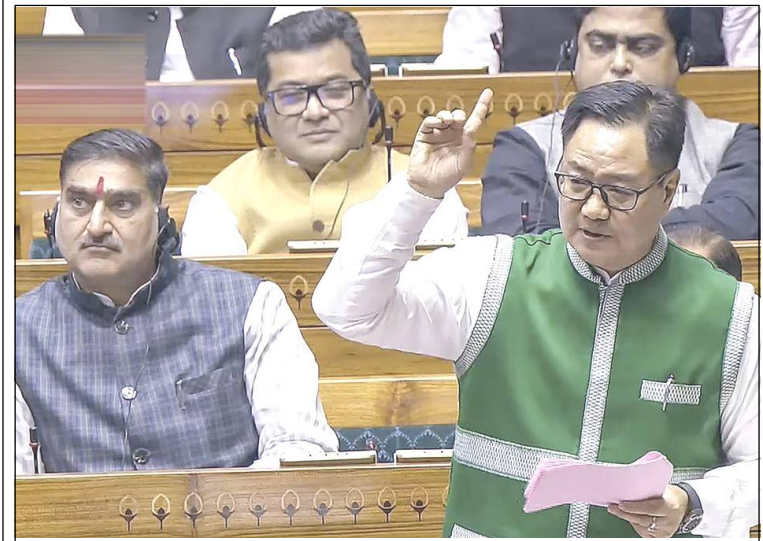
New Delhi, December 14, 2024: Honibarnü Lok Sabha senden nung Parliamentary Affairs & Minority Affairs Minister, Kiren Rijiju-i jembidang tangokba noksa nung angur.

New Delhi, December 14 (Agencies): Honibarnü Lok Sabha senden nung jembidang Parliamentary Affairs & Minority Affairs Minister, Kiren Rijiju-i, Congress party-i BR Ambedkar nem Bharat Ratna award magütsü, ta metetdaksü.