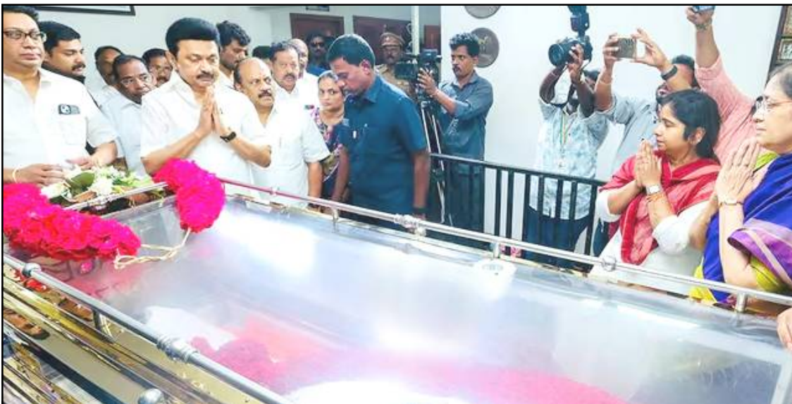
December 15, 2024 nü Chennai nung Tamil Nadu Chief Minister, M.K. Stalin-i Congress lenir, asür E.V.K.S. Elangovan nem akhüm agütsüdang tangokba noksa nung angur. Honibarnü nija hospital ka nung Elangovan süadok.