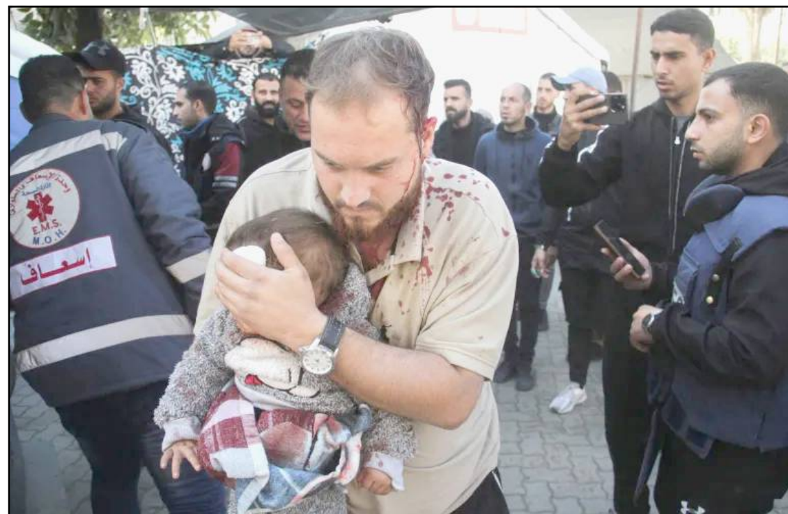
Gaza City nung Israel sepaitemi school ka amakdang nisung aika tepseter anogo ka lir aser Nuseirat refugee camp nung nisung aika tepseter anogo ana dang lir ano Deobarnü Israel-i tesem balala meita oa bomb pokloksü.

Gaza City, Luchii/December 15 (Agencies): Israel sepaitem-i Gaza nung tesem balala nungi adenshia aliba school ki ka sapangba sülen Palestine nunger nisung 15 tepset aser ano tesem balala nung osangbener ana densema nisung aika tepset ta ashir.