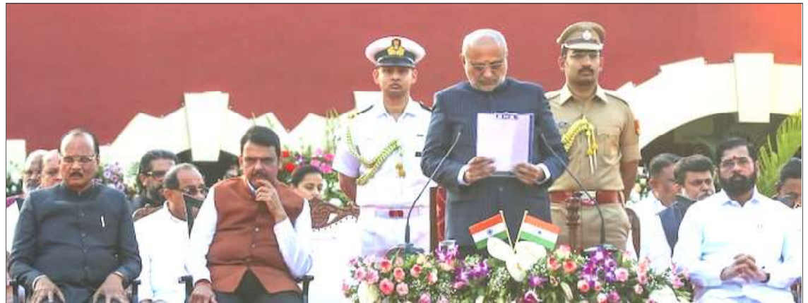
December 15, 2024 nü Maharashtra Governor C. P. Radhakrishnan-i cabinet züngsemtem nem tezüngzüktep agidaktsüdang agiba noksa ka angur.

Mumbai, December 15, 2024 (Agencies): Maharashtra assembly election results adokba sülen hopta asem tema süia arur Deobarnü Chief Minister Devendra Fadnavis-i par cabinet ulushiogo.