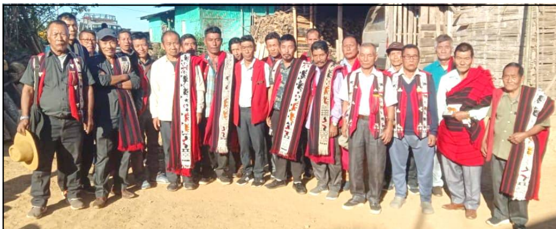
Kelingmen aser Yimjenkimong yim ana akhidang oboula nunger mapang nungi mapang mapang shia Aksü ka-a aruba ama Yimpoktsüi 26-27, 2024 anogotem nung yim ana Aksü akaba noksa nung angur.