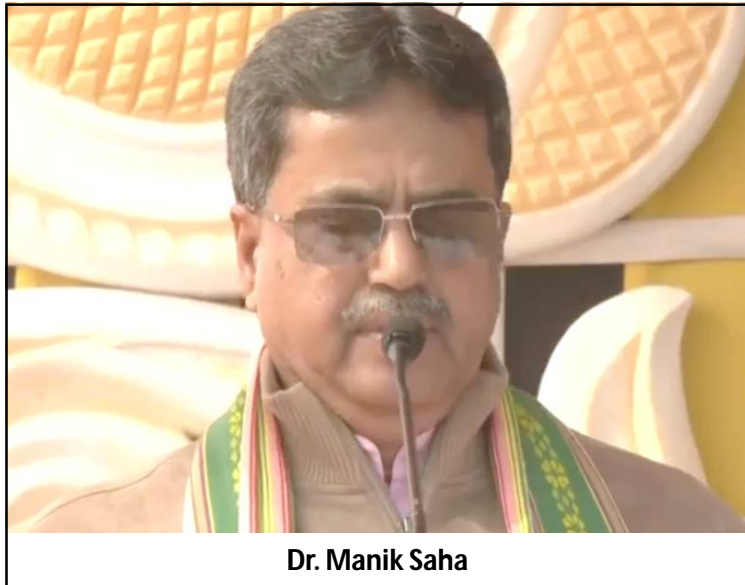
Dr. Manik Saha

Agartala, Luchii/December 15 (Agencies): State nung state-of-the-art drug de-addiction centre ka amenoktsü atema Ministry of Development of North Eastern Region (DoNER) ajanga sen ` 200 crore sanction süogo, ta Tripura Chief Minister Dr. Manik Saha-i Deobarnü ashi. Udaipur, Gomati district nung project balala atema nüngshilong azüngba sentong nung jembidang iba centre ya Bishramganja, Sepahijala district nung amenoktsü, ta Dr. Saha-i ashi. "Iba drug de-addiction centre nungya facility tajung den