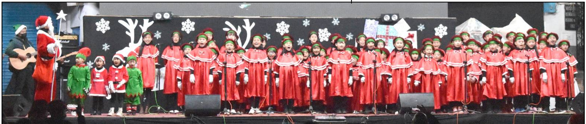
Mokokchung, Luchii 21(TYO): Mokokchung Police Point nung December 20 aonung 36 Buba Children Christmas Cake Carol Competition -2024(C5) tetoktepba "Echoes of Joy" ta asüba omen nung ajemdaker nisung meyrirjnsng aika adenshia kanga dang temoatsü aser takok ngua agitetogo. Iba C5 tetoktepba nung MTBA kübok Fellowship 10 nungi tanur ajak agi 801-i shilem agi aser iba tetoktepba nung Aongza Youth Fellowship, A&D Youth Fellowship aser Penli Youth Fellowship parnoki mezüngbuba, tanabuba aser tasembuba jenjang ajangzüketa liasü. Mezüngbuba jenjang ajangzüketa Aongza Youth Fellowship puri atenba mapang tangokba noksa

Iba sülen, Tsüklai 01 nü kasa tesem nung Jorhat aser Mokokchung DC na aruagi kaketshirtem ajurua parnok den külemi sobaliba sentong nung adentsü. Iba mapang Mokokchung DC-i Assam nung kaketshirtem nem sempet agütsütsü aser Jorhat DC-i Naga nung kaketshirtem nem sempet agütsütsü renema lir. Iba ama sentong ajanga state ana tsüngda teti yimjung nung alitsüsa putep tenzüksü imlar ta BPCC(A-N) lenirtemi metetdaksüogo.