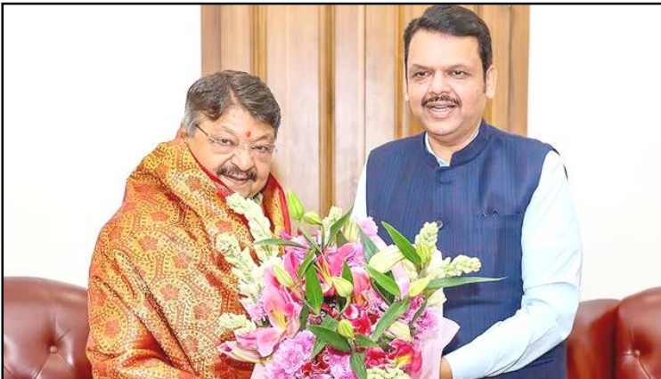
December 30, 2024 nung Mumbai nung Maharashtra Chief Minister, Devendra Fadnavis aser Madhya Pradesh Minister Kailash Vijayvargiya na senden amenba sülen tangokba noksa nung angur.

Osangbenertem den jembidang Kishore-i, "Onok longkak aittsü atema aoer masü. Kaketshirtem yangji mena lir, ibayongji parnok ajurutsü atema onok iba tesem jagi aoer. Gandhi Maidan ya public tesem ka aser anogo shia nungtem iba tesem jagi aoer. Kaketshirtem atema tesem melira parnoki public aliba tesemi aotsü," ta ashi. Paisa, "Bihar ya democracy tetsü lir, aser kaketshirtem nem parnok tebilemba jembidaktsütsü atema parnok nem temeden magütsüra koma asütsü? ibayongji onok kaketshirtem den lir," ta ashi. Lokti den jembidang Kishore-i, kaketshirtem ajak tenüng nung züngsem pongui state chief secretary ajurua parnok takhangba metetdaksütsü, ta ashi. "Ktdangsertemi o lemteptsü melungogo. Telemtetba ka dangi marura kaketshirtemi Hombar nungi asentenshir longkak aittsü," ta pai metetdakja liasü. Paisa kaketshirtem dang khenpiga atema longkak aitba anena atatsü mepishi, saka kaketshirtemi tashi mangaia longkak aita Chief minister Nitish Kumar 'er ki tsütsüleni longkak aita aoba ajanga police-i ajok amshitsüsa aküm.