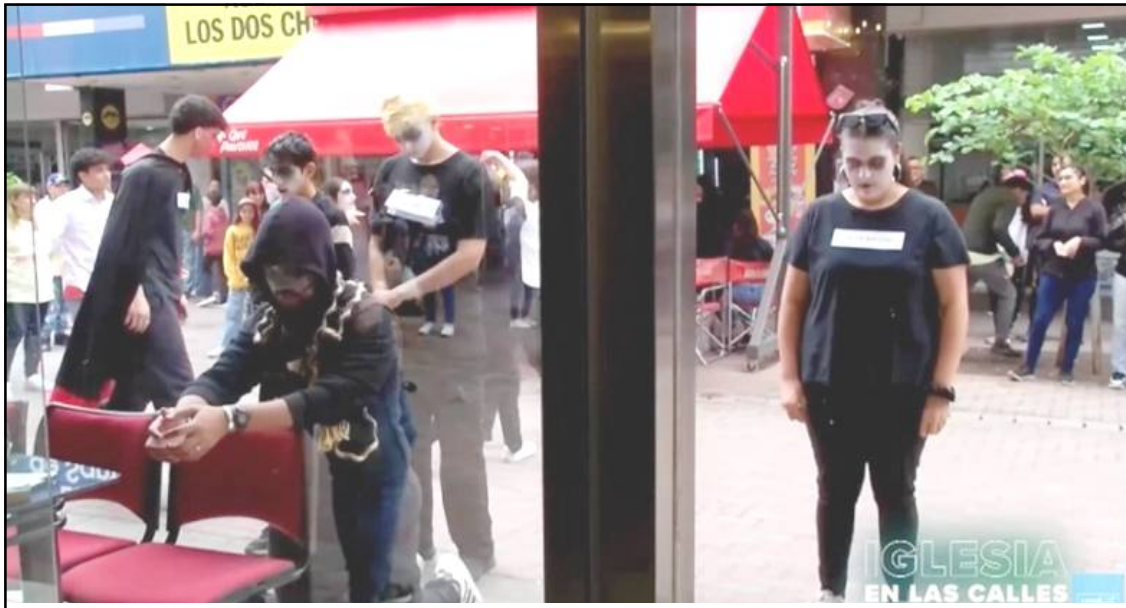
December 27, 2024 nü Argentina nung National Evangelization Day anogomong amongdang Rosario nung aliba San Martín Plaza kima volunteers-i shilem agidang tangokba noksa nung angur.

December 30, 2024: Youth with a Mission (YWAM) den Christian Alliance of Evangelical Churches of Argentina (ACIERA) aser Argentine Bible Society (SBA) longjemer Argentine nung aliba yimti 400 dak tali nung Khrista osang tajung prok.