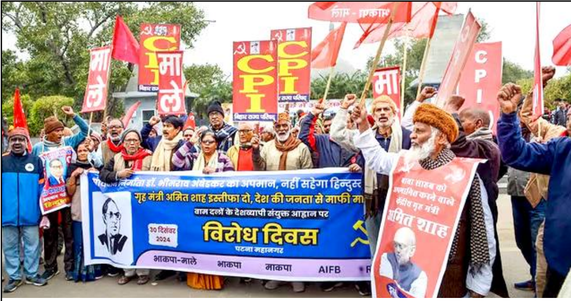
December 30, 2024 nung Patna nung Left party tem nungi züngsemtemi, Union Home Minister Amit Shah-i Parliament nung B.R. Ambedkar mezüngmeshia jembio, ta aija longkak aitba noksa nung angur.