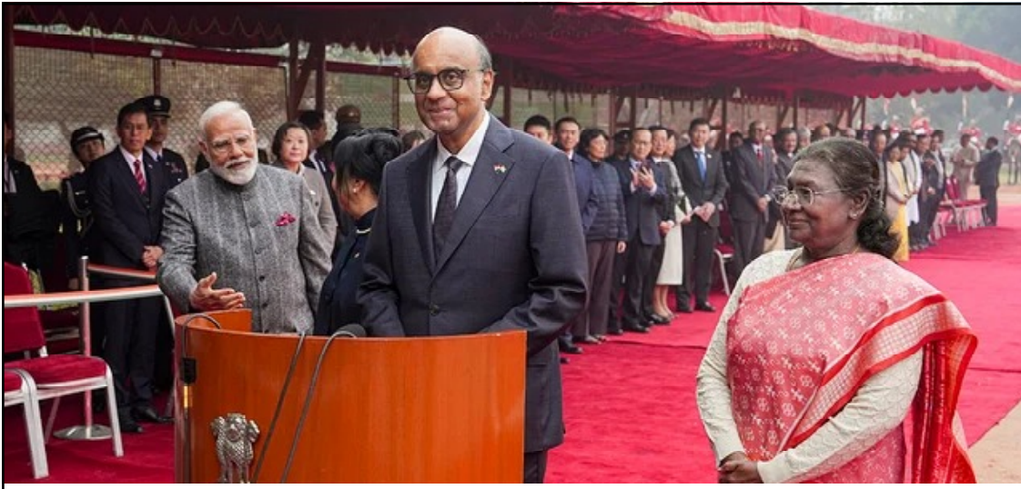
January 16, 2025 nü Rashtrapati Bhavan, New Delhi nung Singapore Tir, Tharman Shanmugaratnam agizükba sülen pai osangbenertem den jembidang tangokba noksa nung angur. Kasa noksa nung Ato kilonser Narendra Modi aser Tir, Droupadi Murmu nata angur.