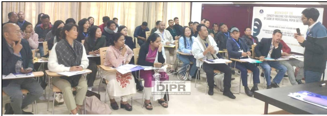
Maths aser Science tesayurtem atema workshop agiba mapang tangokba noksa nung angur.

Dimapur, Aenjeti/January 16 (TYO): Nagaland Board of School Education (NBSE) aser Performance Assessment, Review, and Analysis of Knowledge for Holistic Development (PARAKH) na longjemer Mathematics aser Science tesayurtem atema anogo asem asoshi "Capacity Building for Preparation of Cadre of Professional Paper Setters" dak sendakba nung workshop ka ayongzüka agiogo.