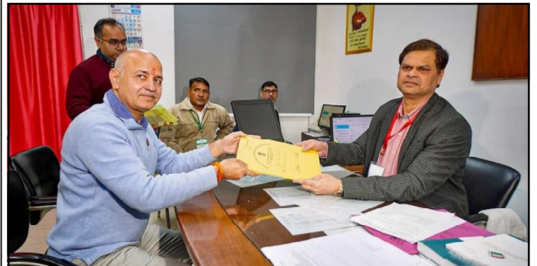
January 16, 2025 nü New Delhi nung Jangpura constituency nungi AAP candidate, Manish Sisodia-i Delhi assembly election nung tokteptsü atema nomination file asüadang tangokba noksa nung angur.

Ano külen US Tir menden atema shima alisang, Donald Trump-i, "Rara anentsü tezüngzüktep agitetba ya yaküm November ita nung onoki takok anguba ajanga lir. Iba takok ajanga alima dang ni aniba administration-i yimjung atema inyaksü aser America nunger ajak aser onok pusemertem kümzüksü atema tezüngzüktep agitettsü ta sayur. Pua aliba America nunger aser Israel nunger tanaben pei kidangi oa kibong züngsemtem den tanaben longjemtsü, ta meteta ni pelar," ta metetdaksü.