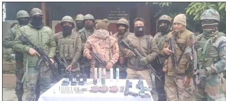
It dangiterba osang tejangja kar dak ajemdaker Manipur police aser Assam Rifles temi Lilong Police Station, Thoubal District kübok Ushoipokpi tenemtsüng len telungpur indang camp tejen ka Honibarnep meita aoba mapang Single Bore Barrel (Sniper) ka, country-made rifle ka, Amogh Carbine magazine ka, .303 magazine asem, HE Hand Grenade ka, Detonator ka, 7.62 x 39mm live rounds pongu, .32 live round trok, 9mm live round ka, .303 empty case trok, 7.62mm (SLR) empty case pezü, 7.62 x 39mm empty case trok, Green Smoke 80MK1 ka, Stun Shell ana aser Tear Smoke Shells asem den TYT Radio sets asem den antenna, charger asem aser adaptor ka nguteta liasü.

Kibur/kinunger/tembar temi Officer-in-charge, East Police Station, Dimapur den Mobile No. 7085055020 ajanga tongteprateptsü akok, ta Dimapur Police sangdong ka ajanga ashi.