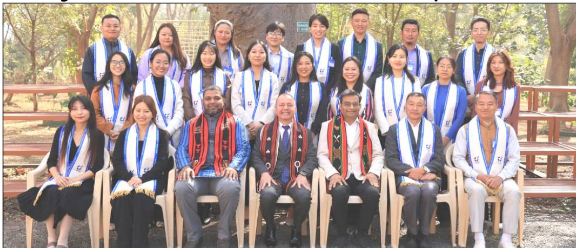
Nagaland nungi tesayur aser research scholars tem den IMM-Indore indang director aser professors tem tangokba noksa nung angur.

Kohima, Aenjeti/January 19 (TYO): Tawa Indian Institute of Management (IIM) Indore, Madhya Pradesh ajanga Nagaland University aser Kohima Science College Jotsoma nungi tesayur aser research scholars 21 atema Faculty Development Programme (FDP) ka sponsor süa liasü.