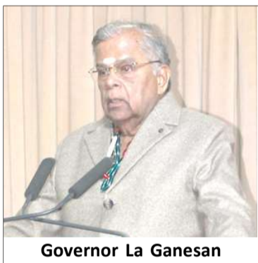
Governor La Ganesan

Dimapur, January 21, 2025 (TYO): Raj Bhavan, Kohima nung January 21, 2025 nü Manipur, Meghalaya, aser Tripura state foundation day ayongzüka mongogo.