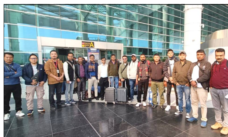
Northeast nungi osangbenertem Media Tour mapang tangokba noksa ka yangi angur.

Prayagraj, Aenjeti/January 21 (Agencies): Northeast India nungi osangbener nisung 14-i Prayagraj nung Maha Kumbh 2025 semdang, koba Press Information Bureau (PIB) ajanga Government of Uttar Pradesh den lungjemer January 21-23, 2025 anogotem asoshi media tour ka ayongzüka lir.