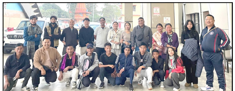
Phonetsholing, Bhutan nung asayatsü aliba International Sports and Games Tournament nung shilem agitsü atema All Nagaland Shaolin Kung-Fu Association, Nagaland team apusoa aoba mapang Dimapur Railway Station nung tangokba noksa nung angur. Iba asayamung ya January 21 nungi 23 tashi asayatsü. Nagaland team nung asayar 35 aser ketdangsür 5 lir. Iba asayamung atema India team nung asayar 187 lir.