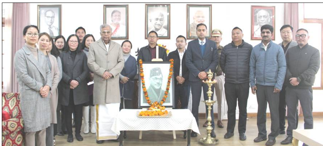
January 23 nü Raj Bhavan, Kohima nung Netaji Subhas Chandra Bose Jayanti mungogo, kong Nagaland Angh La Ganesan aser Governor's secretariat officers aser staff temi shilem agia liasü.

School tekolaktemi "Joint Action Plan on Prevention of Drugs and Substance Abuse among Children and Illicit Trafficking" indang copy download sütettsü, koba DoSE Online Educational Services Portal ( https://dosenl.in ) nung inokja lir.