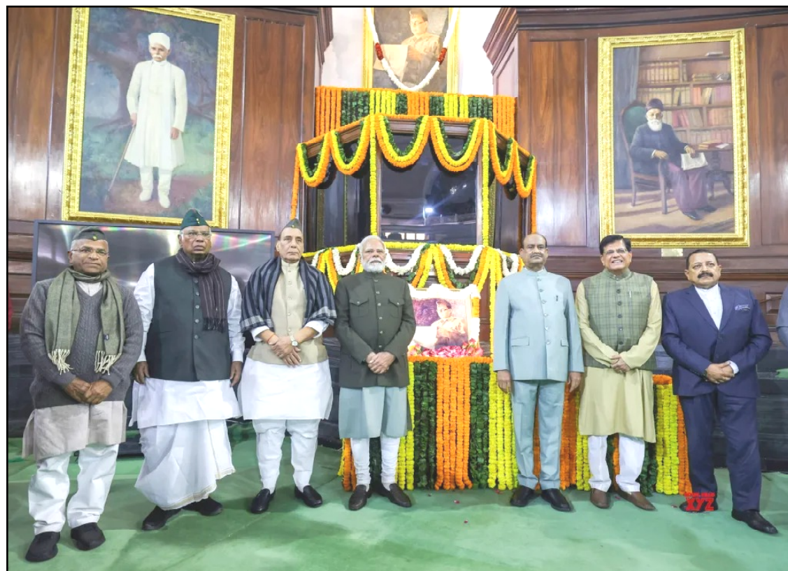
New Delhi, January 23, 2025: Brihostibarnü Parliament Central Hall nung Ato kilonser, Narendra Modi, Congress Tir, Mallikarjun Kharge, Defence Minister Rajnath Singh, Lok Sabha Speaker Om Birla aser tangartemi linük nüchiso atema rarar, Subhas Chandra Bose asoba anogomong nung asür nem akhüm agütsüba sülen tangokba noksa nung angur.

Taoba hopta Trump-i pa indang advisors dang, pai kobi melii India aser China na semdangner, ta lemsatepa liasü. Taruba ita France nung Artificial Intelligence (AI) Action Summit aliba mapang nung Trump aser Modi na ajurutsüa akok.