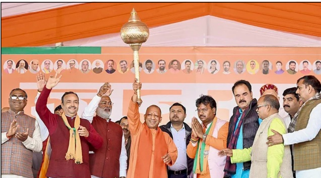
Milkipur nung by election agitsü mapang ana nung lia January 24, 2025 nü Ayodhya nung Uttar Pradesh Chief Minister, Yogi Adityanath-i election nüboyim sentong ka nung adenba noksa nung angur.

Delhi nung Assembly menden 70 atema February 5 nü election agitsü aser February 8 nü vote azüingtsü.