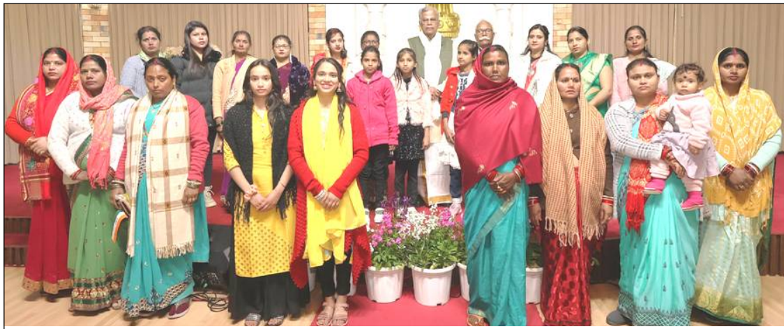
Raj Bhavan Kohima nung Uttar Pradesh State Foundation Day amungba sentong nung tangokba noksa angur.

Dimapur, Aenjeti/January 24 (TYO): Raj Bhavan, Kohima nung January 24, 2025 nü Uttar Pradesh indang State Foundation Day munga liasü.