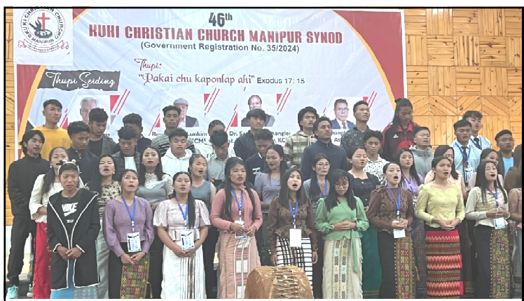
Songlei Mongbung, Saikul Sub-Division nung Kuki Christian Church (KCC) Manipur Synod 46buba mungdang amongdang tangokba noksa nung angur.

January 24, 2025: January 20, 2025 nü Songlei Mongbung, Saikul Sub-Division nung Kuki Christian Church (KCC) Manipur Synod 46buba mungdang tembangogo.