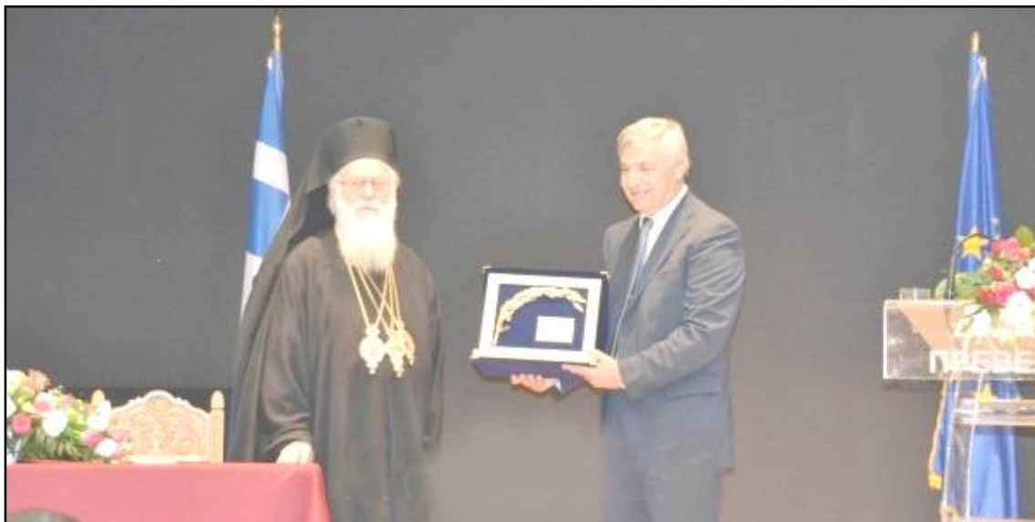
2017 kum September 21 nü Albanian Orthodox Arogo nung tongti, Anastasios nem "Honorary Citizen" award agütsüdang tangokba noksa nung angur.

January 25, 2025: Tan ita tejaklen Albanian Orthodox Arogo nung tongti, Anastasios temang mejungi treatment agitsü atema tayimtsü ajanga Athens-i anir oa liasü, ajisüaka pa temang tamajungba kuma alima nungi pilaogo; pa arrshi kum 95 liasü.