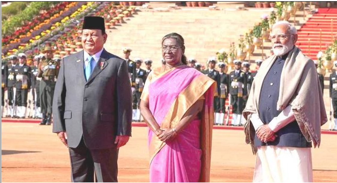
January 25, 2025 nü Rashtrapati Bhavan, New Delhi nung Tir, Droupadi Murmu aser Ato kilonser Narendra Modi nati Indonesia Tir Prabowo Subianto agizükdang tangokba noksa nung angur. Amongnü Republic Day sentong nung Subianto tongti tejaoker asütsü.