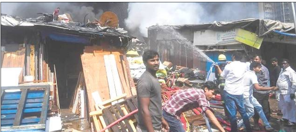
January 25, 2025 nü Mumbai kübok Goregaon kiyong nung furniture market ka arongdang tangokba noksa nung angur.

Singh ya taküm Haryana assembly elections nung Naraingarh menden nung candidate liasü.