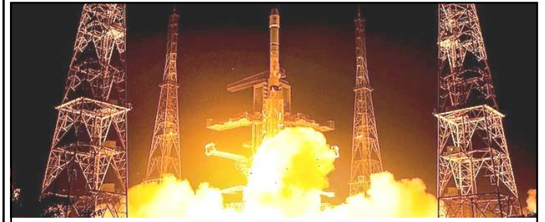
January 28, 2025 aonung 7:53 ako nung Sriharikota nung aliba Satish Dhawan Space Centre (SDSC) nungi ISRO indang Geosynchronous Satellite Launch Vehicle (GSLV-F15) nung navigation satellite NVS-02 bener khakettsüdang tangokba noksa nung angur.

Telangana state sorkari loktiliba-rongsenkettzung, mapa, yimtenren aser caste survey tenzüka liasü.