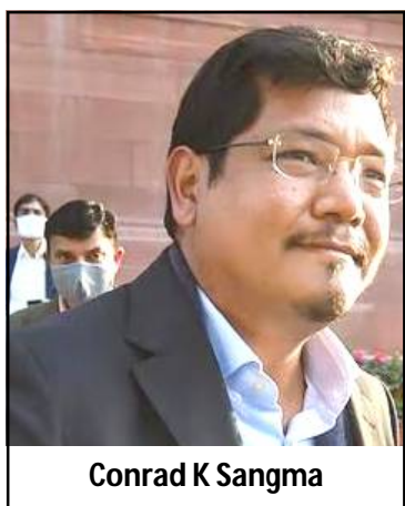
Conrad K Sangma

Shillong, Tsüklai/February 1 (Agencies): Bharatiya Janata Party (BJP) Meghalaya unit-i, Chief Minister Conrad K Sangma-i Uniform Civil Code (UCC) anema nokdakba pusemba metetdaksüogo aser ashiba agi, par party-i state nung aliba nüburttem tejangraba mezüing südaksütsü.