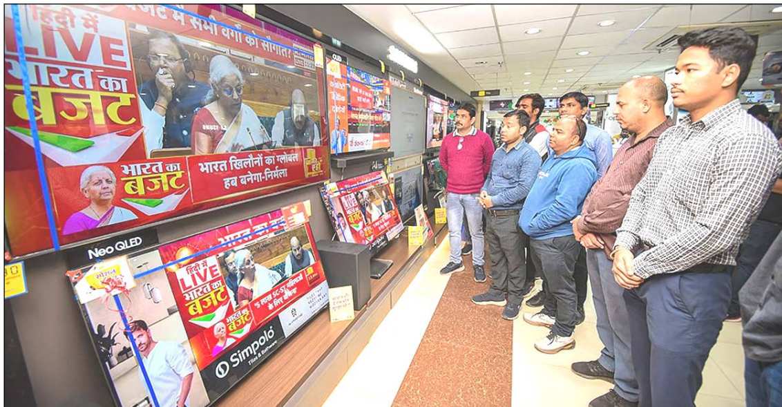
February 01, 2025 nü Patna nung aliba TV showroom ka nung nisung kari Finance Minister Nirmala Sitharaman-i Parliament nung Union Budget benokba reprangdang tangokba noksa nung angur.

Yaküm state nung tatalokba balala nung sepaitemi Maoists 219 tepseta liasü.