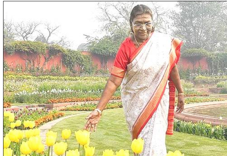
New Delhi, February 01, 2025: Honibarnü Rashtrapati Bhavan kima Amrit Udyan lapokba mapang Tir, Droupadi Murmu-i nung kongshidangba noksa nung angur. February 2 nungi tenzuka March 30 tashi public atema Amrit Udyan lapoktsütsü.

February 5 nü Delhi nung Assembly elections agiba sülen February 8 nü vote azüngtsü.