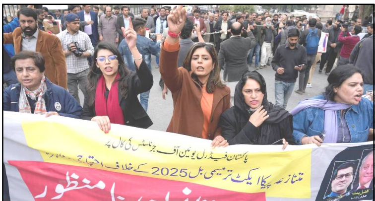
January 28, 2025 nü Pakistan nung journalist temi Prevention of Electronic Crimes (Amendment) Bill 2025 (PECA) ozüng anema longkak aйдang tangokba noksa nung angur.

February 01, 2025: January 29, 2025 nü Pakistan Tiri social media dak sendakba ozüng tasen ka agizüka sign süogo, ajisüaka Arogo lenirtem aser meimchir temeden atema inyakteremiba iba ozüngji ajanga online nung reshikangshiba osang prokterem mesüra sorkar anema ola adokertem nem temerenshi agütsütsü, ta bilemer.