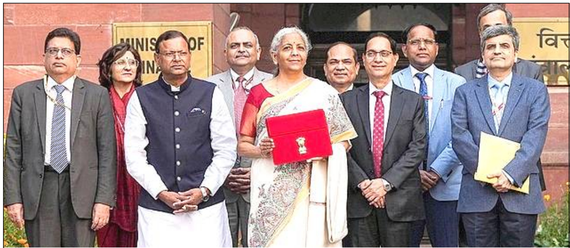
New Delhi, February 01, 2025: Honibarnü Union Budget 2025-26 benoktsü jakdang Finance Ministry office kima Union Finance Minister, Nirmala Sitharaman den Union Minister of State for Finance Pankaj Chaudhary aser Finance Ministry nung tongti ketdangsertem tangokba noksa nung angur.

New Delhi, Tsüklai/February 01 (Agencies): Honibarnü Union Finance Minister, Nirmala Sitharaman-i Parliament nung Union Budget 2025-2026 benokogo; iba budget nung taküm assembly election agitsü aliba Bihar nung Makahana board ka tentetsü, greenfield airport ka amenoktsütsü aser Western Koshi Canal Project atema senotsü aika lezmüksüogo.