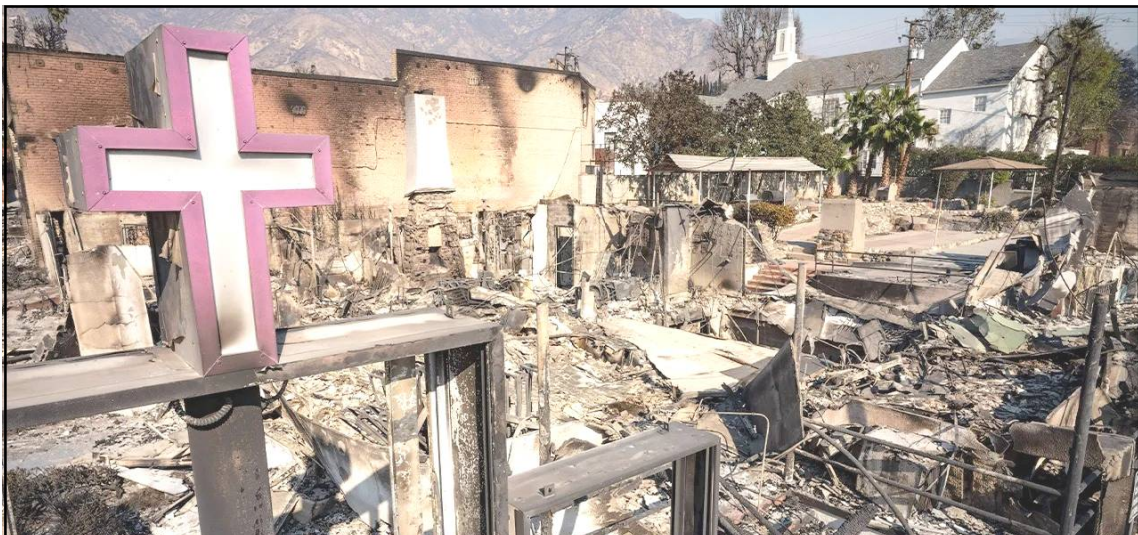
California kübok Altadena nung merok mi agi Lifeline Fellowship Christian Center Tenla ki rongdokba tesem nung Kangki bo merongi aliba noksa nung angur.

Tsüklai/February 01, 2025: Tawa California kübok Altadena nung nung merok mi lendong nung Lifeline Fellowship Christian Center Tenla ki-a rongdoka liasü; Tenla ki ajak rongdokaka Kangkibo marong, ibaji ajanga Arogo züngsemtem tamanga jenjang tashi taiba akümba den külemi teimla mesama.