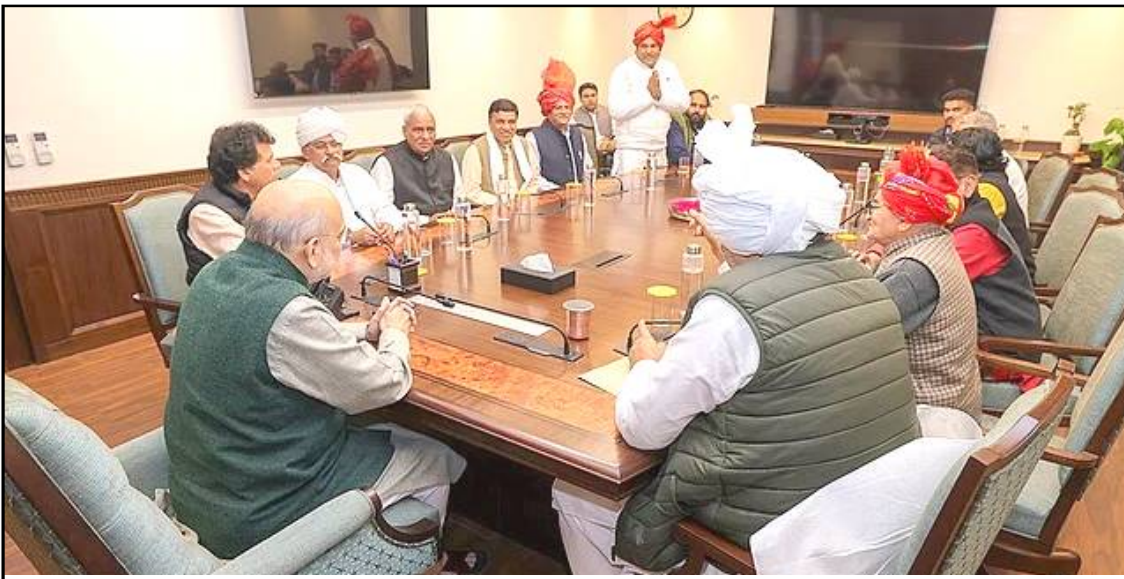
New Delhi, February 02, 2025: Delhi nung assembly election agitsü anogo asemnü dang lia Union Home Minister, Amit Shah-i Delhi yimti tezülen aliba yimtsüngtem nungi telok ka ajurua senden amendang tangokba noksa nung angur.