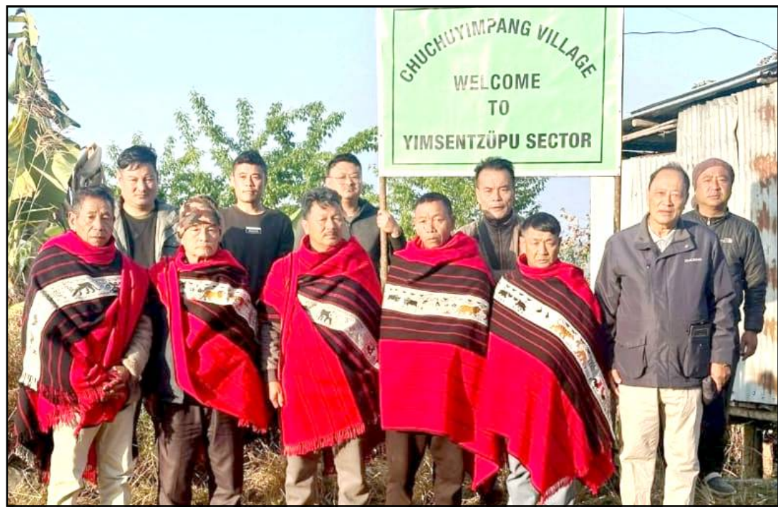
Yimsentzübu Sector mesemetba anogo Chuchuyimpang, Riongsanger Putu Tatar Menden yimsüsür aser sector lenirtem tangokba noksa.

Iba sector ya District Executive Force Mokokchung den kidanger süa lir. Yimsentzübu Sector Chuchuyimpang ya; Chuchuyimpang Putu Menden tetuyuba nung inyakyim ajak inyaka aotsü tanü neburtem dang sangdonger.