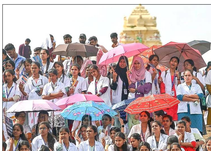
October 11, 2025 nü Bengaluru nung World Hospice & Palliative Care Day anogomong sentong ka nung medical student tem adenba noksa nung angur. Iba sentong ya Kidwai Memorial Institute of Oncology-i Lalbagh Botanical Garden nung ayongzüka agi.

NB:- The selected participants are directed to report to the ground at Town Hall, Mokokchung Town at 7 a.m. The participants are directed to keep their exhibits in their stall under lock & key. The office shall not be held responsible in case of any losses/theft. Selected participants must display genuine products with full stock, failure to do so will result in revoking their participation from the exhibition. Selected participants are informed to reach at scheduled time. In case of failure, their participation in the event will be revoked. Managing Director NHHDC Ltd.