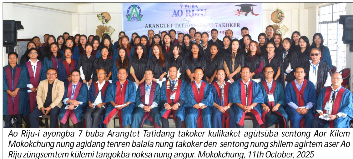
Ao Riju-i ayongba 7 buba Arangtet Tatidang takoker kulikaket agütsüba sentong Aor Kilem Mokochung nung agidang tenren balala nung takoker den sentong nung shilem agirtem aser Ao Riju züngsemtem külemi tangokba noksa nung angur. Mokochung, 11th October, 2025