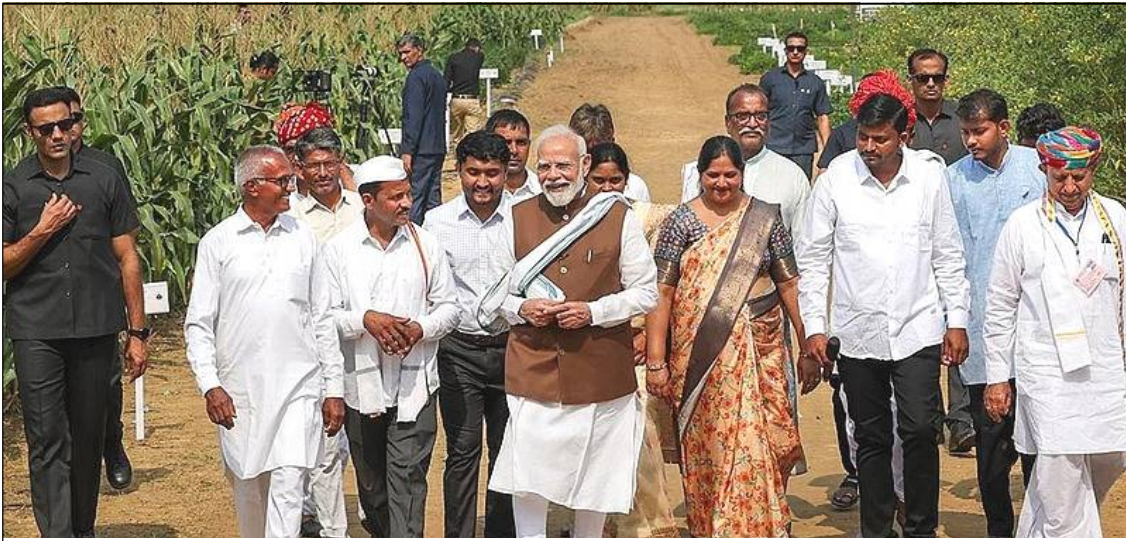
October 11, 2025 nü New Delhi kübok Pusa nung aliba Indian Agricultural Research Institute nung to kilonser, Narendra Modi-i aluyimertem ajurudang tangokba noksa nung angur.