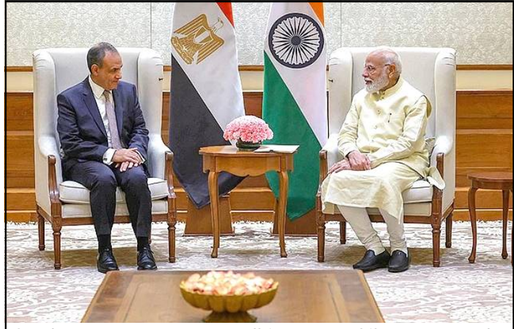
October 17, 2025 nü New Delhi nung Ato kilonser Narendra Modi-i Egypt Foreign Minister, Badr Abdelatty den senden amendang tangokba noksa nung angur.

küm tatembanglen tashi nungbo final population data renemtsü, aser iba nungji ajemdaker delimitation tenzüksü aser 2029 küm Lok Sabha election tashi nungbo tetsürtem nem menden lemsütsütsü. Census dak sendakba housing listing ji shilem ana lemsar April 1, 2026 nungi tenzüka September 2026 tashi agütsü, iba sülen 2027 küm February 9 nungi February 28 tashi nung nütsüng tejangja sükdangtsü. Taoba hopta Registrar General of India aser Census Commissioner office nung Census 2027 pre-test atema training agütsütsüpurtem nem anogo pezünü tashi training agütsüogo, aser tangbo training agirtem jagi states/union territories ajak nung enumerators nem training agütsü tenzüko, ta ketdangsertemi metetdaksü. Census 2021 atema-a pre-test agia liasü, ajisüaka coronavirus wara ajanga census magitet. Tangbo census inyakyimji kanga melenshiogo. Kobi melii enumerators aser supervisors lakh 34 aser Census ketdangser lakh 1.3 atema training ayongzüka parnok nem Census apps amshiyim, Census management aser monitoring system tesayuba agütsütsü.