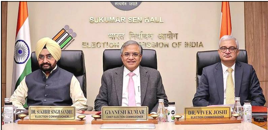
October 17, 2025 nü Chief Election Commissioner (CEC) Gyanesh Kumar den Election Commissioner ana- Sukhbir Singh Sandhu aser Vivek Joshi nungeri Bihar assembly election dak sendakba nung sepai aser police tongti ketdangserem den senden amendang tangokba noksa nung angur.