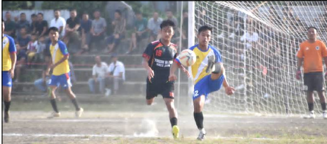
Thunderbolt FC aser Doyang Strikers MKG asaya mapang tangokba noksa nungji angur.

Mokokchung, Mongputeni/October 17 (TYO) : 27 Buba MDFA Trophy tanü Imkongmeren Sports Complex Mokokchung nung pezünübuba mezüngbuba asaya nikongdang 1:00 ako nungi Telongjem FC aser Intermingla Club asaya aser tanabuba asaya 2:30 ako nungi Thunderbolt FC aser Doyang Strikers MKG tsüngda asaya liasü.