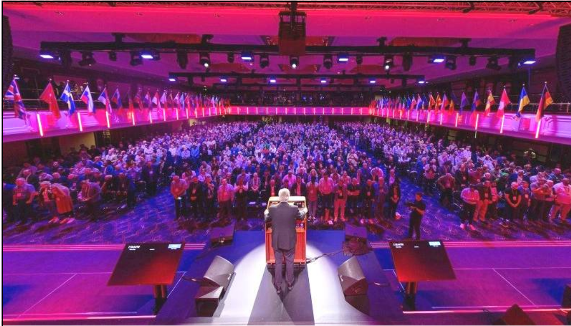
Taküm May ita nung Germany yimtiba, Berlin nung Billy Graham Evangelistic Association (BGEA)-i ayongzükba European Congress on Evangelism senden nung BGEA Tir, Franklin Graham-i jembidang tangokba noksa nung angur.

October 17, 2025: Alima nung tang tashi Khrista osangtajung mangashidangba nütsüng aika aliba regions nung Khrista osang proktsü nükjidong nung Billy Graham Evangelistic Association (BGEA)-i 2027 küm August 24-27 anogotem nung Sydney, Australia nung Asian-Pacific Congress on Evangelism ayongzüksü.