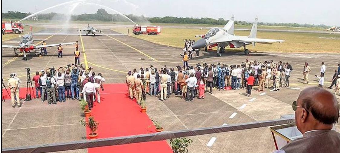
October 17, 2025 nü Maharashtra kübok Nashik nung aliba Hindustan Aeronautics Limited (HAL) nung Defence Minister Rajnath Singh-i India nung tang mezüng yangluba Tejas Mk1A raraba tayimtsü sayatsüdag tangokba noksa nung angur.

iba tayimtsü nungi Israel nung yangluba ELTA ELM-2052 radar aser fire-control system inoksemtsü. HAL indang operational lines ana Bengaluru nung lir aser tasembubaji Nashik nung amenok; iba facility nung küm shia raraba tayimtsü 8 tashi yanglutettsü. Taküm August ita nung Cabinet Committee on Security-i Mk1A fighter kjets 97 yanglusemstü atema sen crore 66,500 lemsükja liasü, aser ibaji densemabo jets ajak senteper 180 asütsü. Air Chief Marshal AP Singh-i mapang shia, raratsü atema renema alitsü asoshi IAF-i küm shia ishiba agia raraba tayimtsü 40 bosa nungdaker, ta metetdakja aruogo.