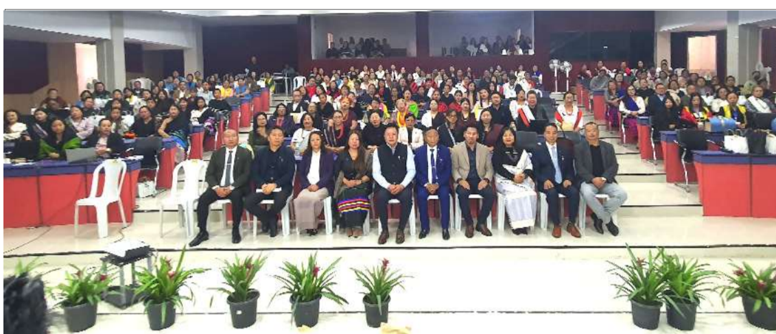
January 7, 2026 nü Kohima nung International Women's Day sentong nung agiba noksa ka angur.

Kohima, March 7, 2026 (TYO): Tetsürtem dak tashiyim inyakba azüoktsü aser kasa maongka agütsütsü asoshi külemi yaritepa inyaktsüla ta Forest, Environment and Climate Change Minister C. L. John-i ashi.