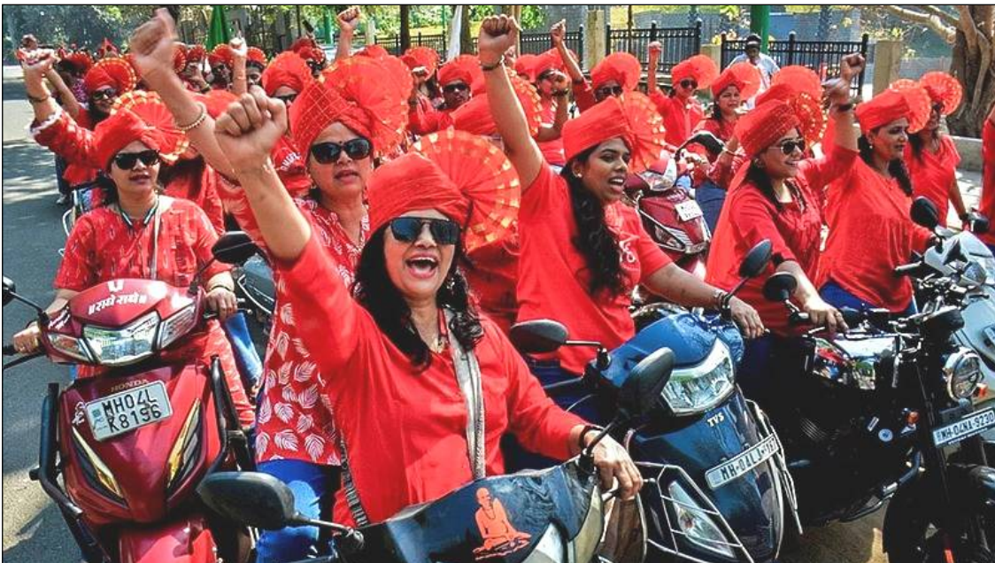
Thane, March 07, 2026: International Women's Day anogomong atongtsü anogo ka jelia Honibarnü Thane nung tetsürtemi bike rally nung shilem agidang tangokba noksa nung angur.