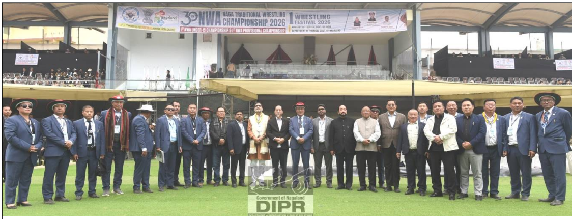
30buba Naga Traditional Wrestling Championships cum 1buba Wrestling Festival 2026 sentong nung Chief Minister Dr. Neiphu Rio aser tanga ketdangsürtem tangokba noksa nung angur.

Dimapur, Metsüremi/March 7 (TYO): 30buba Naga Traditional Wrestling Championship den repsema 1buba Wrestling Festival 2026 March 7 nü Kohima Local Ground nung tenzükogo.