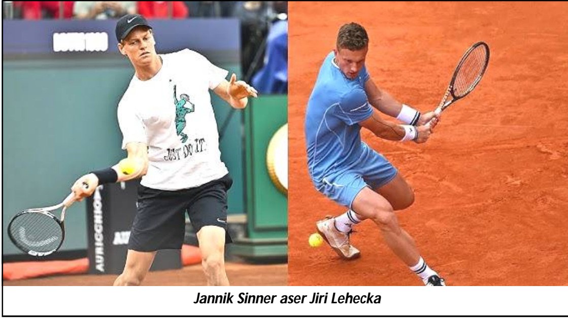
Jannik Sinner aser Jiri Lehecka

Metsüremi/March 28, 2026 (Agencies): Italy nungur world number two Jannik Sinner-i tanga asaya aliba Miami Open nung maneni kanga junga asaya-a Hokolbarnü fourth-ranked Alexander Zverev koka final tongtetogo, kong pa Czech nungur Jiri Lehecka den asayatsü.