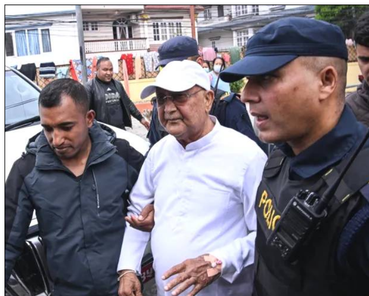
Taoba Nepal Ato Kilonser KP Sharma Oli Honibarnü Kathmandu nung apuba sülen police temi anir aoba noksa nung angur.

Kathmandu, Metsüremi/ March 28 (Agencies): Taoba Nepal Ato Kilonser K.P. Sharma Oli Honibarnü puogo. Taoba September ita Gen Z puri linük nung ochi mashi inyakim anema longkak aitba mapang nisung aika asüba menokdangtetba atema police-i tang bushisüngdanga aliba mapang pa puogo, ta ketdangsürtemi metetdaksü.