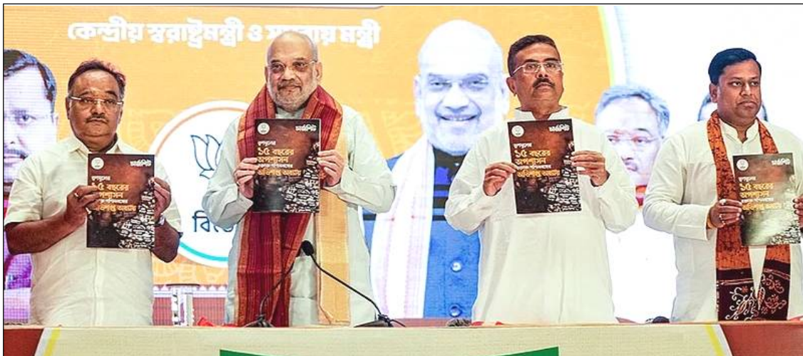
March 28, 2026 nü Kolkata nung Union Home Minister Amit Shah-i TMC sorkar anema 'charge sheet' sayaba noksa nung angur. Kasa noksa nung West Bengal Assembly nung opposition lenir Suwendu Adhikari, Minister of State Sukanta Majumdar aser State party Tir, Samik Bhattacharya nungera angur.