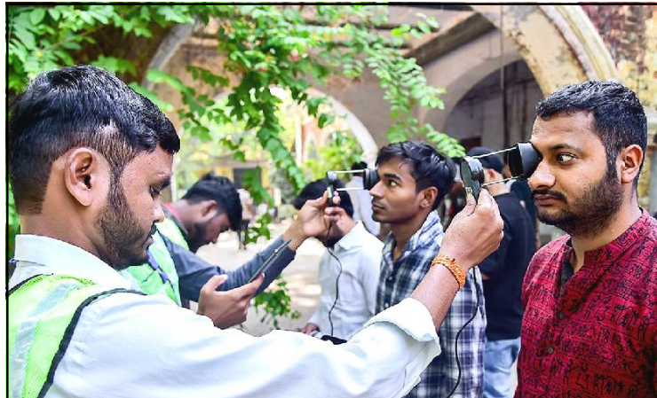
March 29, 2026 nü Prayagraj nung Combined State/Upper Subordinate Services (PCS) Mains Examination 2025 agütsütsüpurtem 'security checking' mapang tangokba noksa nung angur.