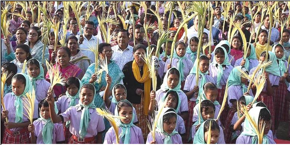
March 29, 2026 nü Ranchi nung Palm Sunday anogomong nung Khristantemi süngojung amer sarasadema jajadang tangokba noksa nung angur.