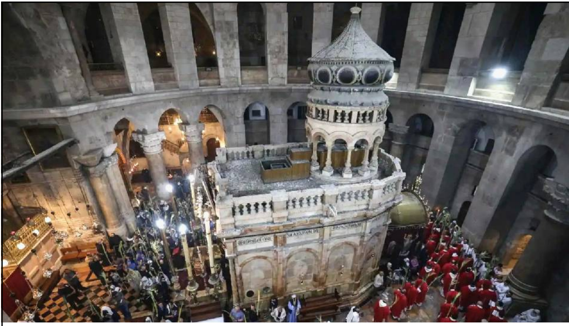
Holy Sepulchre Tenla ki

March 28, 2026: Easter atongtsü mapang ana nung lia Yirusalem nung Khristan lenirtemi Israel ketdangsertem dang Holy Sepulchre Tenla ki lapokjang, ta mepishiogo.