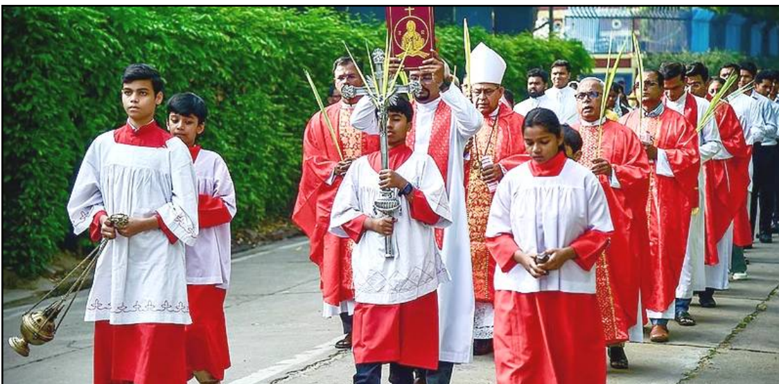
March 29, 2026 nü Uttar Pradesh kübok Prayagraj yimti nung St. Joseph's Cathedral Arogo nung Palm Sunday amongdang tangokba noksa nung angur.

2021 küm West Bengal assembly election bo shilem 8 lemsar agia liasü aser iba election nungji Trinamool Congress-i menden 213 tashi nung takok nguteta liasü.