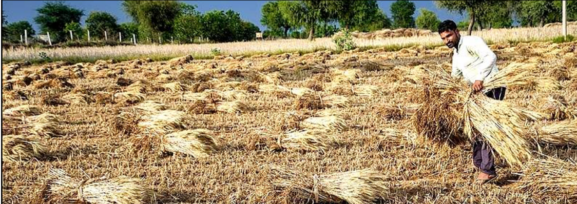
April 01, 2026 nü Haryana kübok Loharu nung aluyimer kati wheat tsükjung bendenba noksa nung angur.

kabo tang tashi mangur, ta Hombarnü ministry of external affairs-i metetdakja liasü. Aseem Mahajan, Joint Secretary (Gulf)-i, "Kuwait amakba mapang nung tia makai India nungera ka asü. Onoki par kibong den mangyim jashi lemsateper. Kuwait nung Indian mission-i par kibong den tongtepratepdar aser tekaraba nung tasü mangji bener arutsü atema yangji aliba ketdangsertem den amalitepa inyakdar," ta metetdakja liasü. Hombarnü Kuwait ministry of electricity, water & renewable energy-i sangdong ka ajanga, Amongnü nikongdang Iran nungeri drone amshia amakdang India nunger ka asü aser Power & Water desalination plant den building kanga mejungi raksa, ta metetdakja liasü.