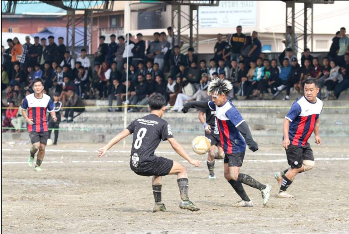
Mokokchung Inter-Ward Football Tournament-2026, mezüngbuba Semi Finals Süngkomen Ward aser Artang Ward tsüngda asayaba mapang tangokba noksa.

Mokokchung, Rongchii/ April 01 (TYO) : Imkongmeren Sports Complex Mokokchung nung tanü 7 Buba Mokokchung Inter-Ward Football Tournament-2026, mezüngbuba Semi Finals Süngkomen Ward aser Artang Ward tsüngda nikongdang 1:30 Ako nungi tenzüka asayaogo aser iba asaya nung Süngkomen Ward-i goal 3-1 agi Artang Ward kokteta Final asayatsü jenjang ajangzüketogoto.