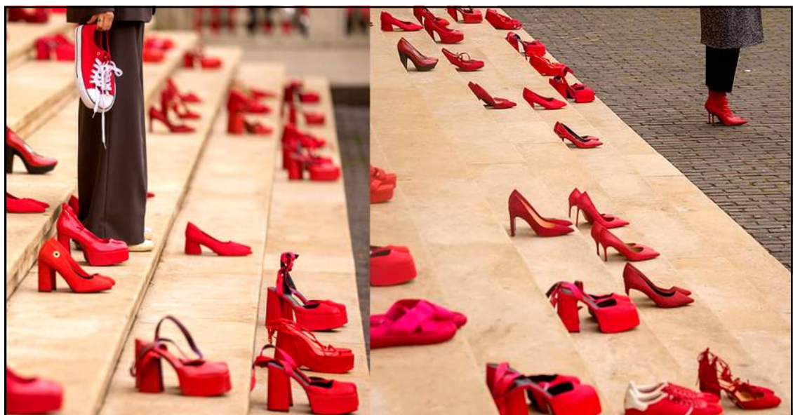
Bucharest, Romania nung awareness sentong ka aliba mapang domestic violence agi kongshir alirtem den dena lir ta temaitsü tsüngsem sentsü temerem yuja aliba anasa tetsür ka nokdaka aliba noksa nung angur. Romania nung domestic violence mechi hopta shia tetsür ka asür ta ashir.