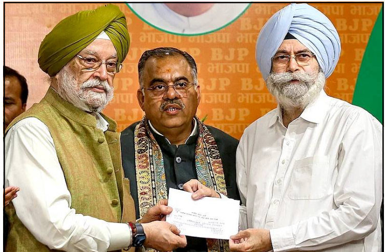
April 01, 2026 nü New Delhi nung Union Minister Hardeep Singh Puri-i senior Supreme Court advocate aser taoba mapang AAP lenir, HS Phoolka nem BJP ticket agütsüdang tangokba noksa nung angur.

mezüngbuba shilem atema shilem 46 (180 LMT) lir, ta metetdaksü. Agrochemicals dak sendakba nung Maninder Kaur Dwivedi-i, alu nung mesen asütsü mozü 2.5 lakh MT lir, aser ibaji nungdakba dang nungi kanga tali lir, ta metetdaksü. Agriculture Ministry-i alu nungi züsentedbatem wholesale jenjang-a mita dang reprangdar, aser jenjang matutsü, ta metetdaksü. "Alu nungi züsentedba aonsotsütem tesüiba kümtem nung ama jenjang matutsü. Alo, bengana aser piaz jenjang tajungba dang kumdar," ta lai ashi.