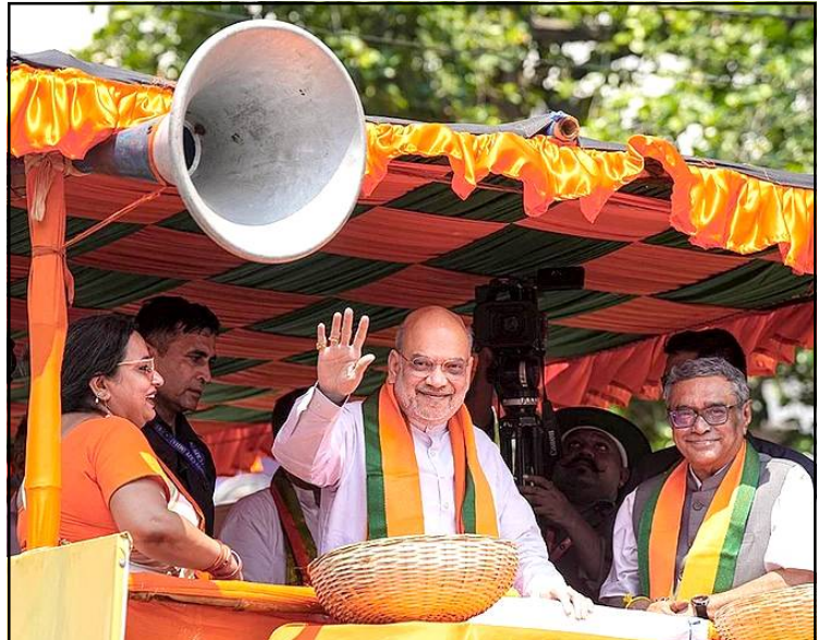
April 02, 2026 nü Kolkata nung Union Home Minister Amit Shah-i BJP candidates- Swapan Dasgupta aser Shatorupa na atema nüboyimja road show nung shilem agiba noksa nung angur.

Road nung government bungalow ka reprangdangogo. Pa CM menden nungi anenba sülen iba kidangji alitsüa akok.