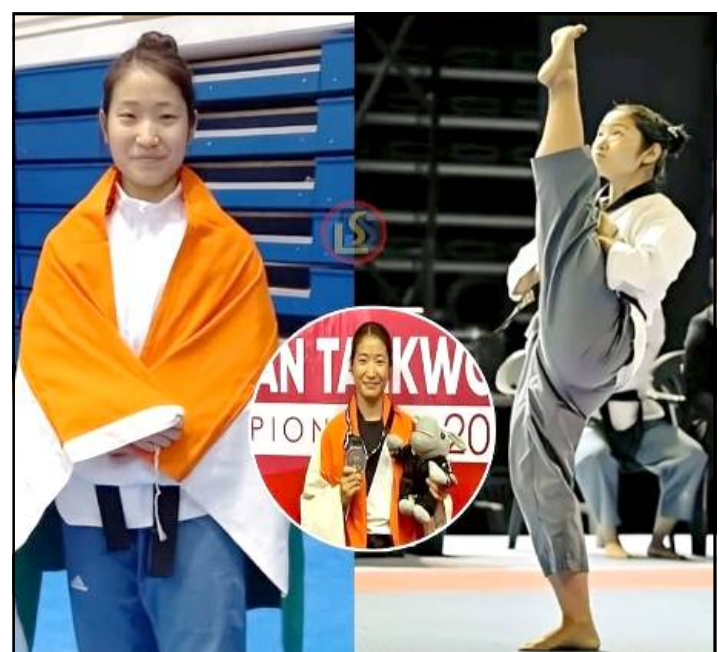
Arunachal tsür Rupa Bayor ya India nunger Taekwondo asayartem rongnung World No. 6 aser Asia nung No.1 jenjang ajangzüktetba mezüngbuba asayar kümogo.