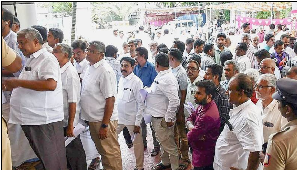
April 02, 2026 nü Erode District nung Erode East constituency nungi tokteptsü atema tenü agütsüsü asoshi Mudaliar nunger aika nokdaka aliba noksa nung angur.

Erode (Tamil Nadu), April 02 (Agencies): Tamil Nadu nung Senguntha Mudaliar nungertemi, April 23 nü agütsü aliba Tamil Nadu election nung tongti party temi Erode district nung par nisung ka danga candidate meshim, anungji parnok 500 dak temai independent candidates ama tokteptsü telemetba agiogo, ta metetdaksü.