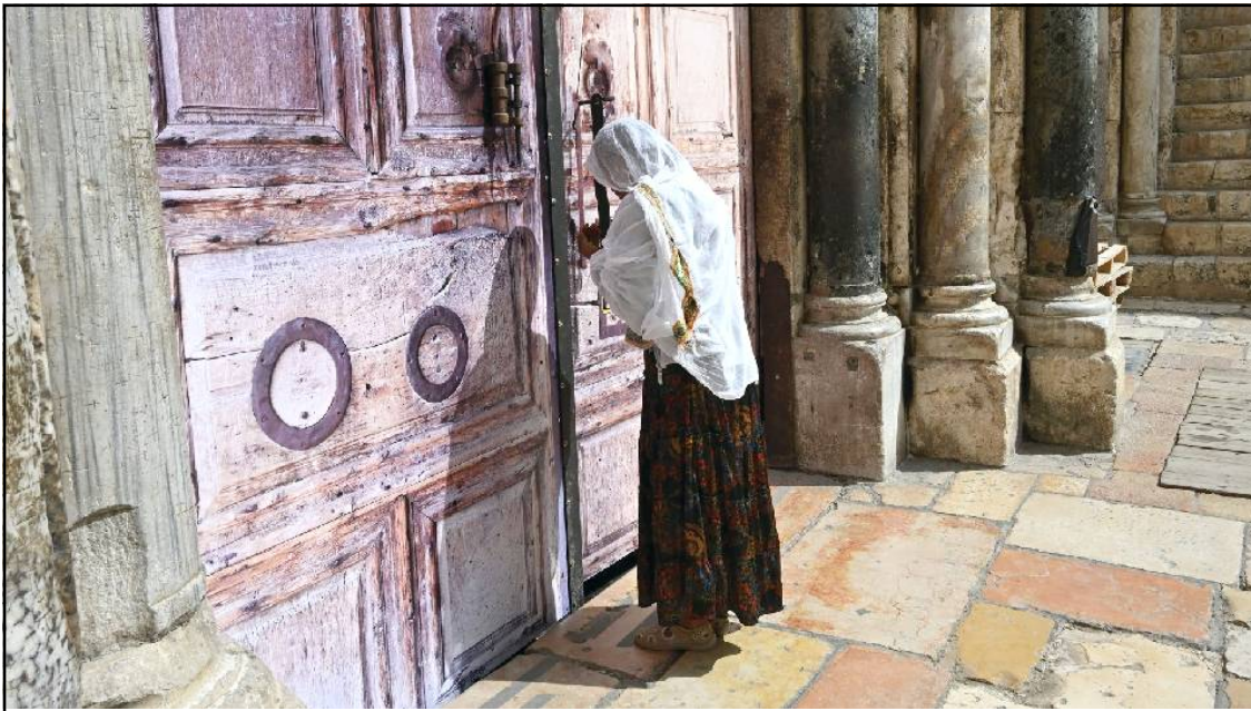
Jerusalem nung Holy Sepulchre Tenla ki shibanger liaka Ethiopia tsür Khristan kati kikümbang anasa nokdaker sarasademba noksa nung angur. Iba noksa ya March 4, 2026 nü tangokba noksa lir.

April 02, 2026: Latin Patriarchate of Jerusalem-i sangdong ka ajanga, Israel keddangsertemi Holy Sepulchre Tenla kidang temeshi hopta aser Easter amongtsü atema temelaba agütsüogo, ta metetdaksü.