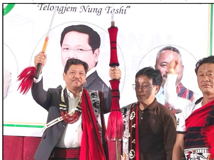
Meghalaya Chief minister Wb. Conrad Sangma Longkhum yimti nung par NPP telok nüboyimba sentong nung agiba noksa ka yangi angur. (Longkhum, April 02, 2026)

Longkhum, April 02, 2026 (TYO): National People's Party (NPP) Tir aser Meghalaya Chief Minister, Conrad K. Sangma-i April 9, 2026 nü 28-Koridang Assembly Constituency by-election nung par party candidate I. Abenjang atema nübu yimtsü