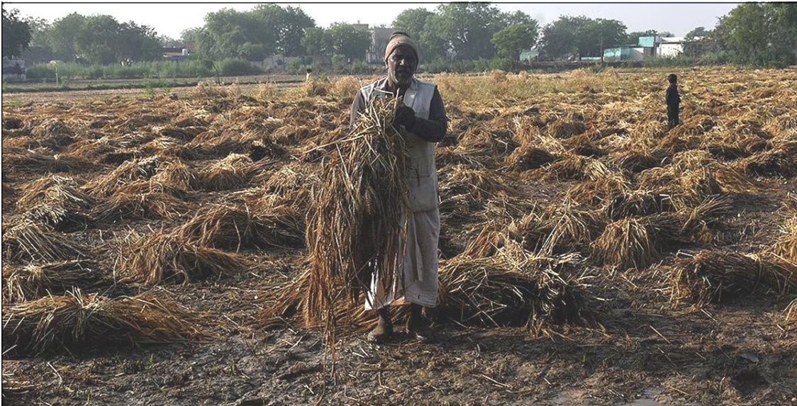
Agra, April 04, 2026: Agra nung tzüinglu aser yipru agi wheat lu raksatsür alidak aluyimer kati wheat tsükjung bendenba noksa nung angur.

West Asia nung rara adokba sülen tang tashi nung nisung 2,700 dak tali süogo, aser asürtemji teimbaka Iran nungi lir.