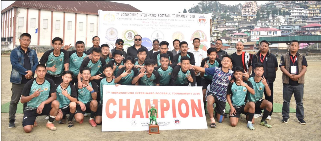
7 Buba Mokokchung Inter-Ward Football Tournament-2026 champion Mongsenbai Ward asayartem aser tayongertem külemi tangokba noksa.

Mokokchung, Rongchii/ April 04(TYO) : 7 Buba Mokokchung Inter-Ward Football Tournament-2026, March 24 nungi tenzuka asayaba tanü Süngkomen Ward aser Mongsenbai Ward tsüingda nikonngang 1:00 Ako nungi tenzuka final asayaogo aser iba asaya Mongsenbai Ward-i goal 2-0 agi Süngkomen Ward kotteta takok marok benogo.