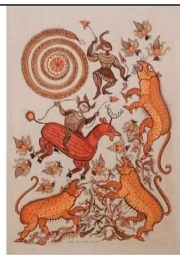
The Odyssey of Poireiton