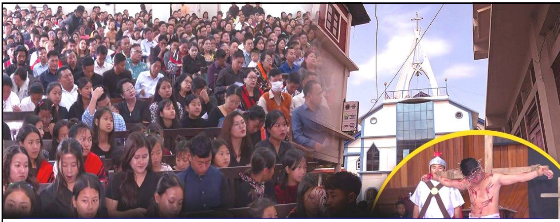
April 03, 2026 nü Manipur Baptist Convention Centre Church nung Good Friday anogomong nung tekülem sentong agidang tangokba noksa nung angur.

April 04, 2026: April 03, 2026 nü Good Friday anogomong nung India tesem ajaklen Khristantemi sarasadema amongba den külemi sentong balala ayongzuka agiogo.