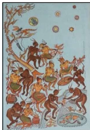
Khongjomnubi: The Pleiades