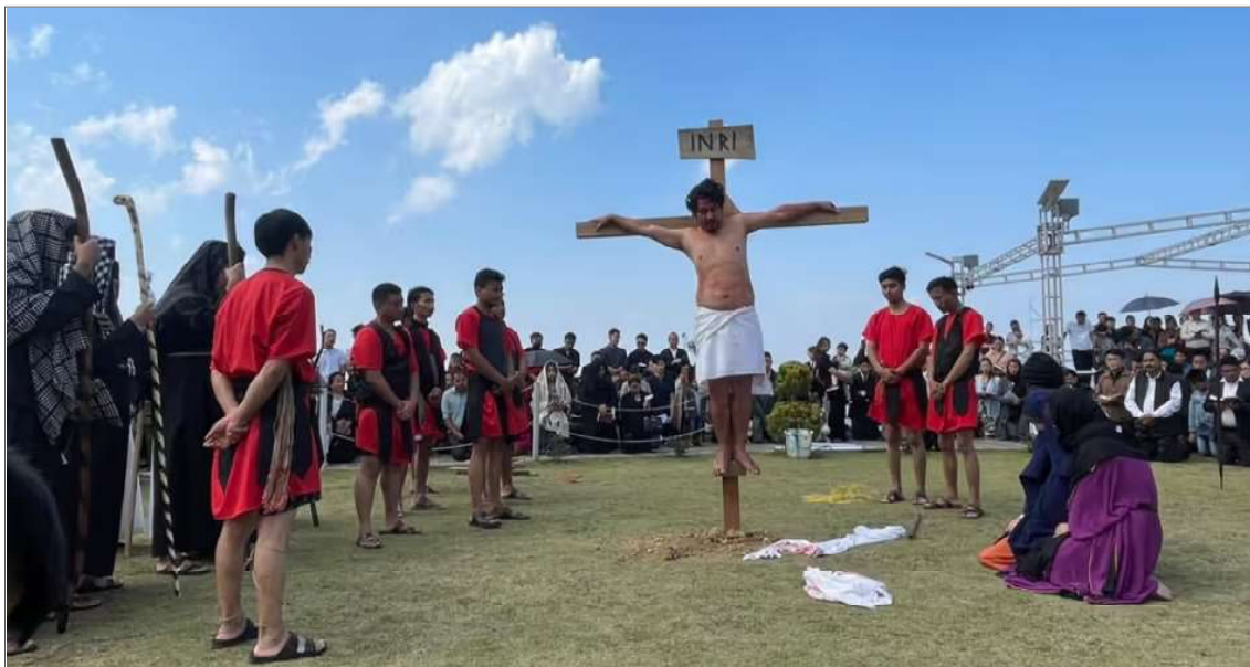
April 3, 2026 nü Kohima nung Mary Help of Christians Cathedral nung Good Friday amungdang Cathedral Catholic Youth Movement ajanga Passion of Christ ia sayuba noksa nung angur.

Dimapur Dimapur Deputy Commissioner office tasenba ya 2-storey office complex ka asütsü aser küm ana nung Rs 14.97 crore endoka yanglutsü sentong lir.