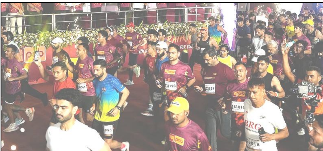
Nehru Stadium nung Soldierathon Delhi 2026 Half Marathon sentong ayongzüka agidang tangokba noksa nung angur. Iba sentong ya Punjab National Bank-i ayongzüka.

"Onoki elections nung terenlok agütsüsang Ato kilonser Narendra Modi tenüing nung tokteper. Kashmir nungi tenzüka Kanyakumari tashi nung nüburtemi pa dak tamang kateter," ta state BJP Tirisa metetdaksü.