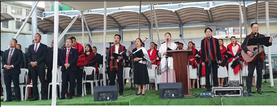
Kohima, April 05, 2026: Amongnü Khuochiezie (Kohima Local Ground) nung Khristantemi Easter tekülem sentong agidang tangokba noksa nung angur. Iba sentong ya Kohima Baptist Pastors' Fellowship (KBPF)-i ayongzüka liasü.

Kohima, Rongchii/April 05 (TYO): Amongnü Easter anogomong nung denomination aser Arogo balala nungi Khristantem Khuochiezie (Kohima Local Ground) nung adenshia Yisu Khrista shia aruba Sunrise Service tekülem sentong agiogo.