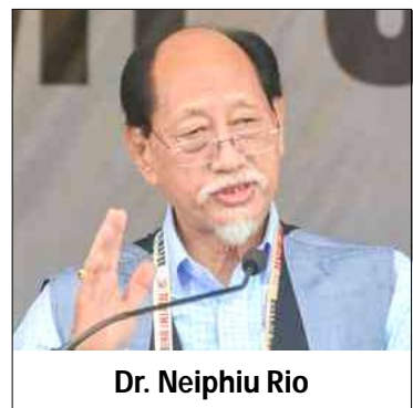
Dr. Neiphu Rio

Dimapur, Rongchii/April 05 (TYO): Honibarnü Chiephobozou nung Naga People's Front (NPF) shisadokden senden ka nung jembidang, party-i Naga nunger tajangzük, maitsü aser sobaliba wazüka ayutsü atema inyaker, ta Nagaland Chief Minister Dr. Neiphu Rio-i ashi.