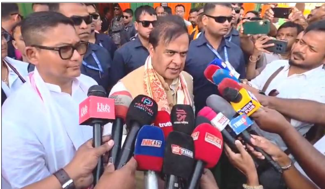
Assam Chief Minister Himanta Biswa Sarma-i April 5 nü ashiba agi, Congress lenir Pawan Khera-i pa kinungtsü Riniki Bhuyan anema taittsüba balala benokba ya aitsüogo aser pai police nem ken o bushisüingdangdaksütsü asoshi formal tashishiba ka benoktsü.

Council nung ochimashi lir ta tai tonglojka aliba onük nung telangzüba agütsüdag, party yimsüsüba mendeni arura onoki aibelener tem merenshitsü aser tang kari teka amoshitsü merangra ibaji autonomous body nung teka amoshir ama asütsü, ta Chief Minister-i ashi.