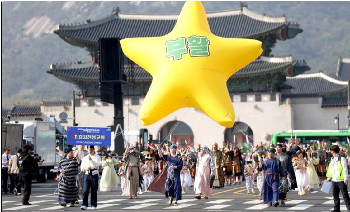
South Korea yimtiba, Seoul nung "2026 Easter Parade" nung shilem agirtem kar noksa nung angur.

April 06, 2026: April 04, 2026 nü South Korea yimtiba, Seoul nung aliba Gwanghwamun Square nung nisung 8,000 dak tali adenshia "2026 Easter Parade" nung shilem agiogo.