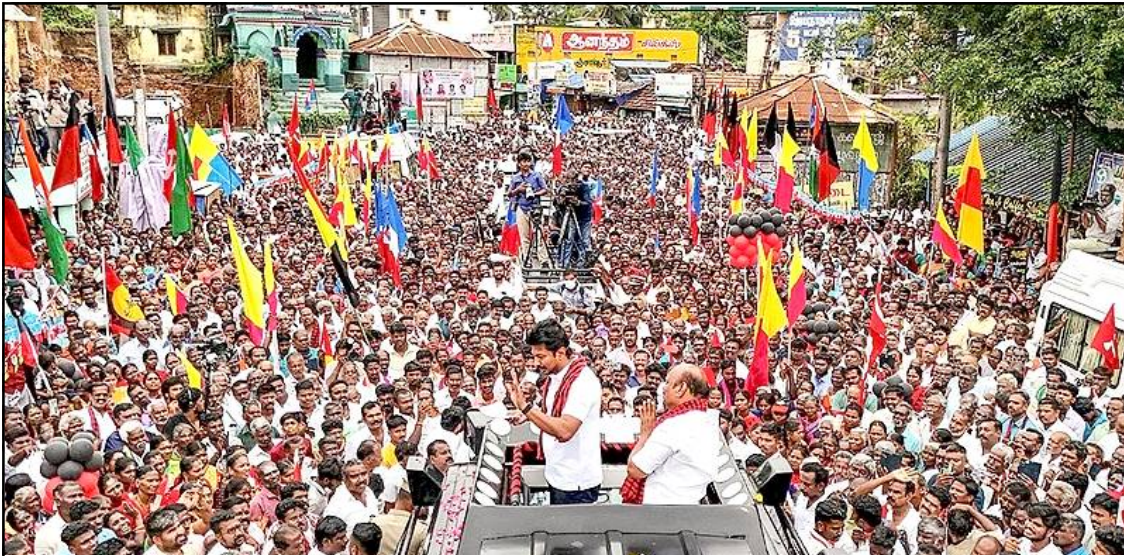
April 06, 2026 nü Thanjavur nung Tamil Nadu Deputy Chief Minister, Udhayanidhi Stalin-i party candidate, Durai Chandrasekaran atema nübo yimsüdüng tangokba noksa nung angur. Durai-i Tiruvaiyaru Assembly constituency nungi tokteptsü.