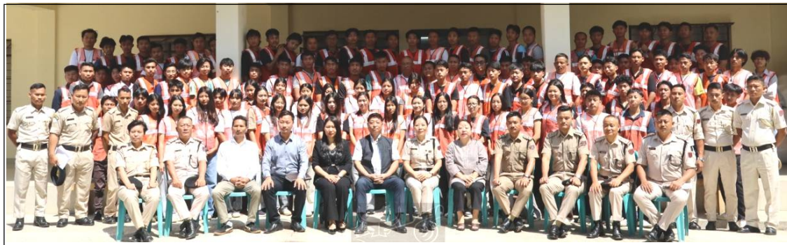
Central Training Institute (CTI), Home Guards, Civil Defence & SDRF, Toluvi, Dimapur nung ENSF atema Community First Responders Training agidang tangokba noksa ka yangi angur.

Dimapur, Rongchii/April 06 (TYO): Community First Responders Training sentong ka Eastern Nagaland Students' Federation (ENSF) züngsemtem asoshi April 6, 2026 nü Central Training Institute (CTI), Home Guards, Civil Defence & SDRF, Toluvi, Dimapur nung tenzükba liasiü.