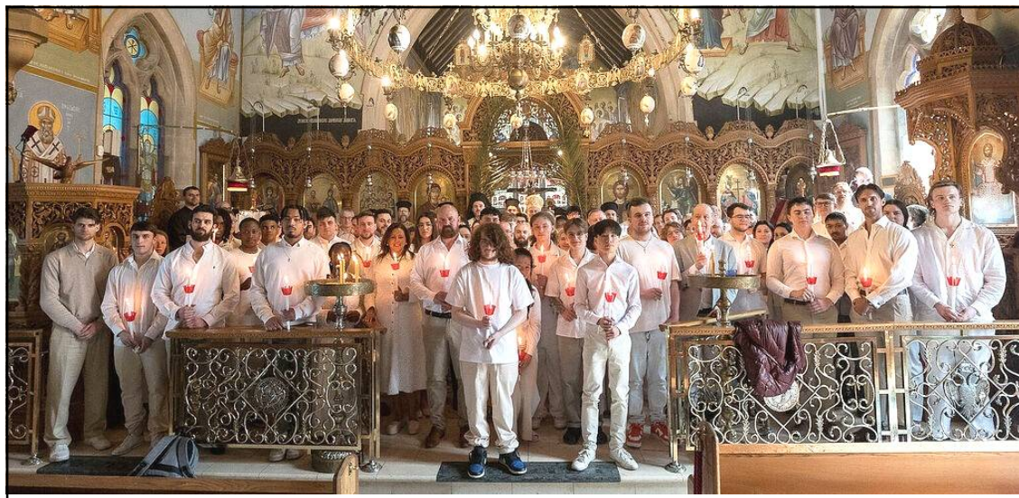
Greek Orthodox Church nung baptirtem kar noksa nung angur.

April 08, 2026: Easter mapang UK nung Greek Orthodox Church-i nisung 250 baptisüogo; baptiba sentongji linük tesem ajaklen agia liasü.