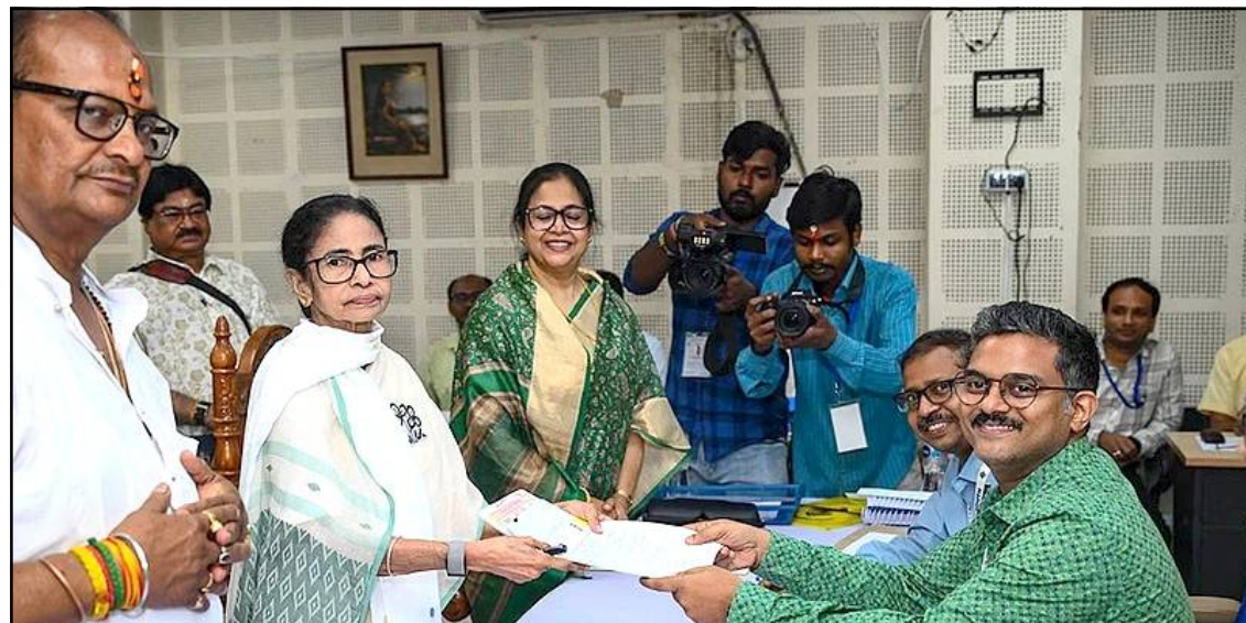
April 8, 2026 nü Kolkata nung West Bengal Chief Minister aser Bhabanipur constituency nungi TMC candidate, Mamata Banerjee-i state assembly elections nung tokteptsü atema nomination file asüandang tangokba noksa nung angur.

Tamil Nadu nung assembly election April 23 nü agütsü.