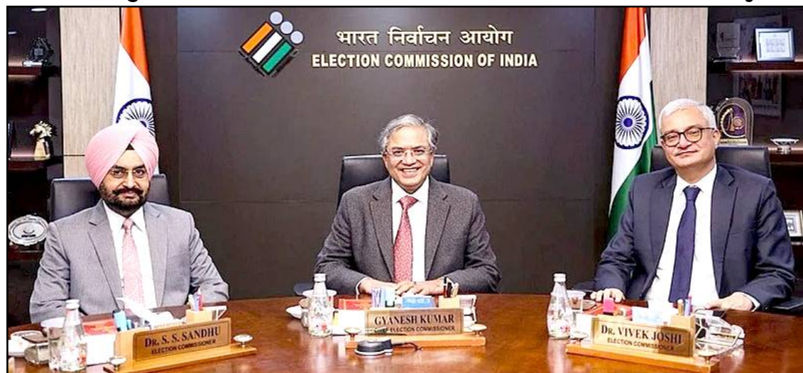
April 08, 2026 nü New Delhi nung Chief Election Commissioner Gyanesh Kumar den Election Commissioner ana- S Sandhu aser Vivek Joshi nungeri Trinamool Congress nungi telok ka ajurudang tangokba noksa nung angur.

New Delhi, Rongchii/April 08 (Agencies): Bodhbarnü Trinamool Congress (TMC) nungi teshimtet telok kati Election Commission nung tongti ketdangsertem ajuru, ajisiüka minute tenet tsüingda parnok EC office toktsür oadok.